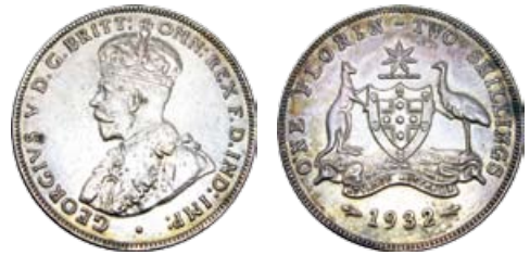
391 1932. Key date. Purple/blue tone. Rare. gEF $2800-3000