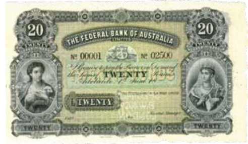
125 Twenty Pounds The Federal Bank of Australia Limited Specimen. Adelaide 1-6-18-- (c1888). (MVR 1). Extremely rare. aUNC $27000-29000