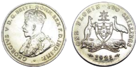
386 1921. Lightly cleaned, well struck with strong band and crown. UNC/Ch.UNC $3100-3200