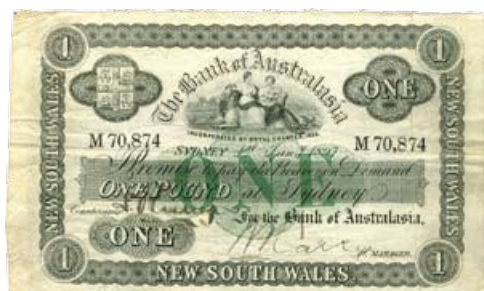
116 One Pound Bank Of Australasia, Sydney. 1-1-1897 (MVR 2c). Fully signed and issued, lovely waxy paper and rare in this grade. Apparently Ex. an ANZ Bank Manager, who bought the note a long time ago for 5 Pounds and a bottle of Scotch! VF $25000-26000