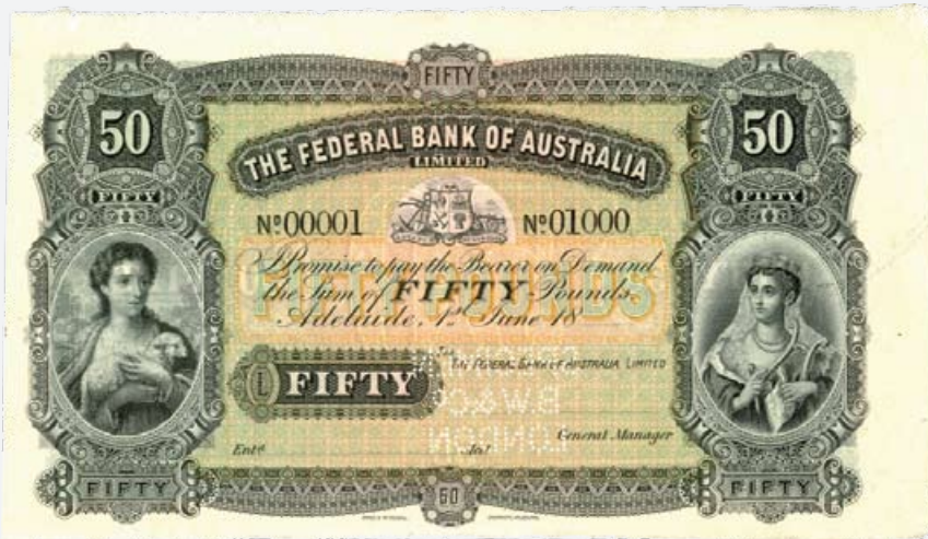
126 Fifty Pounds The Federal Bank of Australia Limited Specimen. Adelaide 1-6-18-- (circa 1888). (MVR 1). Extremely rare. aUNC $29000-30000