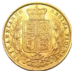
270 1877S Shield. Well struck example. Ch.UNC