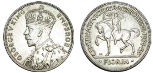
392 1934/5 Melbourne Centenary. Nearly full wreath. A nice example. Ch.UNC/GEM $700-800