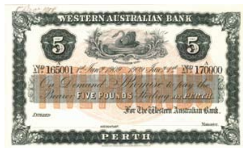
119 Five Pounds Western Australasia Bank Specimen. Perth 1-1-1909. (MVR 3c). Rare. aUNC $18000-20000