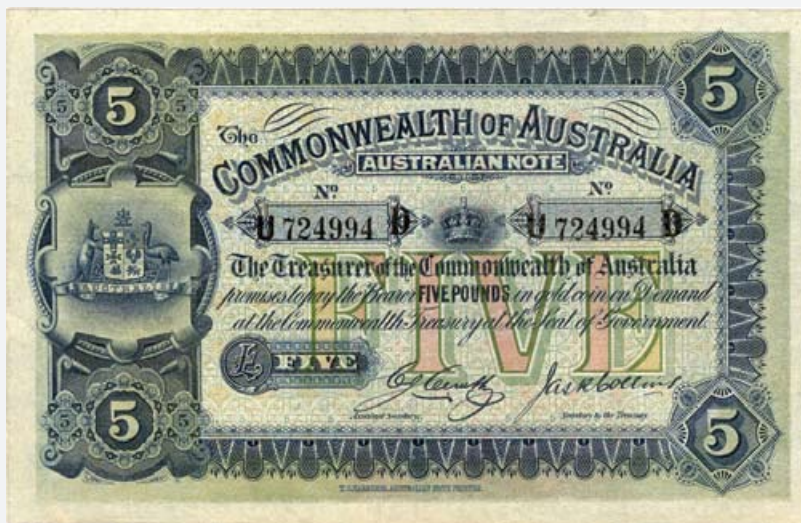
183 1918 Cerutti-Collins (R 37b). Nice strong colour and an attractive example that would make an ideal type note. Scarce. aEF $30000-32500