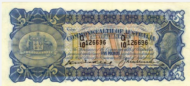
186 1927 Kell-Heathershaw (R 40). Crisp, original note with only very minor handling. Nearly identical to the note we sold in Sale 66 for $100,500 (including buyers premium), and was in fact originally from the same small batch discovered in the late 90's. Ex IAG Sale 56 2002, and probably the second or third finest known. aU/UNC $84000-85000