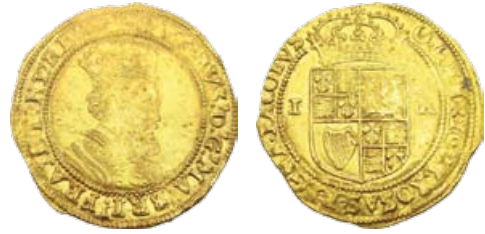
226 Gold Double Crown James I 1617-18. Fifth bust (S 2623) mm crescent. aVF $1200-1400