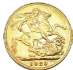
281 1920M George V. A good example of this rare date. gEF