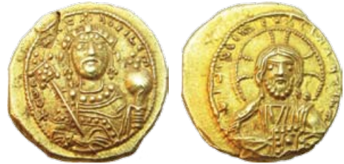
478 Byzantine Constantine IX 1042-1055. Stamenon (S. 1828). Obverse Christ bust facing, Reverse Constantine IX. gEF