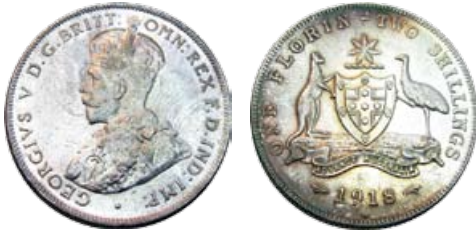
384 1918. Light gunmetal and red tone. UNC/Ch.UNC $1700-1800