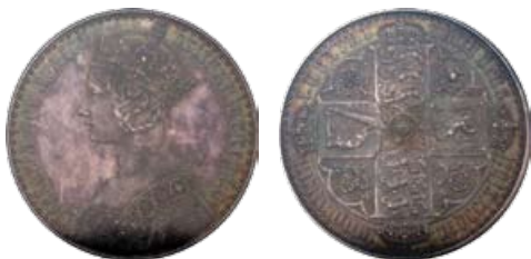
225 Proof Crown 1847. Gothic Type, with plain edge. NGC graded PF 62 (S 3883 var). Dark toned with hints of red and green, very minor surface marks. Extremely rare. FDC $13000-14000