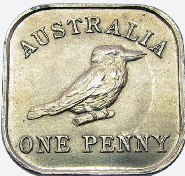
326 Kookaburra Penny 1921. Type 12. Rare. A nice example with some very light tone. Ideal type coin. UNC