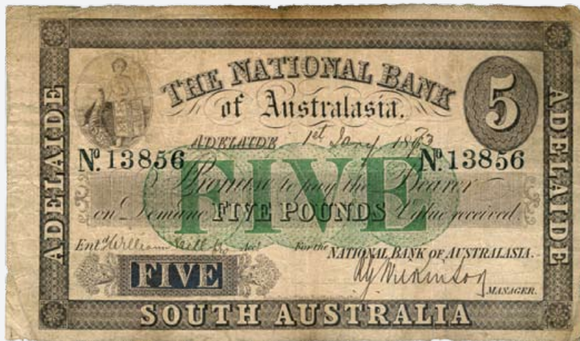
120 Five Pounds National Bank of Australasia, Adelaide. Fully signed and issued 1-1-1873 (MVR 2c). Attractive grade and appearance, with nice clear details. Extremely rare, with only 2 or 3 examples known. gFINE