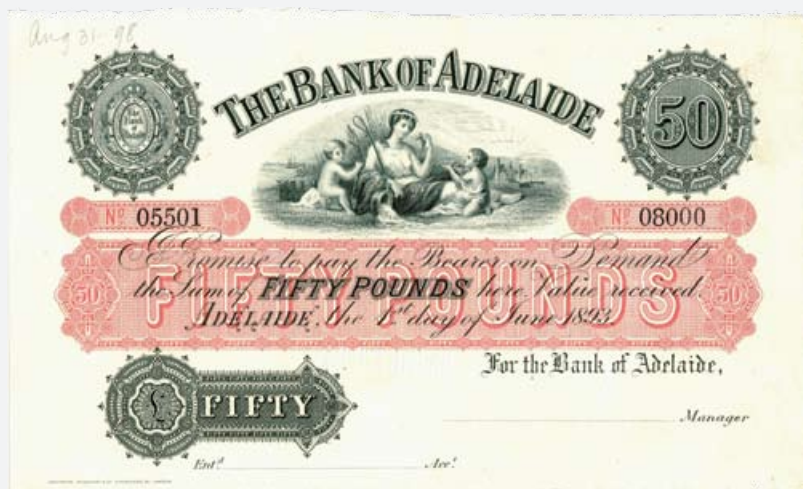
127 Fifty Pounds The Bank of Adelaide Specimen. Adelaide 1-6-1893. (MVR 2a). Very rare. aUNC $23000-24000