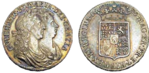
219 Half Crown 1689. William and Mary. Attractive old tone. Scarce. aEF $1600-1700