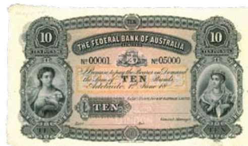
123 Ten Pounds The Federal Bank of Australia Specimen. Adelaide 1-6-18-- (1-5-1888 written in pencil). (MVR 1). Very rare. aUNC