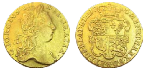
228 Gold Guinea 1766. George III (S 3727). Scarce. aEF $1300-1400