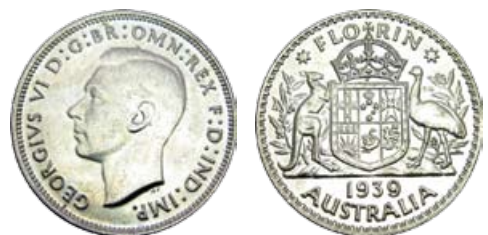
394 1939. Key date. Lustre and mint bloom. UNC $1500-1600