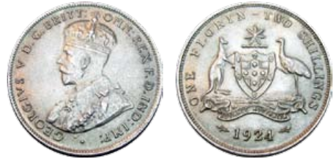
388 1924. aU/UNC $1600-1700