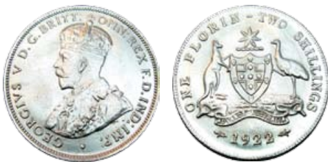
387 1922. Scarce date. UNC/Ch.UNC $5250-5500