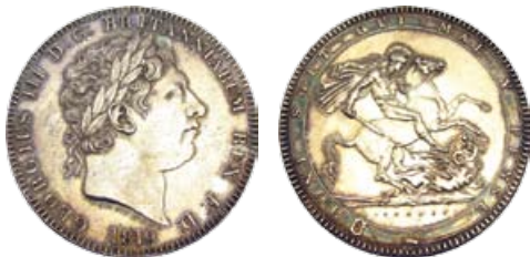
224 Crown 1819 LX. George III. Attractive tone. Scarce. UNC $1300-1400