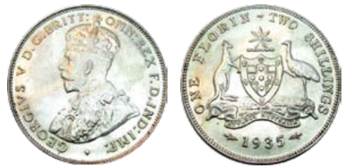
393 1935. Sharp strike with mint bloom. Ch.UNC $1200-1300