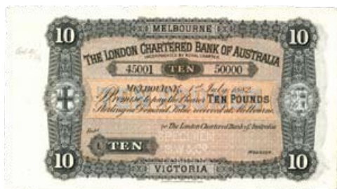
122 Ten Pounds The London Chartered Bank of Australia Specimen. Melbourne 1-7-1882. (MVR 2a). Rare. aUNC