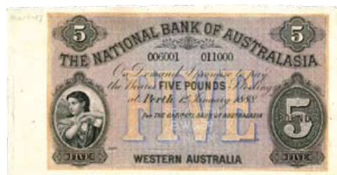
118 Five Pounds The National Bank of Australasia Limited Specimen. Perth 1-1-1888. (MVR 4a). Very rare issue on Perth. aUNC $19000-20000