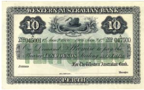
124 Ten Pounds Western Australasia Bank Specimen. Perth 1-1-1906. (MVR 3c). Very rare. aUNC $25000-27000