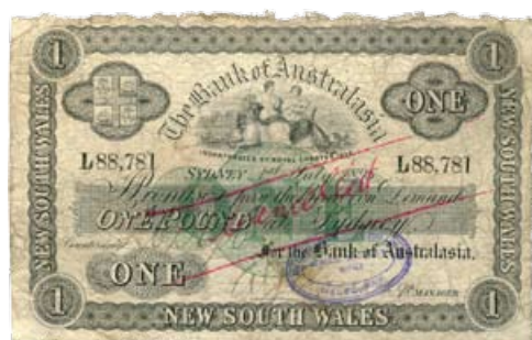
115 One Pound Bank of Australasia Sydney 1-7-1895. Fully signed & issued. (MVR 2c). Cancelled in red & with bank stamp that reads "Australia & New Zealand Bank Ltd. General Managers Office, Melbourne". Scarce. aFINE $13000-14000