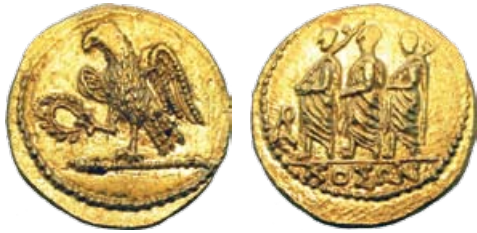
472 Ancient Greece Gold Thrace. Kingdom of Koson circa 42BC. Gold Stater (S.1733). Almost as struck. aUNC