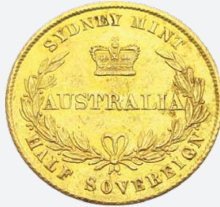
265 1860/5 Sydney Mint. Type II Reverse. Extremely rare date variety overdate 6/5. Probably the finest known and superior to the Prately coin. aUNC