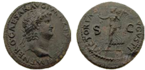
476 Roman Imperial Nero AE Dupondius 54-68 AD. (S 1969). Reverse Victory standing left. Nice portrait. gVF