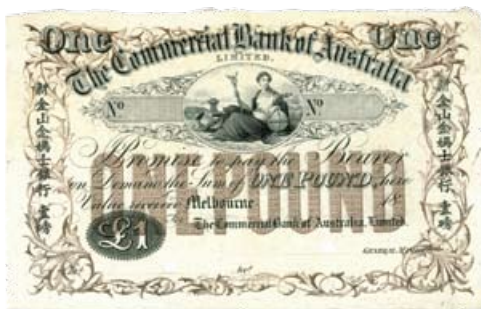
114 One Pound The Commercial Bank of Australia Limited Specimen. Melbourne 18--. (MVR 1). Scarce. aUNC $15000-16000