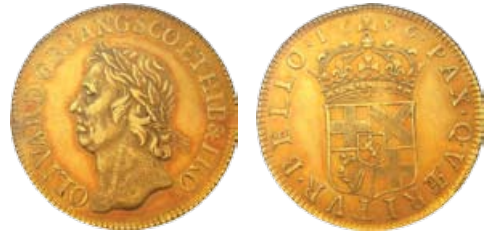
227 Gold Broad 1656. Oliver Cromwell. NGC graded AU 58 (S 3255). Catalogues at GBP 11,000 in EF. Extremely rare. gEF/aUNC $26000-27000