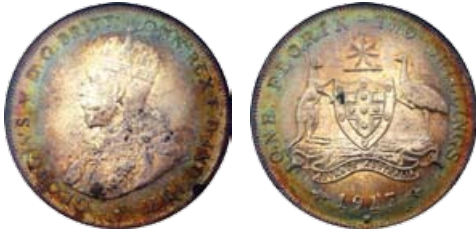
383 1917. Peripheral red and green toning. NGC graded and cased MS 63. Ch.UNC $2700-2800