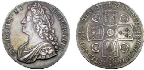
223 Crown 1741. George II. (S 3687). Scarce. VF $1200-1400