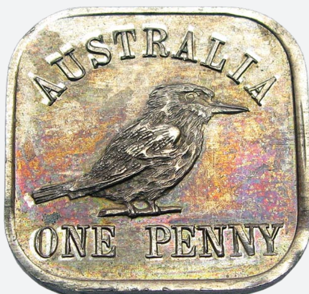
325 Kookaburra Penny 1921. Type 11. Lovely old red and blue tone. A very attractive example, and far rarer than the Type 12 it is always compared to. Very rare. FDC