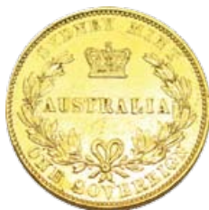
269 1856 Sydney Mint. Some mint lustre. Rare. aEF/EF