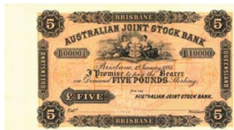
117 Five Pounds Australian Joint Stock Bank Specimen. Brisbane 1-1-1884. (MVR 2a). Very rare. aUNC $17000-18000