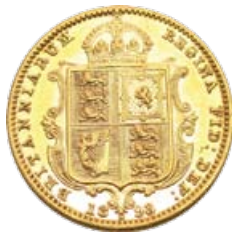
268 1893M Jubilee Head. Mint lustre. aU/UNC