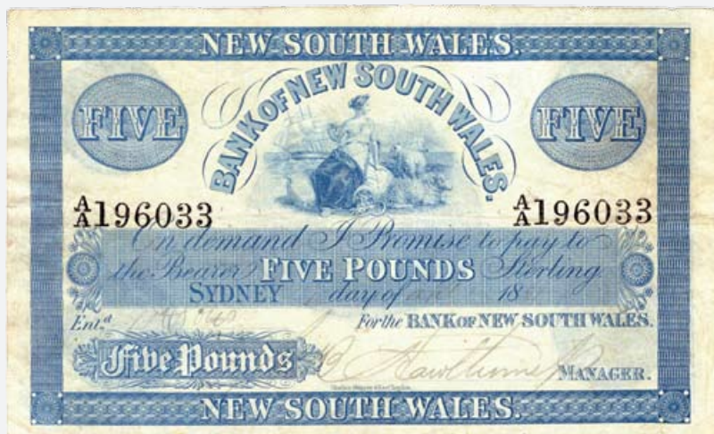
121 Five Pounds Bank Of NSW, Sydney. Fully signed and issued 1-4-1881 (MVR 7c). A superb grade for a Pre Federation note, and very attractive. Very rare, especially this nice. gVF