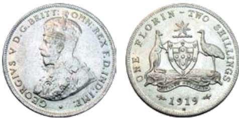
385 1919. aU/UNC $2700-2800