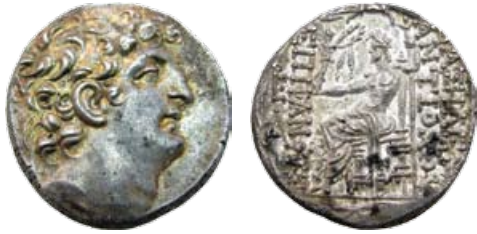
471 Ancient Greece Syria Tetradrachm. Kingdom of Antiochos VIII 121-96 BC (cf S.7143). aEF