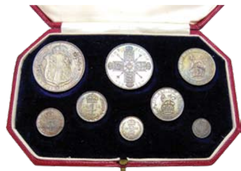
229 Cased Specimen Set 1911 George V. 8 coin set including Maundy coins. Lovely old tone. FDC $650-700