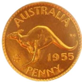
LOT 332A & 332B