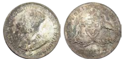
403 1917. Well struck with superb old dusty tone. A few contact marks on Obverse. Ch.UNC/GEM