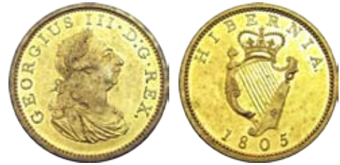
17 Ireland Gilt Proof Copper Penny 1805 George III. (S 6620). Scarce. FDC $1300-1400