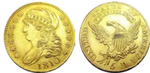
264 USA 5 Dollar 1810. Large date, capped bust of Liberty. A small hairline scratch through cheek on Obverse. Ex Stack's sale 24-4-07. MS 63. Very rare and superb. Ch.UNC