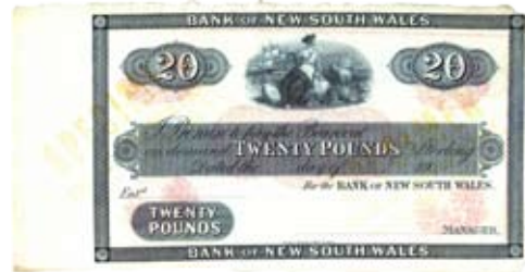
129 Twenty Pound Bank of New South Wales Specimen. Stamped specimen twice in faded ink, printed by C. S & East 19-- (MVR 7f). Scarce. EF