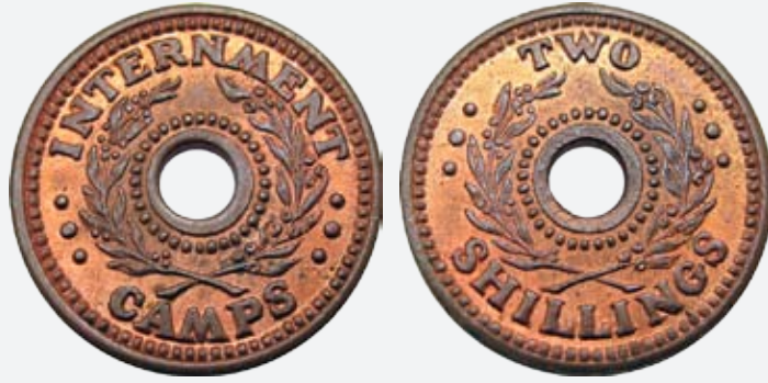
448 Internment Camps WW II Two Shillings. Full brilliant mint red, and the best example of this coin I have seen. Very rare this grade. Ch.UNC/GEM