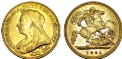
268 1893S Veiled Head. Scarce. UNC