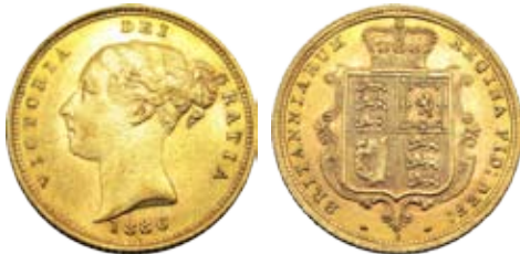
267 1886S Young Head Shield. Very rare. UNC