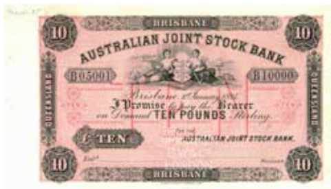
126 Ten Pound Australian Joint Stock Bank Specimen. Brisbane, 1-1-1884 (MVR 3a). Very rare. UNC