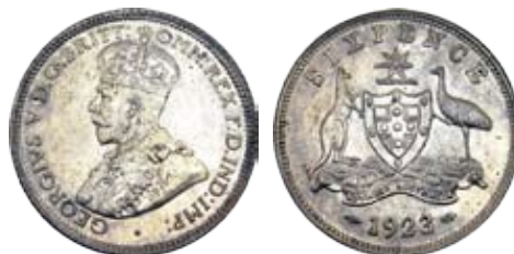
380 1923. Sharply struck, especially the specimen like rim. Attractive green/blue tone. Ch.UNC/GEM