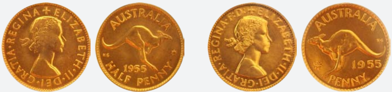
332 Proof Halfpenny and Penny 1955Y pair. Both PCGS graded; PR 63 & PR 62 respectively. Full brilliant proof mint red superior examples. Rare. FDC