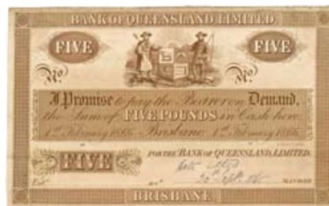
123 Five Pound Bank of Queensland, Limited, Brisbane 1-2-1866. (MVR 1). Uniface colour proof, pencil notations and date 20-09-1865 on front. Extremely rare issue from this short lived bank. aUNC