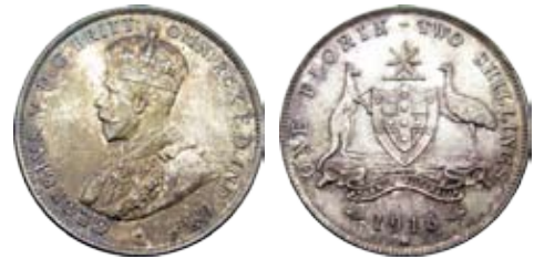
401 1916. Lovely purple and blue steel tone. Ch.UNC