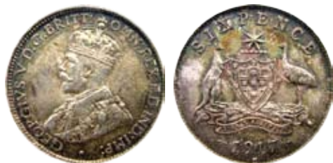
377 1917. Light toning and some mint bloom. An attractive coin. Ch.UNC/GEM