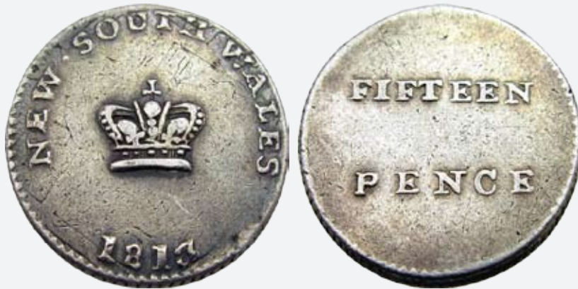
326 Dump 1813 NSW. Type D/2. A superb example, fully struck up, with strong lettering both sides, a clear strong crown and good milling. Some attractive undertype on the obverse. A superior example that would rank well inside the top 10 known. aEF/EF