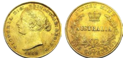
275 1868 Sydney Mint. Type 2. A fresh coin in near mint state. Rare. UNC