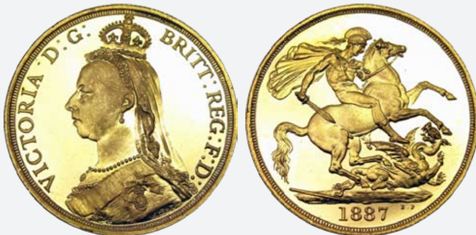
330 Gold 2 Pound 1887S Second Die type. Brilliant frosted mirror finish, with full unmarked mirror fields and superb eye appeal. The finest of the 4 known of this type, and the only one in original condition. An under rated coin, as 20 years ago this catalogued at $35,000 which at the time was equivalent to 5 Proof 1938 Crowns, very nearly both a Type 1 Kookaburra Halfpenny and Type 10 Penny, or both an EF Dump and an aVF Holy Dollar together! Extremely rare and very attractive. Probably struck in 1926 at the Sydney Mint for presentation to VIP's. Ex Spink (Australia) November 1986, Sale 20. A highly important and beautiful piece. FDC