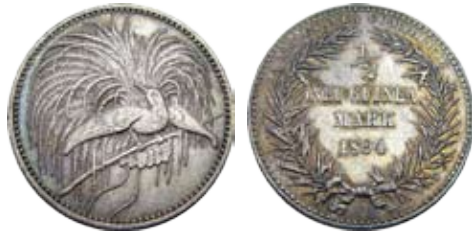
11 German New Guinea Half Mark 1894A. Toned. EF $550-600