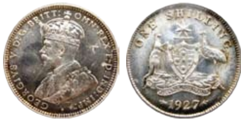
396 1927. Attractive peripheral toning and some mint bloom with nice eye appeal. PCGS graded and cased MS 63. Ch.UNC