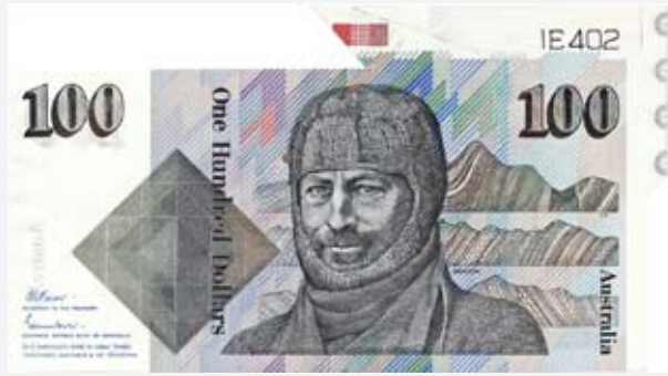
325 One Hundred Dollars 1985. Massive corner flap on right hand side, 10cm x 4.5cm. Also has part colour bars and edge guides. Small tear on top from error. Very rare as such a massive error. aU/UNC