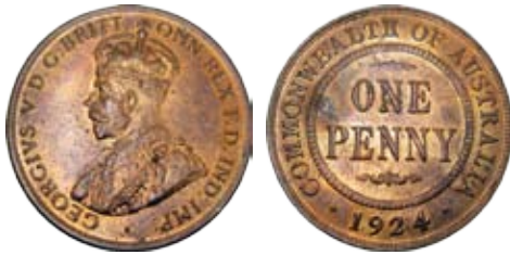
353 1924. Mint red and brown. Ch.UNC