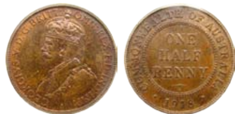
338 1918I. Red and brown, with nice red and purple lustre on Obverse. PCGS graded and cased MS 64 BN. Rare this grade and one of the finest known. Ch.UNC/GEM