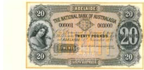
128 Twenty Pound National Bank of Australasia Specimen, South Australia. Adelaide, 1-11-1893 (MVR 4a). Extremely rare. UNC