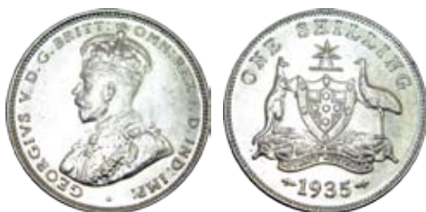
398 1935. Scarce this grade. Ch.UNC/GEM