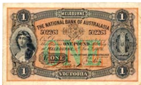
122 One Pound National Bank of Australasia, Melbourne 1-1-1906. (MVR 4mb). Fully signed and issued. A superior example with crisp fresh paper and good colour, making this very attractive. Issued pre federation notes in this grade are particularly rare. One of the finest known. aVF