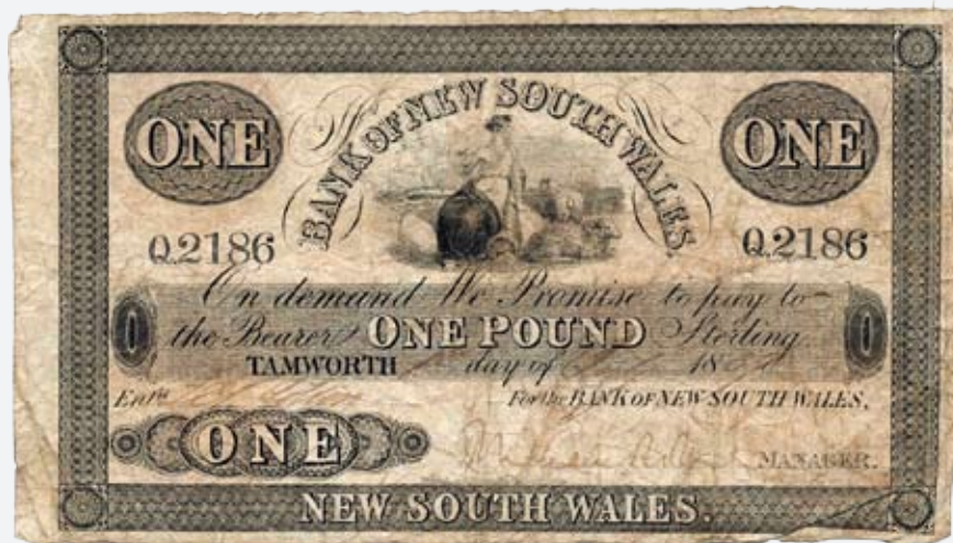
116 One Pound Bank of New South Wales, Tamworth 1869. Fully signed and issued 1-7-1869 (MVR 7var). Similar to the 7c type, but of a design type not listed. A whole note, with some minor folding. Extremely rare if not unique on this domicile. VG/aFINE