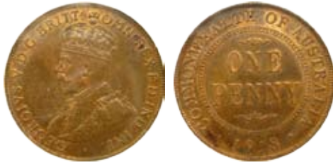
352 1918L. Brown and red, with nice red lustre around the rims. PCGS graded and cased MS 63 BN. Scarce. UNC/Ch.UNC