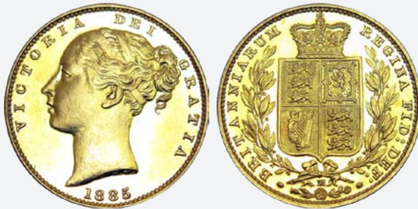
329 Proof Sovereign 1885M Shield. Superb blemish free coin, with a brilliant finish. An extremely rare gold proof, this coin the finest of 2 known, and a superb example. Probably also the finest gold proof I have ever sold. Extremely rare. FDC