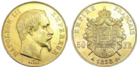
261 France 50 Francs 1858A. Napoleon III. gEF