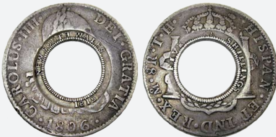
327 Holey Dollar 5 Shillings 1813 NSW. Struck on an 8 Reales 1806 Mexico City Mint Charles IV. Ex Kain Family Braidwood NSW for over 100 years. Only the second time ever offered. Host coin is a pleasing aVF, with upright counterstamps on both sides. Rare. aVF/C.S. gVF