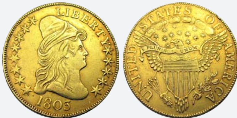
265 USA 10 Dollar 1803. Heraldic Eagle, small stars. Ex Stack's sale 24-4-01. AU 50. Attractive, and very rare. gEF/aUNC