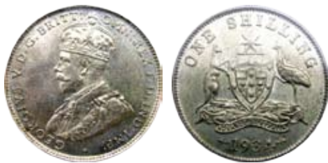
397 1934. Good strike and hard to find in this grade. PCGS graded and cased MS 64. Ch.UNC/GEM