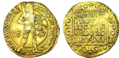
263 Netherlands Utrecht Gold Ducat 1647. gVF