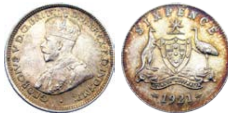
379 1921. Superb mint state with lovely "patina" and red toning. A fantastic coin. GEM UNC