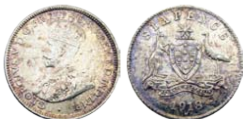
378 1918. Well struck with sharp feathers and some attractive blue toning. Scarce. Ch.UNC/GEM