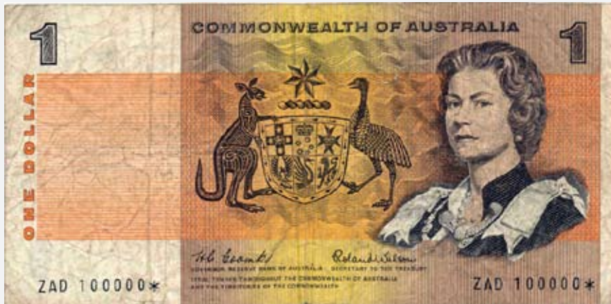
452 One Dollar 1966 Coombs-Wilson (R 71s). Starnote with 7 digits, serials 100 000*. Hand stamped in the same manner as a million serial numbered note. Unique, being the only Decimal example known (a superb 5 Pound also exists). Large tear at top, and worn. A highly important note. VG