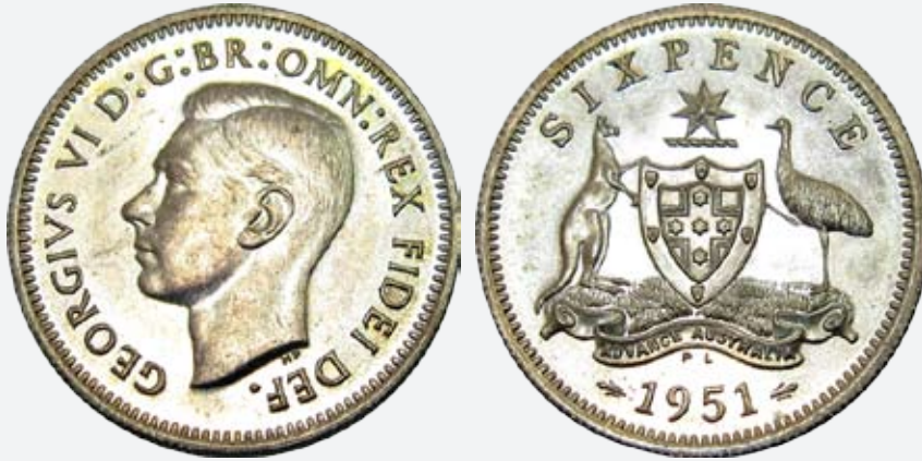
334 Proof Sixpence 1951PL. A superior example, with light gunmetal/salmon toning and a virtually perfect finish. The best of this date I have seen. Very rare. FDC