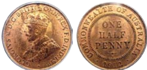
336 1912H. Full mint red. PCGS graded and cased MS 64 RD. Ch.UNC/GEM