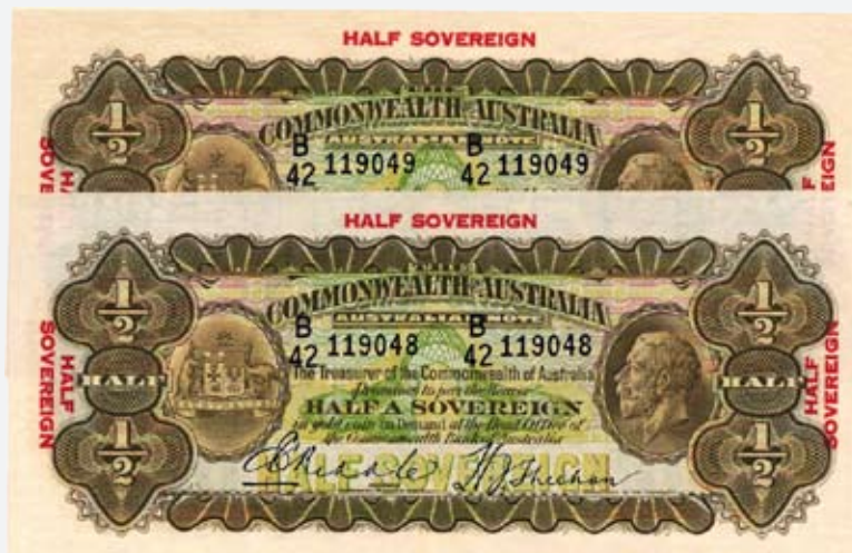
138 1933 Riddle-Sheehan (R 8b). Thin signature type. Consecutive pair. Original superb condition pair with light traces of pay packet bends. Very rare in pairs. A new find, and one of only 3 known pairs, with this lot being the highest recorded in grade. aU/UNC