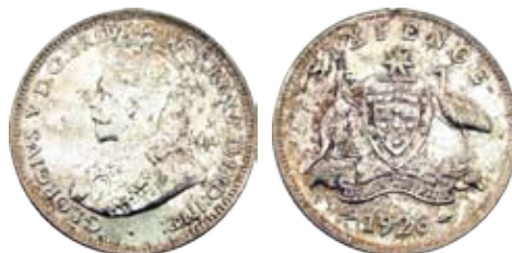
382 1926. Attractive old tone and some mint bloom. Tiny edge bump on Reverse. Ch.UNC