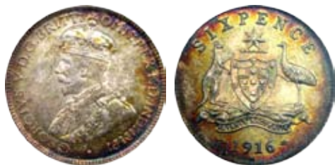
376 1916. PCGS graded and cased MS 64. Superb red and blue toning. Ch.UNC/GEM