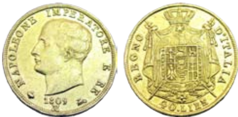
262 Italy 40 Lire 1809M. gVF