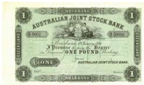
119 One Pound Australian Joint Stock Bank Specimen. Brisbane, 1-1-1884 (MVR 3a). Rare. UNC