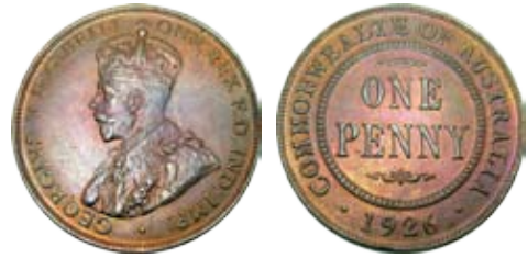
355 1926. Nearly full mint red. Tough date, especially in this grade. Rare. UNC/Ch.UNC