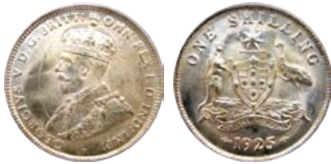
395 1925/3 Overdate. Some light toning and mint bloom. PCGS graded and cased MS 64. Ch.UNC/GEM