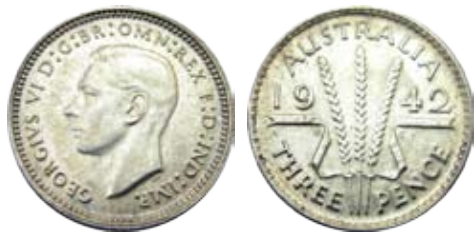
374 1942S. Rare this grade. UNC/Ch.UNC