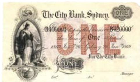
117 One Pound The City Bank of Sydney Specimen. Sydney, 26-1-1869 (MVR 2c). Rare. aUNC