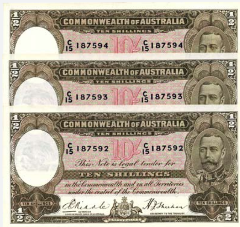
140 1933 Riddle-Sheehan (R 9). Consecutive trio. A new find and previously unrecorded. An amazing consecutive trio of a note that is impossible to find in UNC, let alone as a trio. Should actually attract at least a 50% premium for the rarity as such. A truly great highlight and one of the best banknote lots we have offered in a long time. UNC