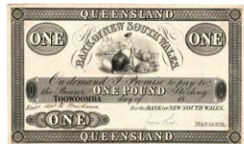
118 One Pound Bank of New South Wales black and white Specimen Queensland. Toowoomba, 18-- (MVR 7). With annotations on note. Printed by Perkins, Bacon and Co. Very rare, if not unique. gEF