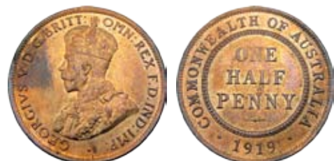
339 1919. Full mint red. Ch.UNC