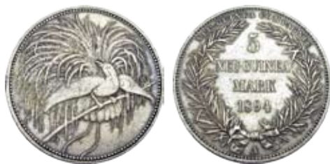
14 German New Guinea 5 Mark 1894A. Dark tone. gVF/aEF $1700-1800