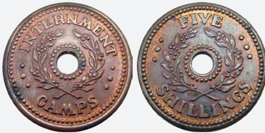
449 Internment Camps WW II Five Shillings. Mint red and brown. Scarce. UNC/Ch.UNC