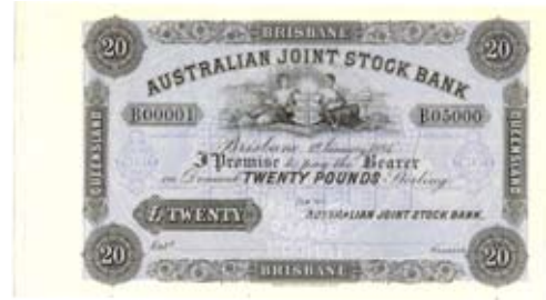
127 Twenty Pound Australian Joint Stock Bank Specimen. Brisbane, 1-1-1884 (MVR 3a). Extremely rare. UNC