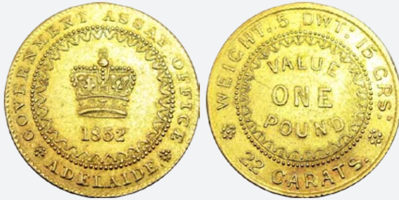
328 Adelaide Pound 1852 Type II. Attractive, if a little flatly struck but an ideal type coin. gVF/aEF