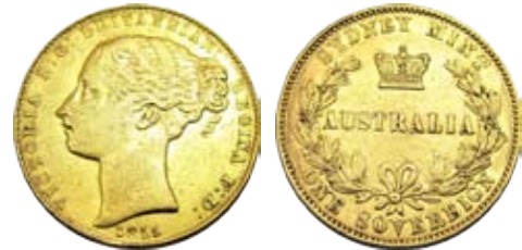
274 1855 Sydney Mint. Type I. A nice type coin. gFINE