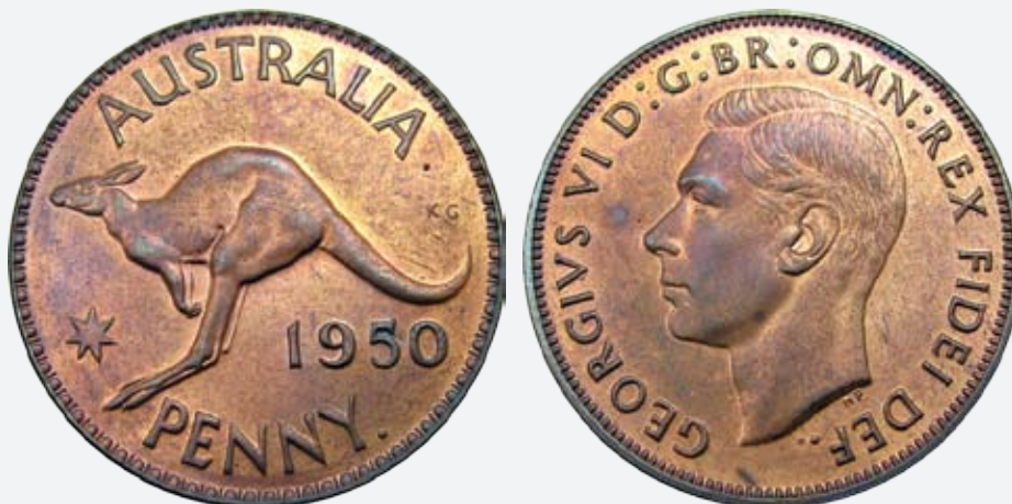
333 Proof Penny 1950Y. Attractive underlying red and purple brilliance, particularly on the obverse makes this a superior coin. A very rare George VI proof coin, and one of the finest known. FDC