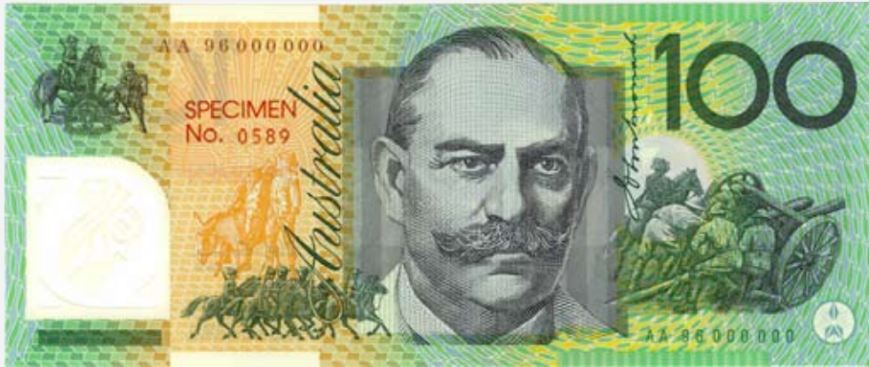
260 1996 Fraser-Evans Polymer Type 5 (SP 34). Rare. UNC