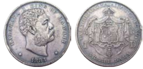
16 Hawaii Dollar 1883. Kalakaua I. Old dark tone. Scarce. aVF $425-450