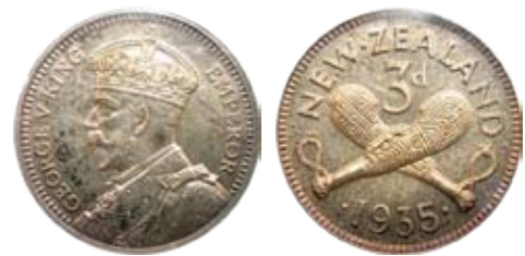
20 NZ Proof Threepence 1935. PCGS graded and cased PR 66. Superb red/golden and blue tone. Rare this grade. FDC $2600-2800