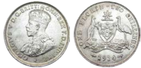
400 1914. Some light tone. UNC/Ch.UNC