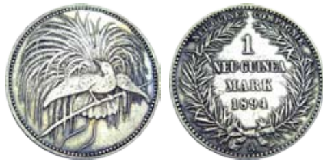
12 German New Guinea 1 Mark 1894A. VF $220-240