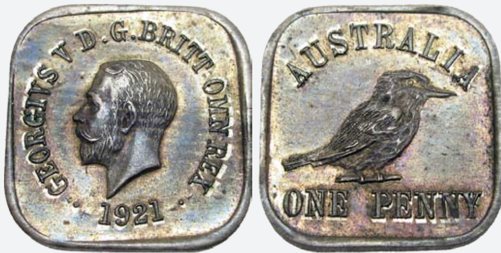
331 Kookaburra Penny 1921 Type 11. Old deep and dark metal tone with underlying red and blue brilliance. A very nice example. Far rarer than the Type 12. Rare. FDC