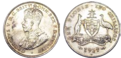
402 1917. Light tone with some bloom. UNC/Ch.UNC