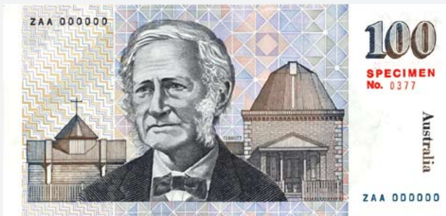
259 One Hundred Dollar 1984 Johnston-Stone Type 4 (SP 28). Rare. UNC