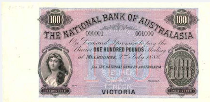
130 One Hundred Pound National Bank of Australasia Specimen, Victoria. Melbourne 2-7-1888 (MVR 3bm). A similar example sold in our sale 67 for $46,500 plus commission. Extremely rare. UNC