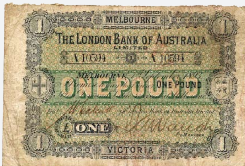
121 One Pound London Bank of Australia, Melbourne 1-9-1893. (MVR 2f). Sands & McDougall engravers, Melbourne. Emergency Issue, fully signed & issued. This note was produced locally as an emergency issue during the "Land Crash" of 1893. This note is the MVR plate note, and ex The Vort Ronald collection, where it sold for $2400; nearly double some items such as an aUNC (R 30s) or any of the pre decimal specimens which are all now worth well over $100,000 each. One of the most important pre federation issued notes. Unique in private hands. aFINE