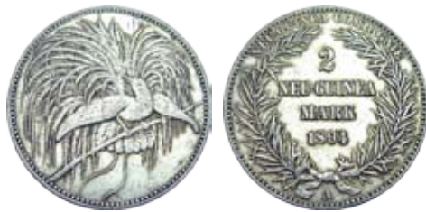
13 German New Guinea 2 Mark 1894A. gVF $600-650