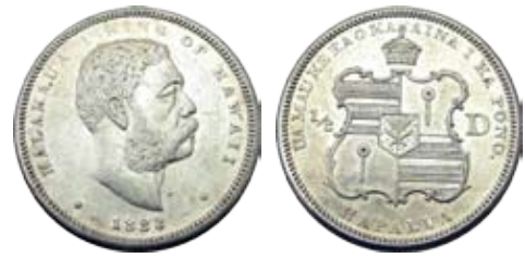
15 Hawaii Half Dollar 1883. Kalakaua I. gVF/aEF $260-280