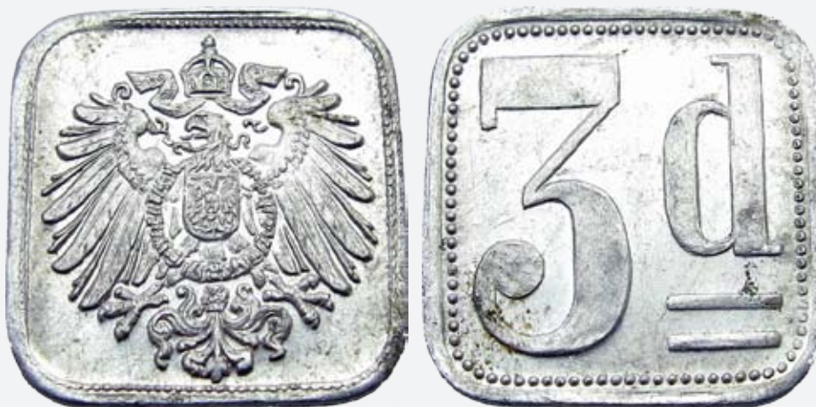
450 Internment Camps Liverpool NSW WWII Threepence. A far superior coin to the one which sold in our last sale for an incredible $3,262. Virtually as struck, and possibly the finest known. Extremely rare as such. Ch.UNC