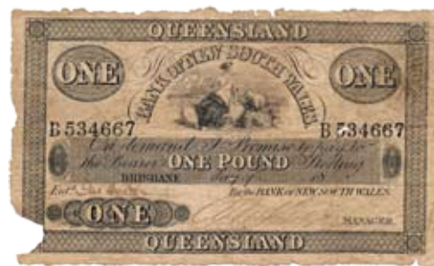
120 One Pound Bank of New South Wales, Queensland. Fully signed & issued, Brisbane 1889 (MVR 7c). Printed by Charles Skipper and East. Edge tears and worn, but still presentable. Extremely rare. POOR/VG