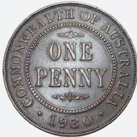
356 1930. Key date. Superb Reverse, with good top scroll, 6 clear pearls on Obverse, with trace of top of diamond. A well above average example. Rare. aVF