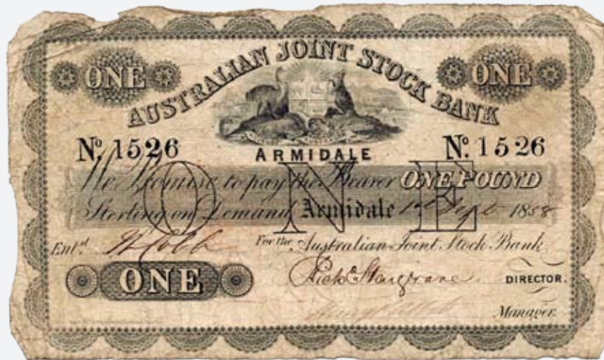
115 One Pound Australian Joint Stock Bank, Armidale 1858. Fully signed and issued 1-9-1858 (MVR 1b). Some minor edge folding, but a whole note. Excessively rare, especially on this domicile, probably the finest of 2 known. In amazing condition for a note this age. A highly important note. FINE