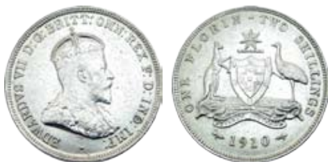
399 1910. Nice type coin. EF