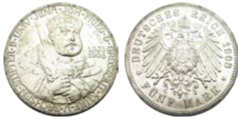
9 Germany 5 Mark 1908. Saxe-Wiemar, University. UNC $550-600