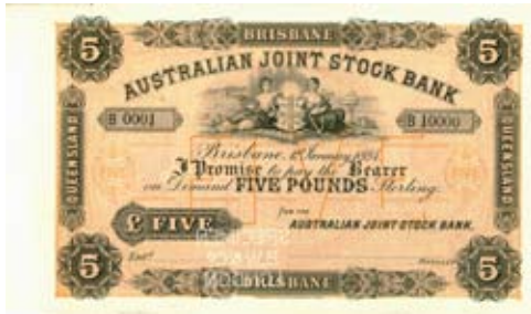
124 Five Pound Australian Joint Stock Bank Specimen. Brisbane, 1-1-1884 (MVR 3a). Very rare. UNC