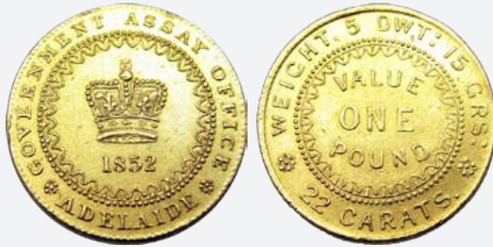
266 Adelaide Pound 1852 Type II. A nice strong strike, and an attractive looking example. Probably cleaned, and possibly ex mount. Well priced to sell. gVF/aEF