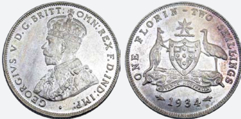
335 Proof Florin 1934. Attractive light salmon tone and mint bloom. Minor contact mark on Obverse. Rare. FDC