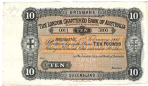
125 Ten Pound London Chartered Bank of Australia Specimen. Brisbane, 1-2-1882 (MVR 2b). Very rare. UNC