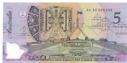
454 1992 Polymer. From first Specimen sheet release of $5 polymer. Serials AA 00 000 000. In NPA folder. Rare. UNC