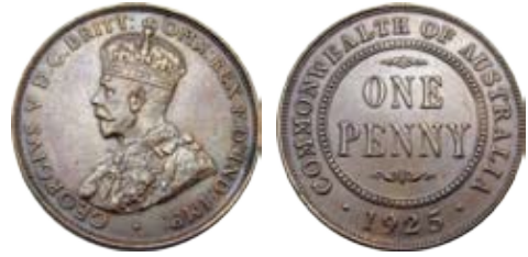
354 1925. Key date. Well struck, an even chocolate brown with hints of lustre. A nice example at this price point. Rare this grade. aUNC