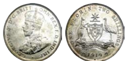
404 1919. NGC graded MS 62. Well struck, trace of toning and some mint bloom. UNC/Ch.UNC