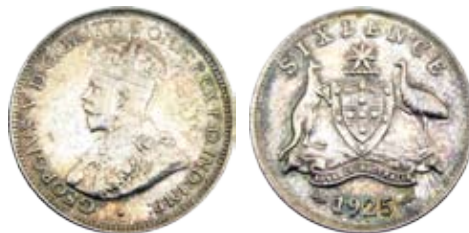
381 1925. Attractive green metal tone with some mint bloom. CH.UNC