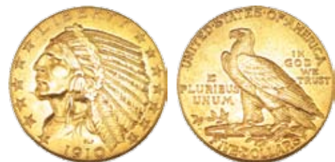
254 USA Gold $5 1910. Indian Head. VF