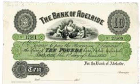
130 Ten Pound Bank of Adelaide Specimen. Adelaide 1-6-1893 (MVR 2a). Extremely rare, with only 2 believed to be known. aUNC