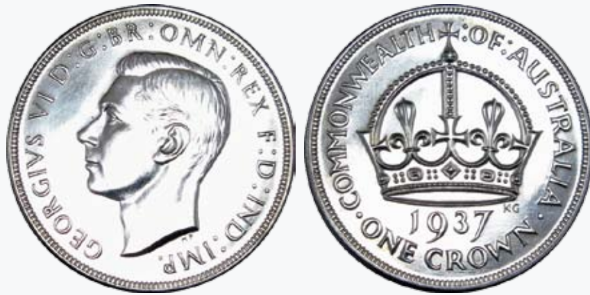
320 Proof Crown 1937. A lovely example with mark free surfaces apart from the usual die polishing marks. Nice bright coin with mint bloom and nice eye appeal. Purchased from M.R. Roberts in the 1980's. Rare. FDC