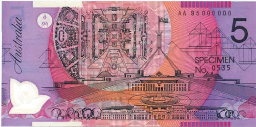
244 Five Dollar 1995 Polymer Type 5 Fraser-Evans. Overprinted Specimen in black. Not listed in catalogues, and only the second example we have seen. Extremely Rare. UNC