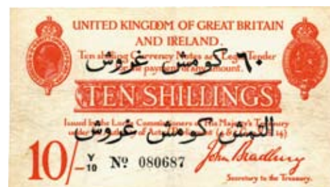
135 10 Shillings Dardanelles Campaign 1915 WW I. Overprinted Sixty Piastres on a GB 10 Shilling 1914. Used by the Anzacs at Gallipoli, Egypt and Palestine. 1 pinhole, attractive example. gVF/aEF