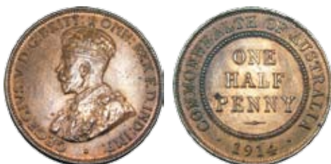
323 1914. Red and brown. UNC