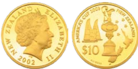
250 New Zealand Gold $10 Proof 2002. 1/2 ounce Americas Cup. FDC