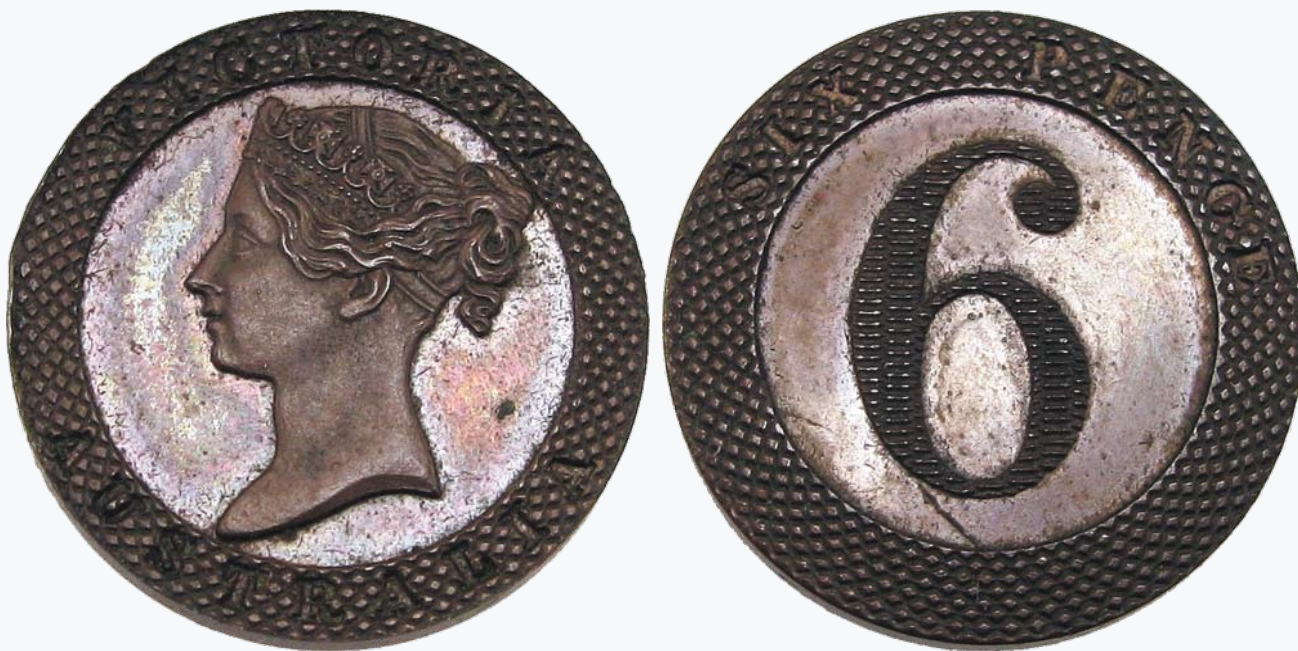
312 Taylor Pattern Sixpence Port Phillip Kangaroo Office. Struck in copper circa 1860. Plain edge type. An attractive even deep chocolate brown colour. Ex Spink Sale 26 lot 784 November 1988. (A 797 var, R 563). Very rare. UNC