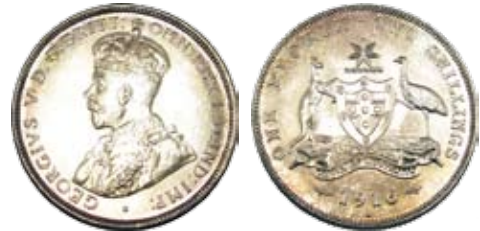
401 1916. Light peripheral tone and mint bloom. A few Obverse marks. UNC/Ch.UNC $1400-1500