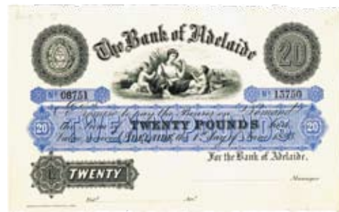
132 Twenty Pound Bank of Adelaide Specimen. Adelaide 1-6-1893 (MVR 2a). Extremely rare, with only 2 believed to be known. aUNC