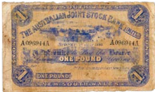
125 One Pound Joint Stock Bank Ltd, Sydney. Fully signed and issued 1-7-1893 (MVR 4b). Very rare issue and an attractive and complete example. aFINE