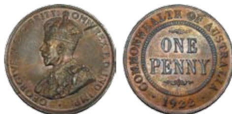
349 1922. Brown with some red. Obverse flan cracks. Originally sold for $1450. aU/UNC