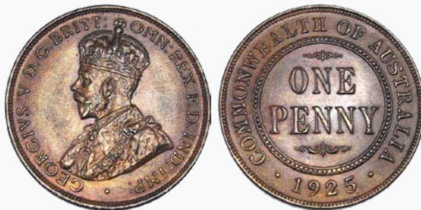
350 1925. Key date. A strong strike with a fully struck up band and clear jewels up the crown. Lovely brown and red colour, with much original underlying red lustre. Easily the best example I have seen offered in the last 5 years, if not longer. Very rare in this grade, and amongst the finest few known. Ch.UNC/GEM