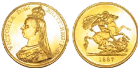
220 Gold Five Pound 1887 Queen Victoria Jubilee Head. UNC