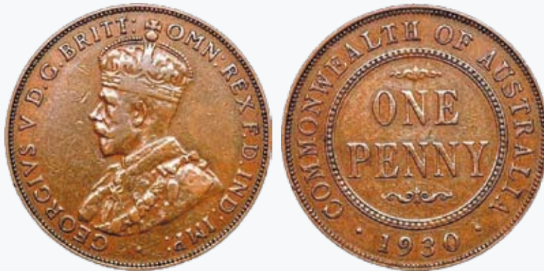
354 1930. Key date. Well struck, with a strong Reverse with a good top scroll and good clear rims. The Obverse has six clear pearls and a trace of centre diamond. Rare this grade. aVF $29000-30000