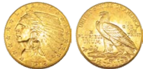
253 USA Gold $2 1/2 1912. Indian Head. aEF