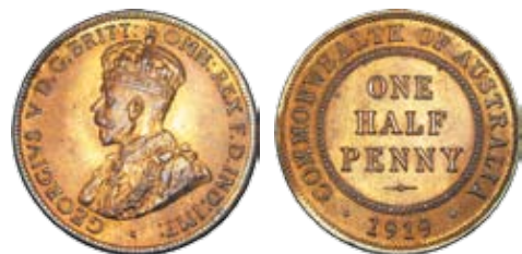
326 1919. Nearly full mint red. Ch.UNC