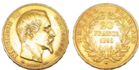
246 France Gold 20 Francs 1813A, also 1859BB (pictured above). (2 coins) FINE-aVF