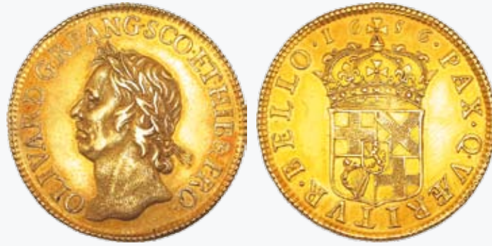
215 Gold Broad 1656 Oliver Cromwell. (S. 3255). Some lovely old red toning. A superb coin and very rare. gEF