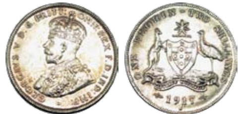
402 1917. Originally part of a silver set of 4 that had a faded annotation on a slip of paper saying it was a "specimen" issue. Superb old red/brown tone. Some slight surface marking. Scarce. Ch.UNC $1600-1800