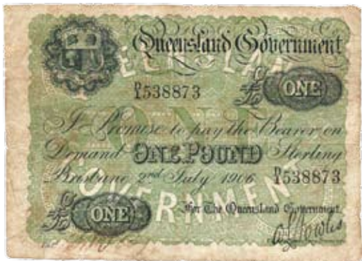
126 One Pound Queensland Government, Brisbane 2-7-1906. (MVR 2). Fully signed and issued general issue note. An attractive example in nice grade for the issue. Very rare. FINE