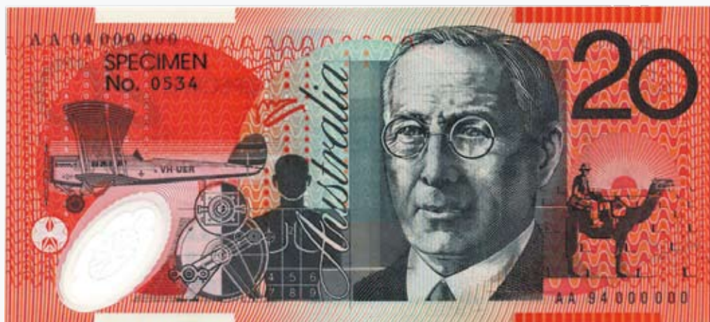
245 Twenty Dollar 1994 Polymer Type 5 Fraser-Evans. Overprinted Specimen in black. (SP 32). High catalogue value of $94,000. Very Rare. UNC