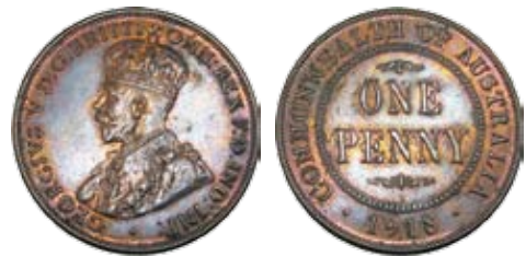
343 1918I. Key date. Well struck. Brown and purple/red. Scarce. UNC