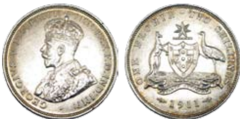
397 1911. Well struck, with some surface marking. aUNC $2100-2200