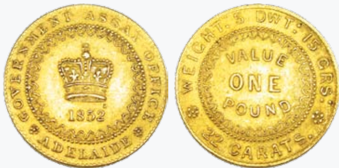
258 Adelaide Pound 1852 Type II. A nice even example with a trace of mint lustre. Rare. EF