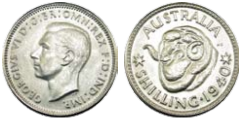
395 1940. Mint bloom. Usual light surface marks but a nice example. UNC/Ch.UNC $550-600