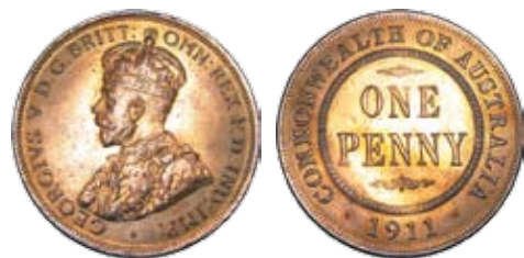
337 1911. Full mint red. Ch.UNC $900-1000