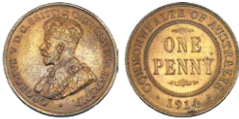
339 1914. Appears to be nearly full mint red, but possibly once lightly cleaned. Some minor marks and wear to head on Obverse. aU/UNC