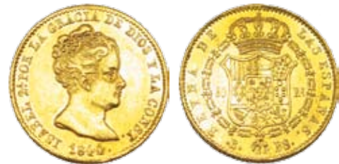
252 Spain Gold 8 Reales 1844B. aEF