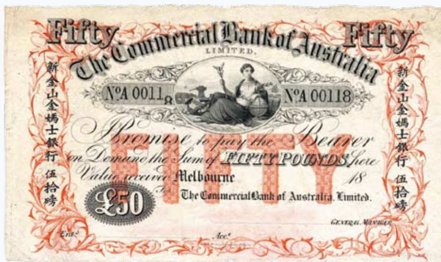
133 Fifty Pound Commercial Bank of Australia Specimen, Victoria. Melbourne 18--. (MVR 1). Very rare "Chinese Letters" issue. aUNC