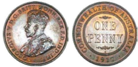
342 1917. Red/purple and brown. UNC/Ch.UNC