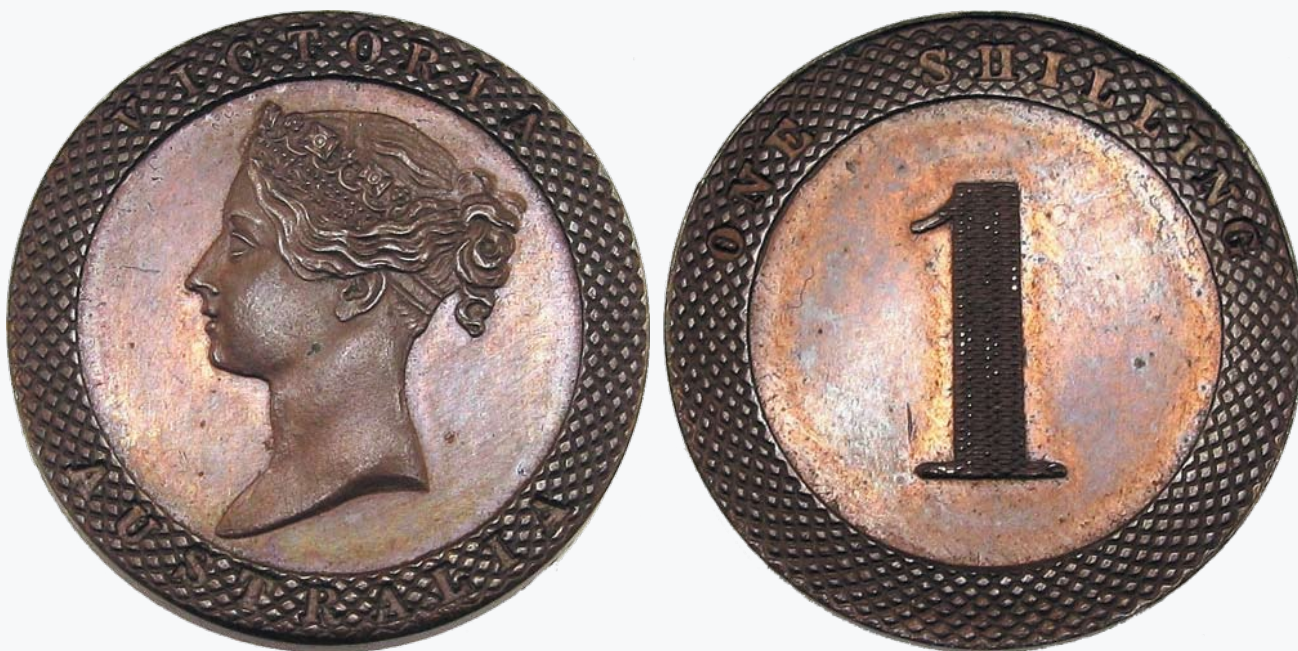
313 Taylor Pattern Shilling Port Phillip Kangaroo Office. Struck in copper circa 1860. Plain edge type. Attractive mint red and brown. Ex Spink Sale 26 lot 783 November 1988. (A 794, R 562d). Very rare. UNC