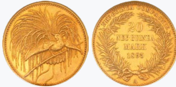
247 German New Guinea Gold 1895A 20 Mark. NGC graded MS 62. Always a popular and attractive coin. Very rare, especially in this grade. UNC