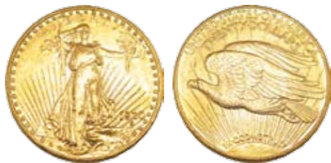
255 USA Gold $20 1920. St Gaudens. gEF/aUNC