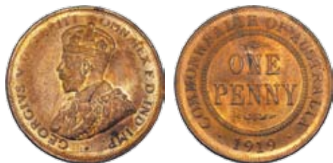
345 1919 Dot under. Nearly full mint red. Coin is struck about 10 degrees off set. Scarce. Ch.UNC