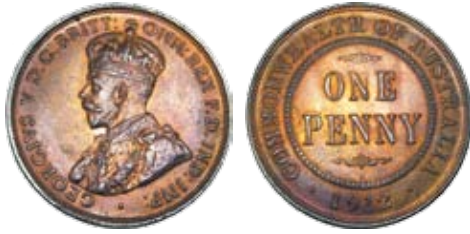
338 1912. Deep red and brown. UNC