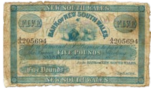
127 Five Pound Bank of New South Wales, Sydney 18-- (date unreadable). (MVR 7c). Fully signed & issued. Ex the New England hoard. Scarce. aFINE