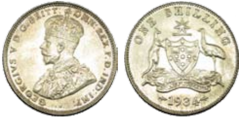
393 1934. Light tone. UNC/Ch.UNC $650-750