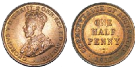
322 1912. Mint red. UNC