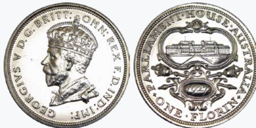
319 Proof Florin 1927 Canberra. An attractive example with bright mint bloom and original surfaces. Provenance as supplied "Ex Baldwin 1988, ex B Winsor 1994 to vendor". Rare. FDC