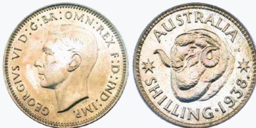
318 Proof Shilling 1938. PCGS graded PR 65. A superior grade Proof example, rarely seen as such a highly graded slabbed coin. Some soft toning with unmarked surfaces. Scarce. FDC