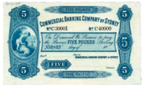
128 Five Pound Commercial Bank of Sydney Specimen. Sydney 18-- Sep. 4th in pencil (MVR 4a). Extremely rare, with only 3 believed to be known. aUNC