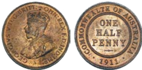
321 1911. Nearly full mint red. Ch.UNC