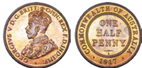
325 1917. Nearly full mint red. Ch.UNC