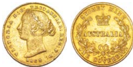
264 1864/5 Sydney Mint. Rare overdate variety. Greg McDonalds 2010 pocket guide lists only 2 examples known, with this the finest known. Extremely rare. gVF