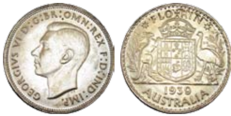
413 1939. Frosty original mint bloom with a trace of peripheral tone. Attributed as Ex F. Gates collection. A superior example. Ch.UNC/GEM