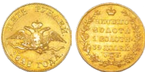
251 Russia Gold 5 Roubles 1828. St. Petersburg. Rare. EF