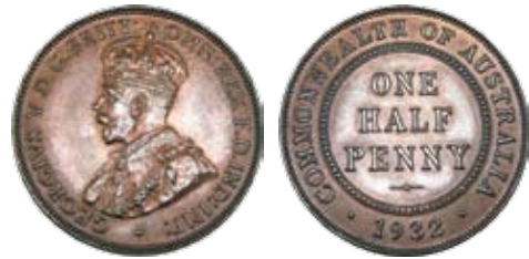
334 1932. Brown and red. Well struck. UNC/Ch.UNC $300-350