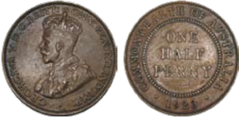
328 1923. Key date. 6 Pearls and nearly full diamond. gFINE $2000-2200