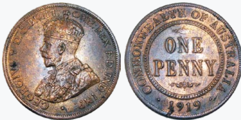
344 1919 Double dot. Considerable mint red for this issue, with slightly uneven colour, and weakly struck as usual. Ex Spink Noble sale 42, lot 1663 where it fetched $2,000, four times its estimate, and a similar price to what a Proof 1927 Canberra Florin sold for in the same sale. Extremely rare and a very under estimated coin. In the top two or three examples known. aUNC