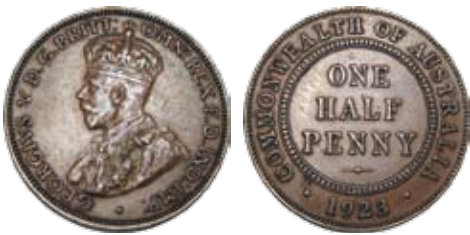
331 1923. Key date. Full clear band with 8 pearls. A superior example originally purchased for $15,000 and graded EF. Rare this grade. gVF/aEF $8000-8500