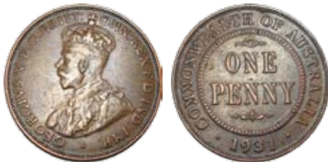
355 1931. Dropped 1, Indian Die type variety. Extremely rare, especially in this grade. gVF $12000-13000