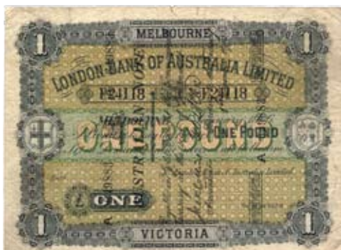
134 One Pound 1910 London Bank of Australia Ltd, Melbourne. Superscribed Collins-Allen (S 45). Edge tears at top, but a nice example. FINE