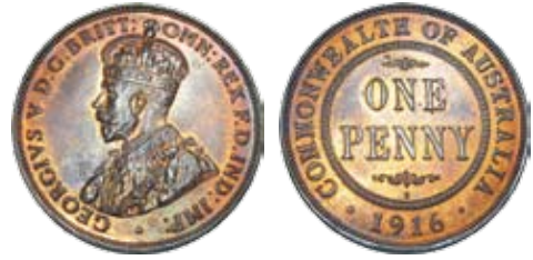
341 1916. Mostly mint red. Ch.UNC