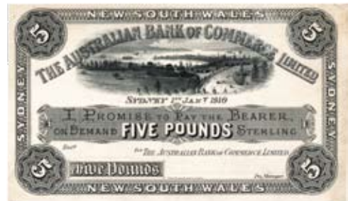
129 Five Pound Australian Bank of Commerce black and white Proof, Sydney. 1-1-1910 (MVR Type 1). Very Rare. aUNC