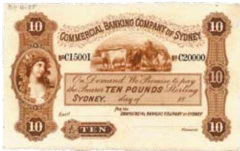
131 Ten Pound Commercial Bank of Sydney Specimen. Sydney 18-- Sep. 4th in pencil (MVR 4a). Extremely rare, with only 3 believed to be known. aUNC