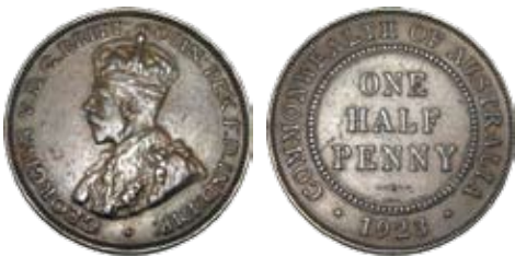
330 1923. Key date. 6 Pearls with nearly full band. Scarce. gF/aVF $2300-2400