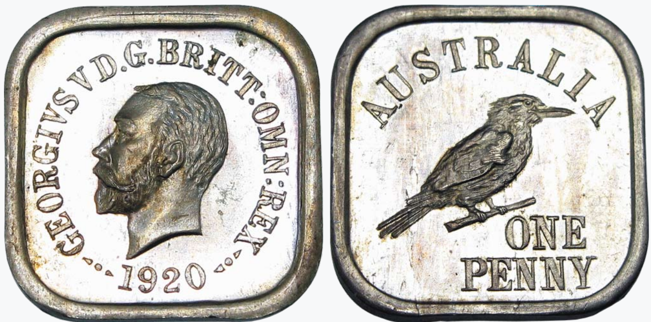
315 Kookaburra Penny 1919 Type 7. Lovely light old tone and mint bloom, an attractive example. An underrated type, and far rarer than the Type 3 or Type 6, with only a handful of examples known, with this coin the Type coin for the rare 1920 date issue. Very rare. FDC