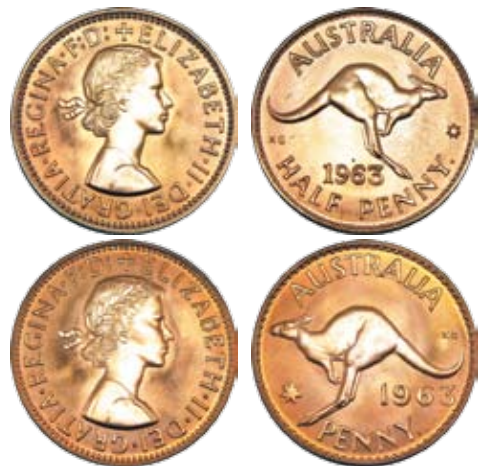
416 Proof Halfpenny & Penny Pair 1963Y Perth. FDC