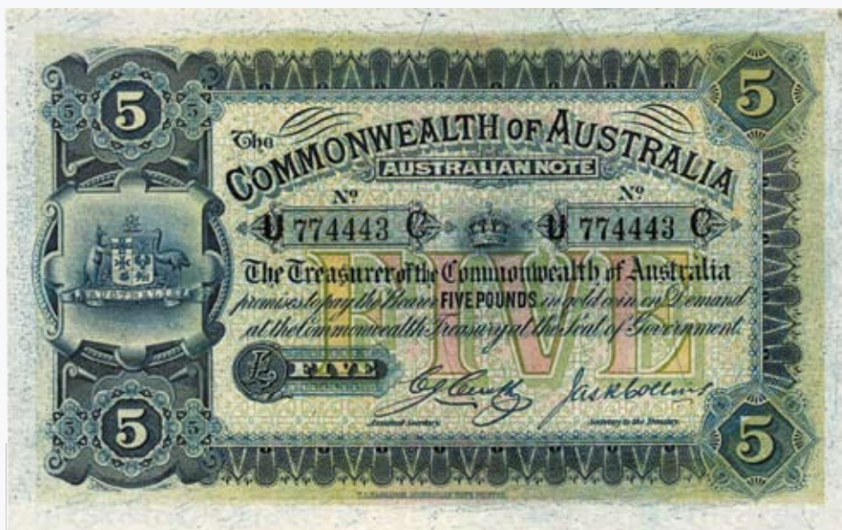
188 Five Pound 1918 Cerutti-Collins (R 37b). A lovely example with very little wear, and good colour. A fantastic type note. Very rare in this grade. EF