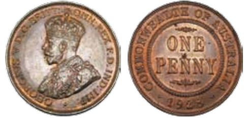
352 1928. Brown and red. UNC/Ch.UNC $800-900