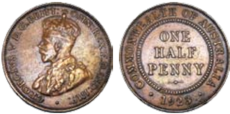
329 1923. Key date. Has been cleaned at some stage. 6 pearls and full centre diamond. gF/aVF $2000-2200