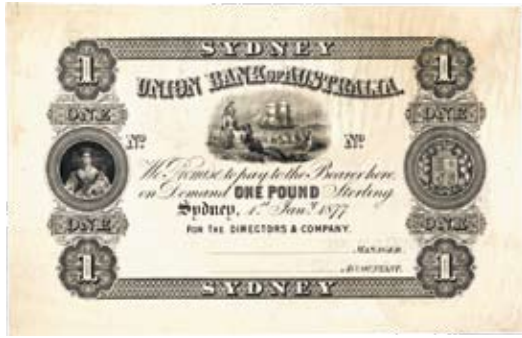
124 One Pound Union Bank of Australia black and white Proof, Sydney. 1-1-1877 (MVR Not Listed). Very Rare. EF