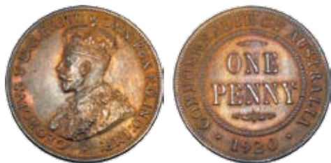
346 1920 Dot over. Red and brown. Well struck. Scarce. UNC/Ch.UNC