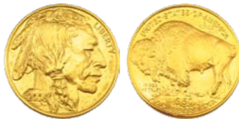
257 USA Gold $50 2006 1 ounce. Indian Head. UNC