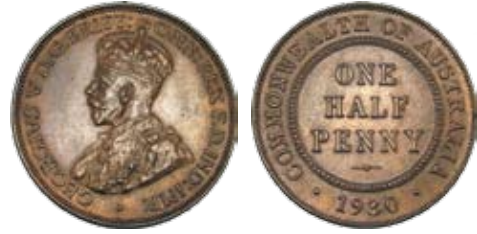
333 1930. Brown with a hint of red lustre. UNC $550-600