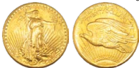
256 USA Gold $20 1924. St Gaudens. aUNC