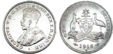
400 1915H. Some heavy surface marks. gEF $550-600