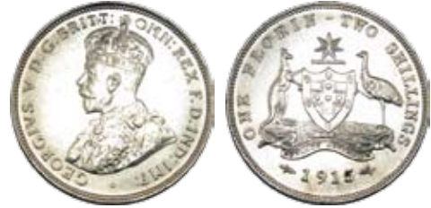
399 1915. Key date. Well struck for issue, but some surface marking. Scarce. gEF/aUNC $2000-2200