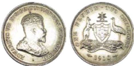
396 1910. Well struck with some light surface marks. UNC/Ch.UNC $3000-3500