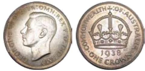
414 1938. Lovely soft grey and pink tone with mint bloom. A couple of small marks on the Obverse else one of the nicest examples I have seen. Ch.UNC