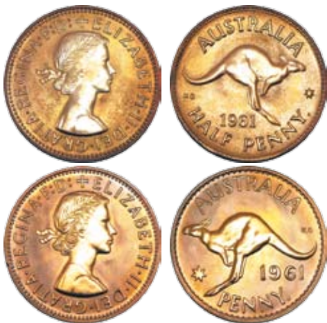
415 Proof Halfpenny & Penny Pair 1961Y Perth. FDC