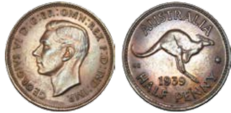
335 1939 Roo. Brown with a trace of red. UNC $300-350