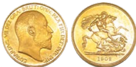
221 Gold Five Pound 1902 Edward VII. aUNC