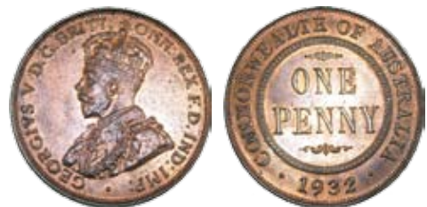
356 1932. Red and brown. UNC $350-400