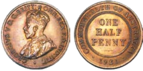
327 1921. Mint red. UNC $350-400