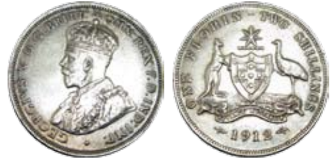
398 1912. Nice even example. aEF $750-800