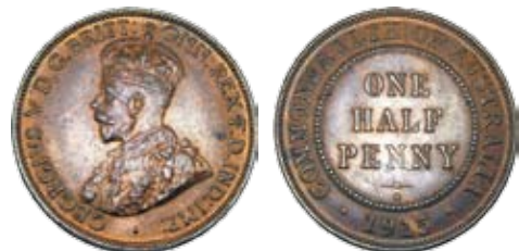
324 1915H. Key date. Brown with hints of red. Scarce. aU/UNC