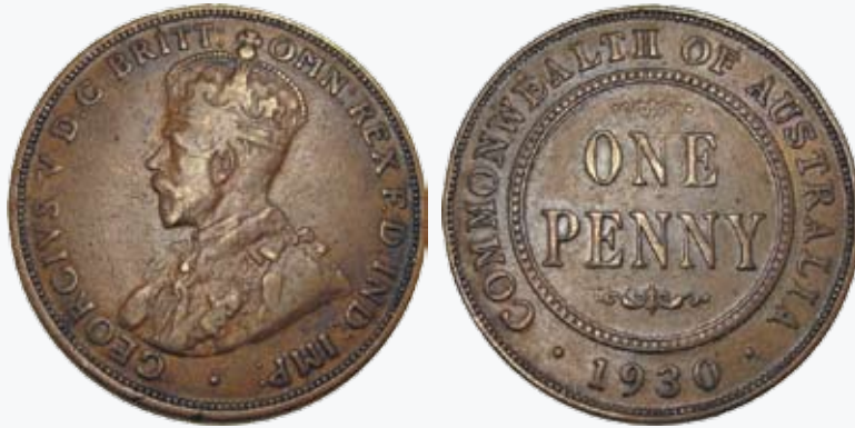
353 1930. Key date. A nice even no problems example. Evenly worn, but with 6 pearls on the band. F/gFINE $21000-22000