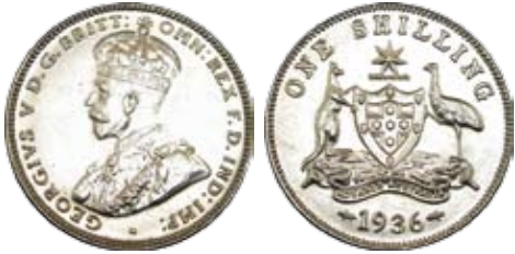
394 1936. Ch.UNC $300-325