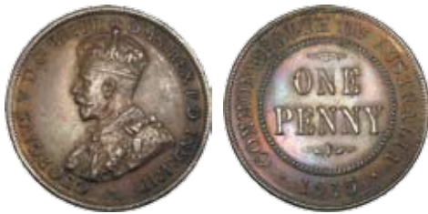
340 1915. Brown with a hint of red lustre. aUNC