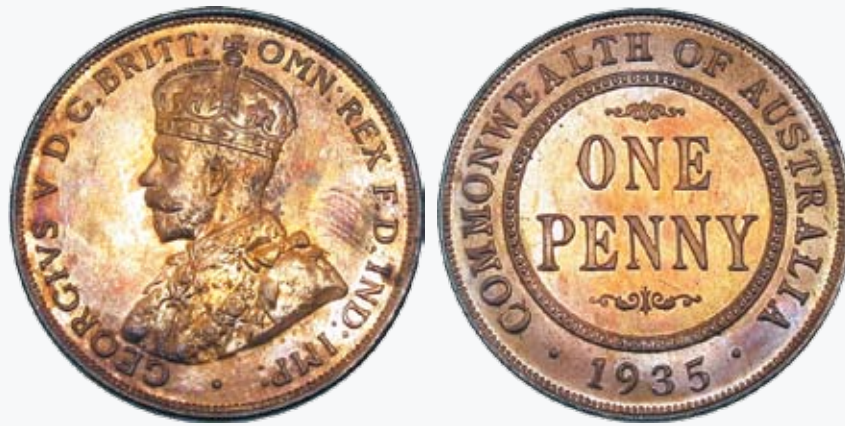
317 Proof Penny 1935. A nice example, with nearly full red and only a slight touch of usual surface toning, and lovely fields. Rare. FDC