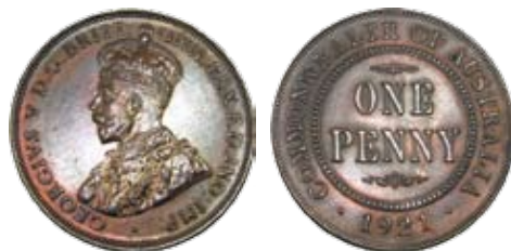
348 1921. Brown with just a hint of red. Well struck, with a specimen like finish. Ch.UNC