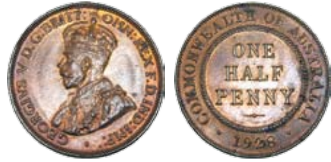
332 1928. Brown and red. Scarce date in this grade. UNC $600-700