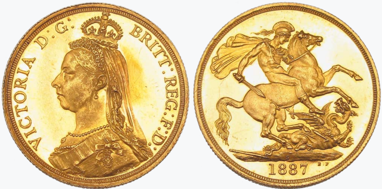
314 Two Pound Gold Proof 1887S. Second die type. Brilliant frosted mirror finish with traces of light surface marks. Overall, not as good as the finest known example we sold in Sale 70, but the next best of 4 examples known, and clearly a superior coin to the other 2 lesser grade coins, and with good eye appeal. Originally discovered in Greece, and sold by Mr Barrie Winsor in the late 1980's. Extremely rare. aFDC