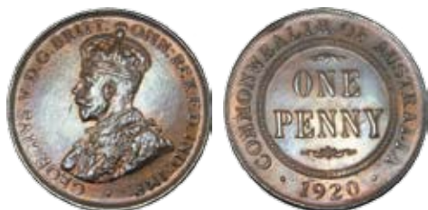
347 1920 Dot under. Brown with a hint of red. UNC