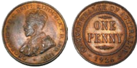
351 1926. Red and brown. Well struck. Scarce this grade. Ch.UNC $2400-2500