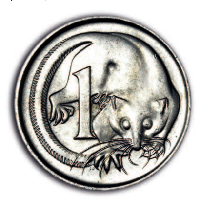
Top selling miss-strike of the sale - this 1 Cent struck on an uncertain Cupro Nickel blank. It sold for $8,943.7

Internment Camps WW I Copper Token made a record $9,420.75, and a choice Liverpool WW I Threepence fetched a strong $6,320.25. Once again record levels of postal and online bidding were recorded, with a significant number of sales going that way, again highlighting how well this technology is now being embraced by the market as a whole.