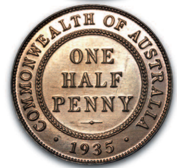
The 1935 Proof Halfpenny and Penny pair sold for $33,390

No Mosaic type in FINE condition was also keen buying, being knocked down for only $41,737.50, a bargain for this nearly impossible to obtain type note. Other banknote sales of note included a 10 Shillings 1926 in Unc selling for $19,080, a 1 Pound 1914 in gEF realised $11,925, whilst an extremely rare early 4 Spanish Dollars in lovely grade was sold for $12,044.35, and a very rare consecutive Starnote pair of 10 Shillings 1942 in gVF realised $23,850.