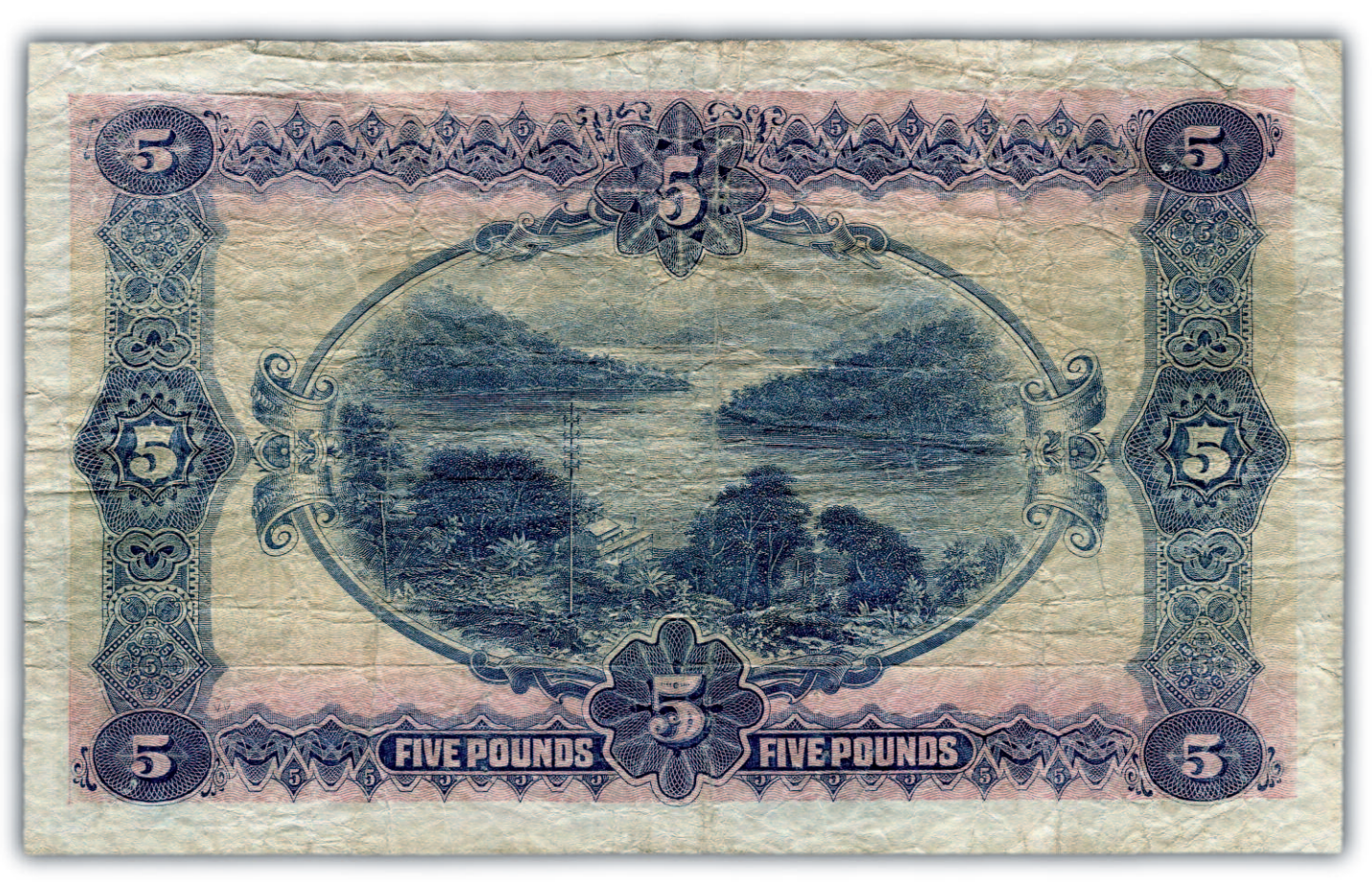
This extremely rare 5 Pound 1913 (R 35) (No Mosaic on back type) in FINE sold for $41,737.50