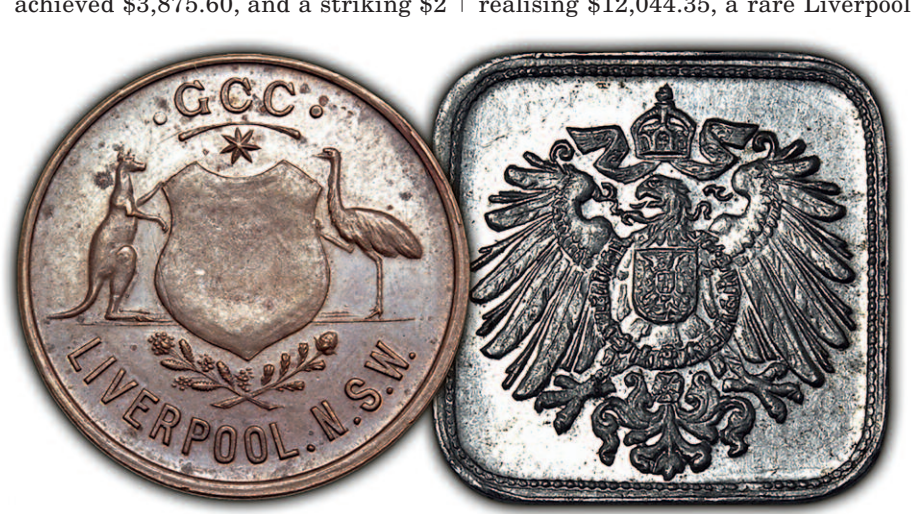
\label{thm:composition} \textit{Two WWI Liverpool Internment Camp tokens.} The copper token sold for a record $9,420.75 while the square threepence fetched $6,320.25.}

Other items of note included an attractive 8 Gold Escudos "Pieces of Eight" realising $12,044.35, a rare Liverpool