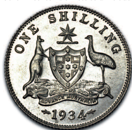
This 1934 Shilling was knocked down for $17,877.50

Other significant items sold included a Taylor Pattern Copper Fourpence, which realised $38,160, with an attractive 1935 Proof Halfpenny and Penny pair selling for $33,390, or less than half what a single such coin usually retails for. Other Proof coins of note sold include a