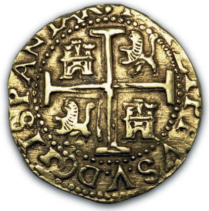
An attractive 8 Gold Escudos "Pieces of Eight" realised $12,044.35

Overall interest was patchy in some areas, and very strong in others, a reflection of the current market. One area that was exceptionally strong was in the Mis-Strikes. Top price of the sale went to a 1 Cent struck on an uncertain Cupro Nickel blank, an error we had not encountered before, and the price achieved of $8,943.75 reflected this items rarity. A Five Cent with a full Reverse brockage in Choice grade sold for $5,306.60, whilst another 5 Cent Obverse brockage achieved $3,875.60, and a striking $2