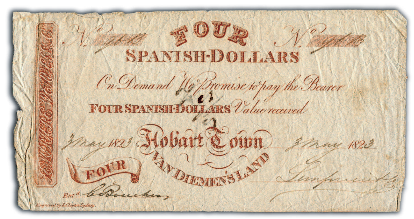
This extremely rare early 4 Spanish Dollars in lovely grade was sold for $12,044.35

rare 1952A Penny for $16,695, with a 1934 Shilling being knocked down for $17,877.50 and a 1934 Sixpence realised $16,098.75. The equal highest graded PCGS Pre Decimal coin, a MS 67 Threepence from 1934 reached a record price of $13,833, showing just how much of a huge premium such gem graded pieces are now fetching.