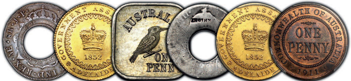
Just a few of the rarity highlights to be offered at IAG's Sale 82 on September 12th.

T.Knight counter-stamped coin, estimated at only $27,000, along with two Dumps. 3 Adelaide Pounds 1852 Type II includes two high grade Choice UNC examples, one of which is PCGS graded MS 64, estimated at $65,000 and $55,000 respectively. Other key highlights include a Specimen cased presentation 1910 Silver set, estimated at $90,000, and a PCGS graded Specimen Silver set 1940-1941. Other rarities of note include a 1930 Penny in aVF estimated at $20,000, two 1922/1 Overdate Threepences in aVF and aFINE grade, and a Type 6 Kookaburra Pattern Penny estimated at $38,000.