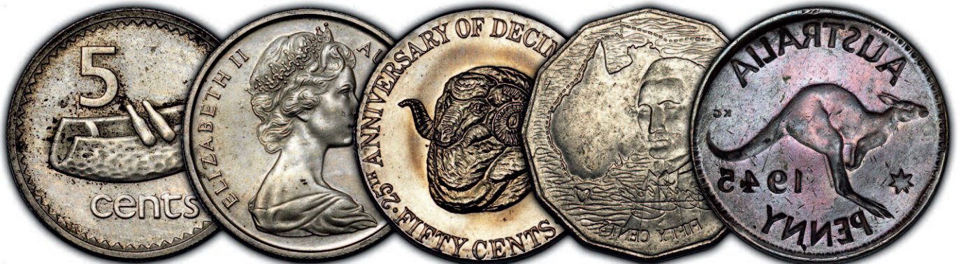
Some of the superb misstrikes that will be offered at IAG's Sale 82 on 12th September.