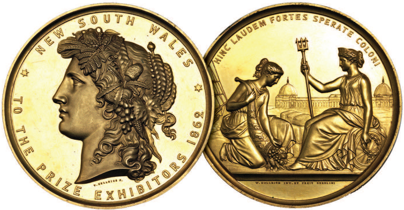
The cased 1862 London International Exhibition NSW Gold Medal weighing 12 Ounces is estimated at $35,000.