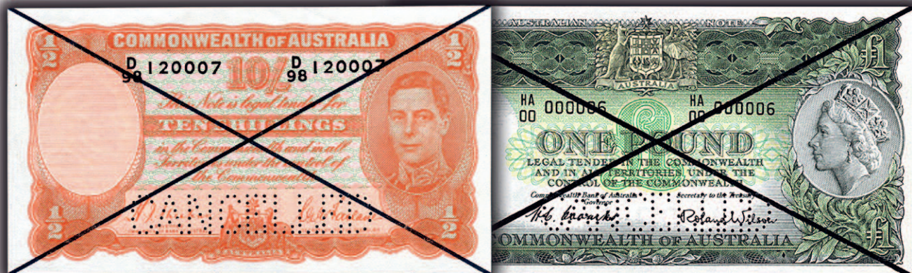
Two Rare Pre Decimal Specimen Notes