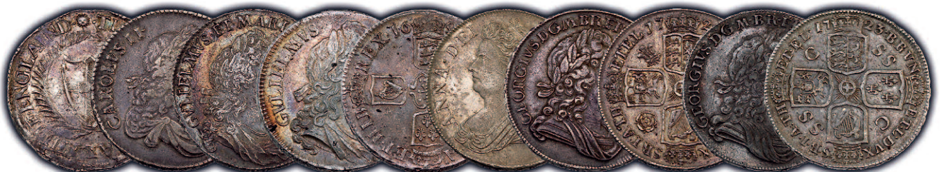
Just Some of the Collection of Nearly 100 GB Coins

IAG's Sale Number 83, to be held on the 23 rd April, is shaping up as another Auction not to be missed! With catalogues out at the end of March, this live floor auction is packed with high grade, rare and some of the most interesting highlights IAG have ever handled!