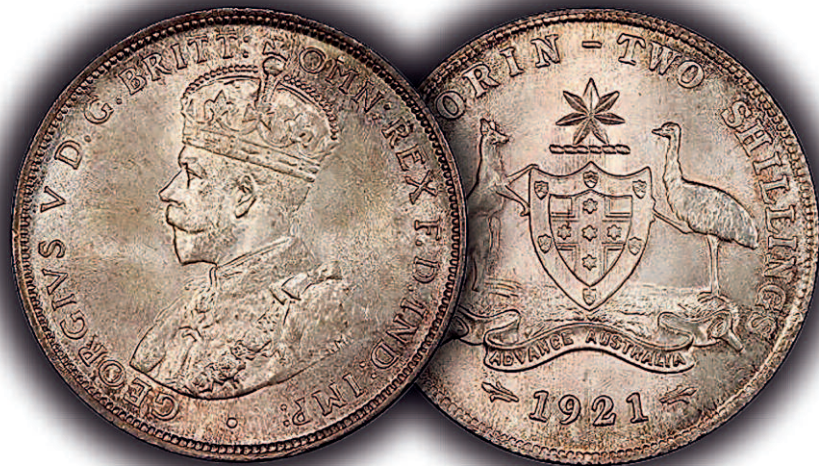
1921 Florin MS 65 Plus Second Finest Known