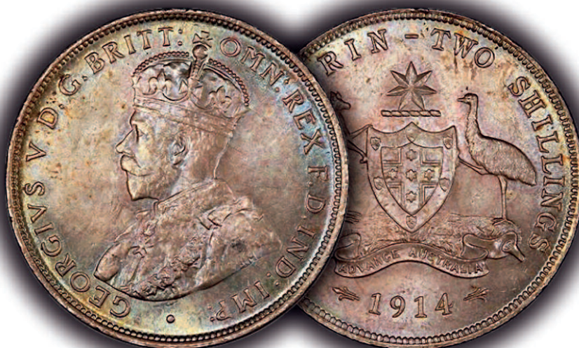
1914 Florin MS 64 Plus