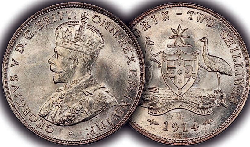
1914H Florin MS 65 Equal Finest Known