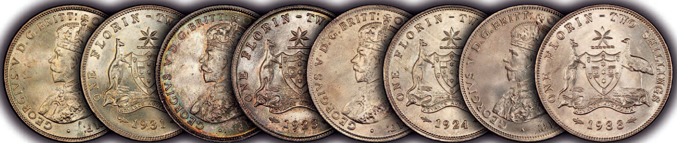
A Few More GEM Florin Highlights