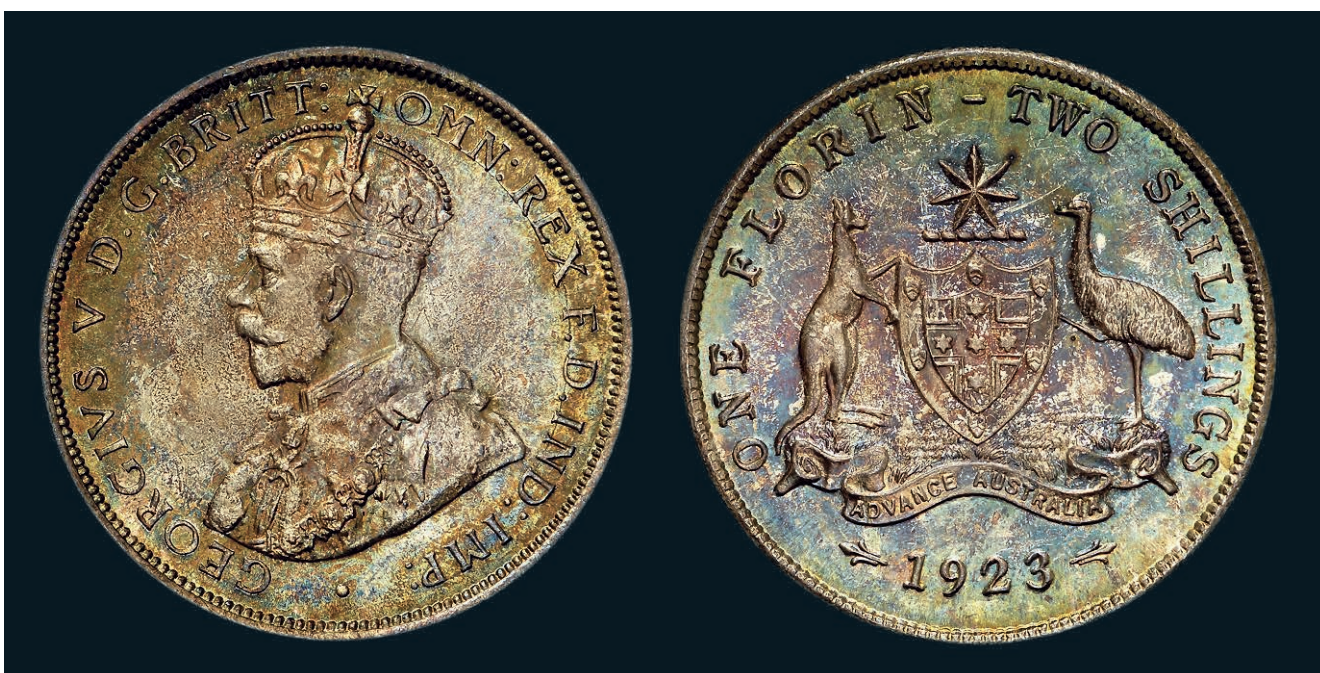
The top 1923 florin from the Baldwin hoard regarded as the finest surviving Australian George V florin - NGC MS67.