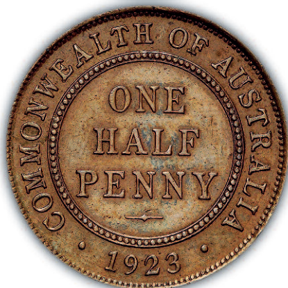
The Benchmark 1923 halfpenny in NGC MS62BN, the only example graded Mint State.