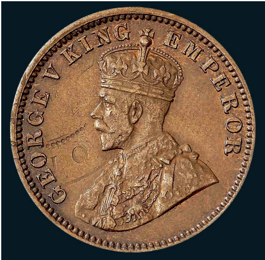
The Koschade example of the 1916 mule graded NGC AU-Detail. The Indian quarter anna obverse, with its significant die clash, is characterized by its English legend, and the Danish Order of the Elephant on the King's robe.