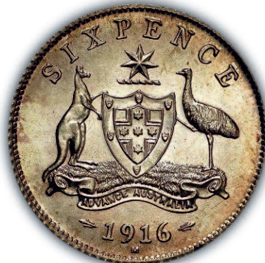
Superb quality: 1916M sixpence NGC MS68.