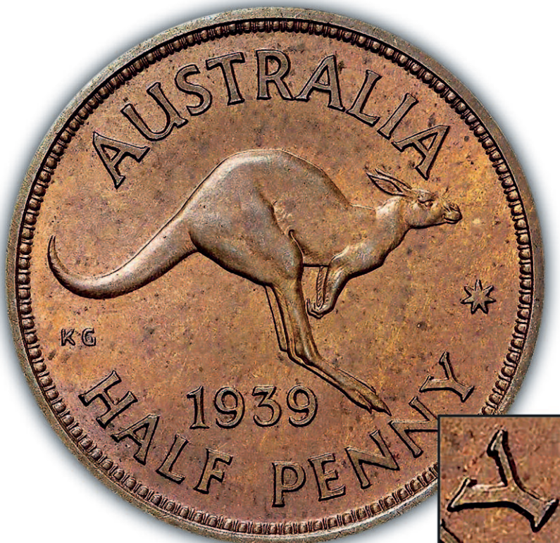
Rare in high grade: Australia's first kangaroo reverse halfpenny struck in 1939. Unlike the majority of other 1939 kangaroo reverse halfpennies the Y in HALFPENNY has both serifs on its foot equally developed - the so-called double-footed Y.