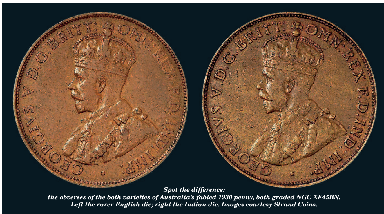
Spot the difference: the obverses of the both varieties of Australia's fabled 1930 penny, both graded NGC XF45BN. Left the rarer English die; right the Indian die.