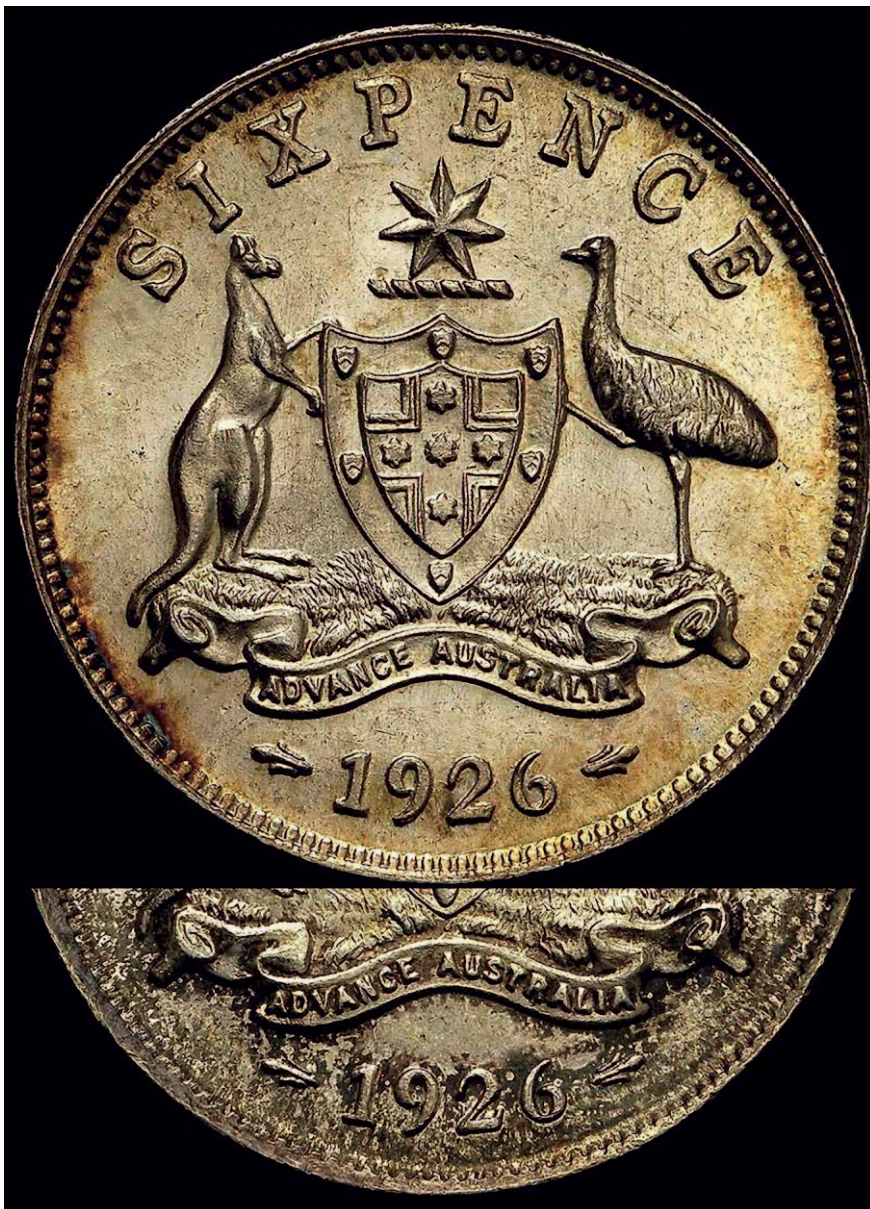
Choice examples of the differing 1926 sixpence date styles, with (below) and without (above) a pronounced serif on the 2.

shown by an NGC AU58BN dot-above 1920, a dropped 1 Indian Die 1931 in NGC AU55BN, a 1933/2 overdate in NGC MS65 RB, a 1943 I struck with a long-denticle die in NGC MS64BN, and a scarce 1946 K.G mm in NGC MS64RB.