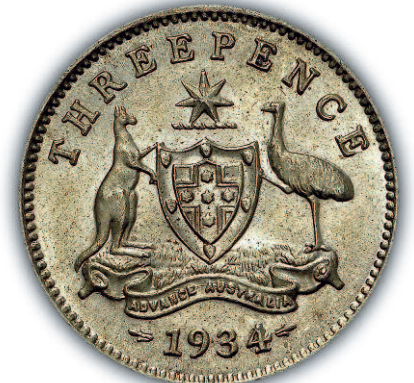
Overstruck threepences in the Benchmark Collection: top 1922/1 NGC AU58; bottom 1934/3 NGC MS66.