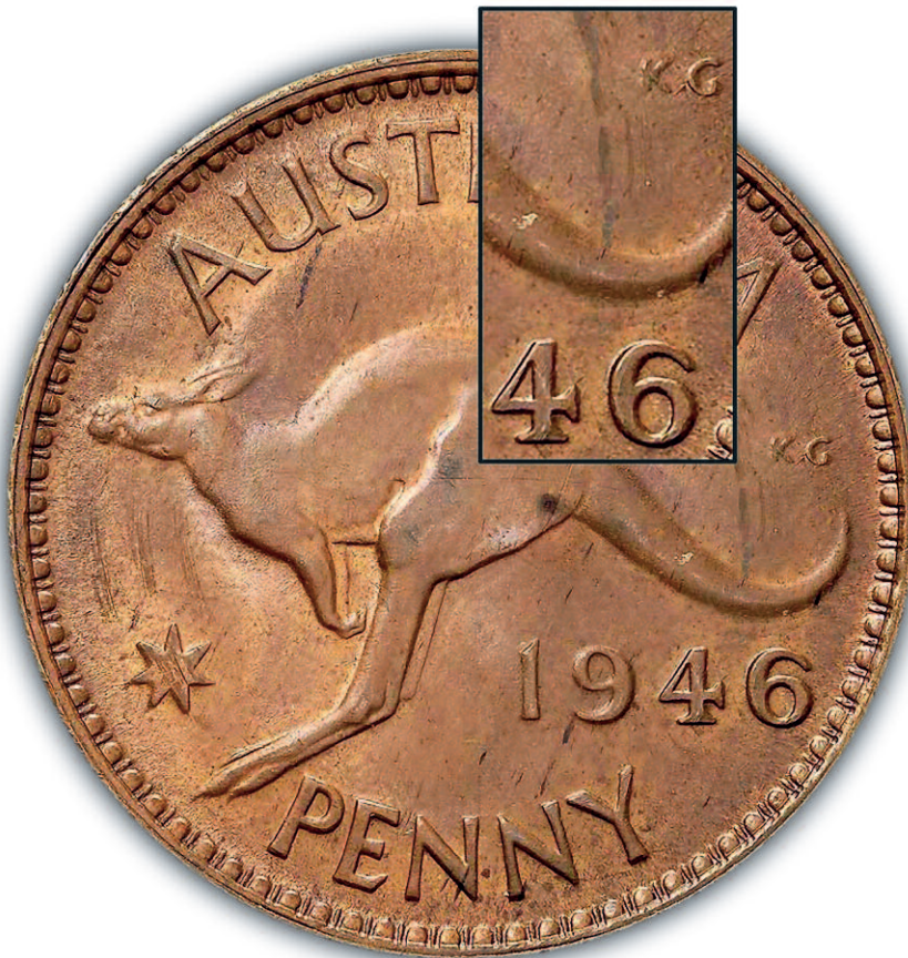
Well struck-up reverse of the Benchmark 1946 penny showing the distinctive K.G mm. missing on most 1946 pennies.