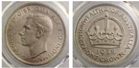
846 1938. PCGS graded Scrape-UNC Details. A well struck example with some Obverse marks. aUNC