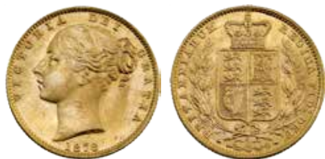
242 1878S Shield Reverse. Victoria Young Head. Some minor marks with mint bloom. aUNC