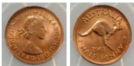
848 1961Y. PCGS graded PR 66 RD. FDC