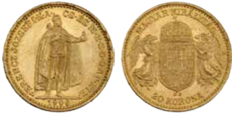
173 Austria gold 20 Corona 1906. Franz Joseph I. EF