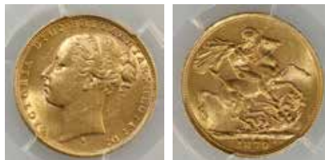
245 1879S. Victoria Young Head. PCGS graded MS 62. (S.3858A). A few minor marks with some bloom. Key date and rare. UNC/Ch.UNC