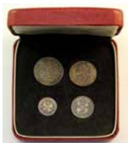
526 Maundy coins. Includes Penny 1844, Twopence 1838, Threepence 1886, Fourpence 1838. Toned. With original red box of issue. UNC