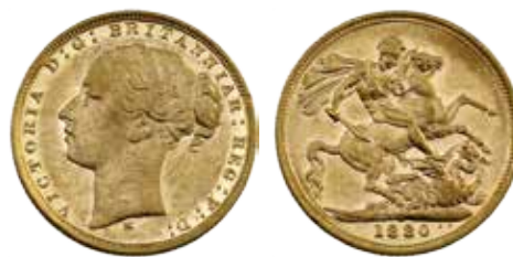
246 1880M Victoria Young Head. Trace of bloom. VF