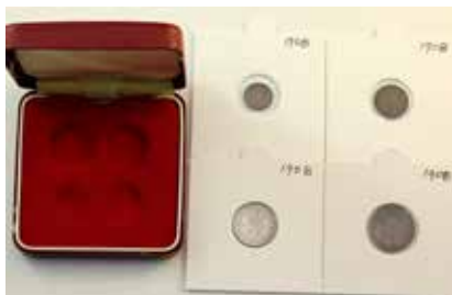
529 Maundy set of 4 coins 1908, Penny to Fourpence. Toned. With original red box of issue. UNC