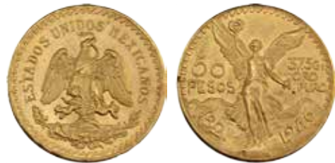
181 Mexico gold 50 Pesos 1946. aUNC