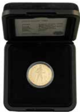
177 Dutch Mint reproduction Proof gold Ducat 1994 (.983AGW). In box of issue. FDC