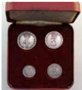
525 Maundy Money set of 4 coins 1746, Penny to Fourpence. Old tone. In non-original case (damaged). aVF-gVF