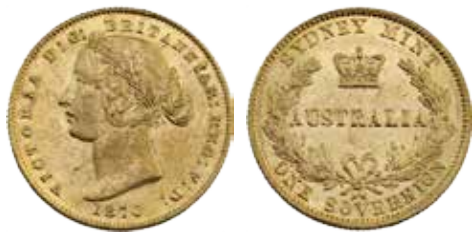
239 1870 Sydney Mint Victoria. Type II. aEF