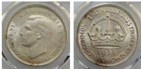
847 1938. PCGS graded MS 62. Light tone with a few minor marks and some soft bloom. UNC/Ch.UNC