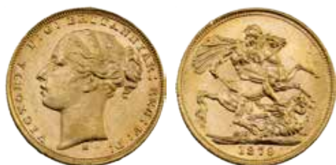
244 1879M Victoria Young Head. Some bloom, scratch on head on Obverse. gEF/aUNC