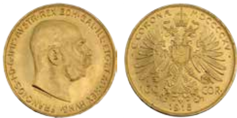
174 Austria gold 100 Corona restrike 1915 (33.8g). UNC