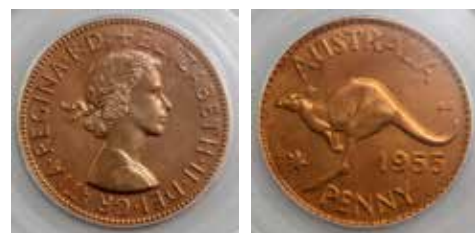
851 1955M. PCGS graded PR 65 RB. Only 1200 issued. Very slight tone. FDC