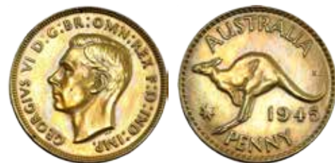
850 1945. Once cleaned and with an artificial golden retoning appearance, and slightly impaired surfaces with a few minor marks. Rare. aFDC