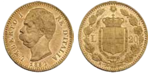
179 Italy gold 20 Lire 1882. Umberto I. aEF