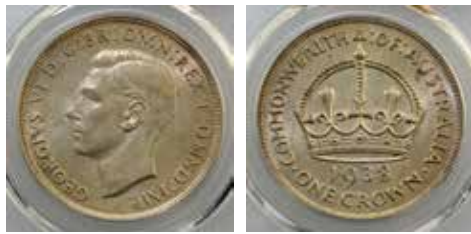
845 1938. PCGS graded AU 58. Toned with some lustre. Scarce date. gEF/aUNC