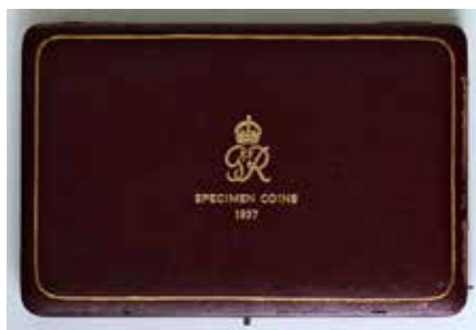
530 Specimen set of 15 coins 1937, Halfpenny to Crown. Some tone and a few minor surface marks. In original red presentation dated box. SPECIMEN