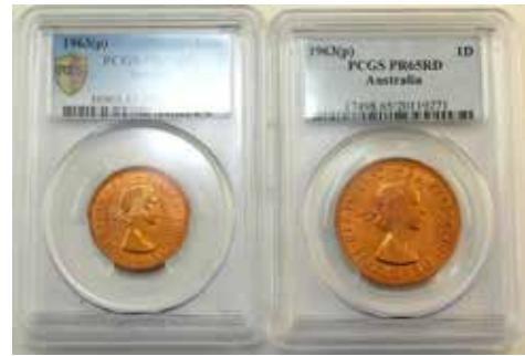
849 1963 Halfpenny and Penny pair. Both PCGS graded PR 65 RD. Mint red. (2 coins total). FDC