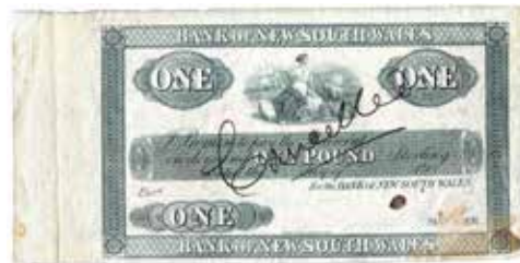
531 One Pound Bank of New South Wales, no domicile 1900. CANCELLED written across front in ink. Ink/tea stains and ink blotches, plus a couple repaired pinholes. Very scarce. VF