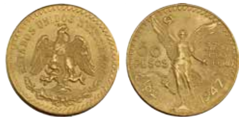
182 Mexico gold 50 Pesos 1947. aUNC