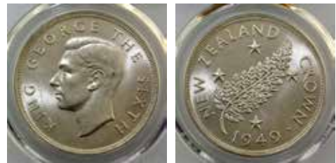
$30 - $40 Start Price $1