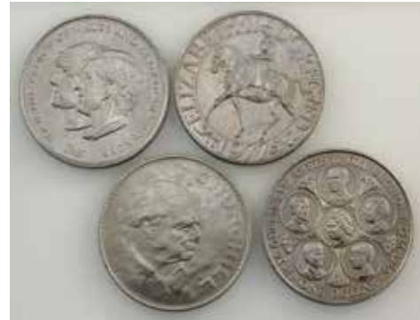
63 Crowns 1965 Churchill, 1977 QE II Jubilee, 1981 Charles and Di. Also Cook Islands Proof Dollar 1986 QE II 60th Birthday. (4 coins total). UNC-FDC