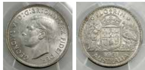
403 1951. PCGS graded MS 62. Soft Reverse tone. UNC/Ch.UNC