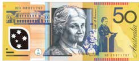
242 2005 polymer MacFarlane-Henry (R 520c). Catalogues at $115. UNC