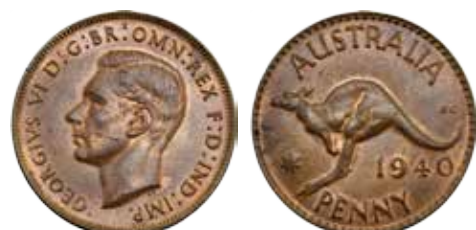
325 1940. Some red with a few Obverse marks. UNC