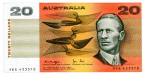
215 1979 Knight-Stone (R 407b). OCR-B side thread. Catalogues at $325. UNC