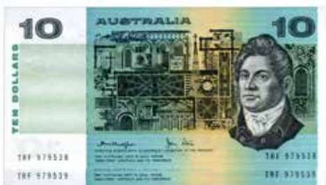
178 1979 Knight-Stone (R 307a). Gothic. Consecutive pair. Slight handling. aU/UNC