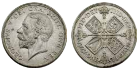
62 Florin George V 1929. UNC