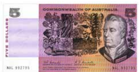
148 1967 Coombs-Randall (R 202). Heavy crease and flicks. aEF