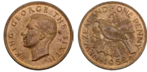
23 New Zealand Penny 1952. Elizabeth II. Red and brown. UNC