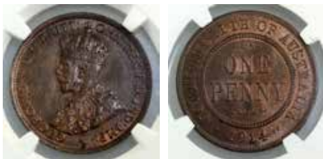
310 1914. PCGS graded MS 64 BN. Brown and red lustre. Very scarce this nice. Ch.UNC/GEM