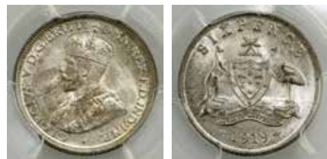
355 1919M. PCGS graded MS 64. Light golden tone with mint bloom, a little touched off on feathers with a few marks. Ch.UNC