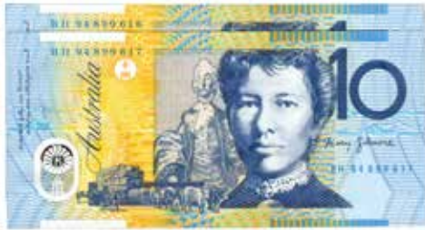
192 1994 polymer Fraser-Evans (R 316b). Blue Dobell. Consecutive pair. UNC