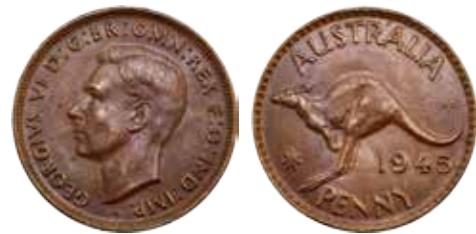
331 1945. Brown lustre. UNC