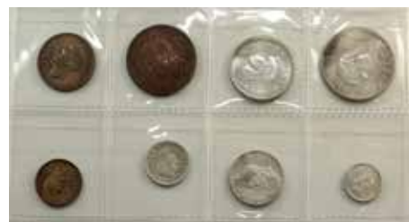
40 South Africa Proof 5 Shillings 1952. George VI. FDC