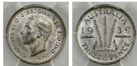
345 1939. PCGS graded MS 64. Light tone. Ch.UNC