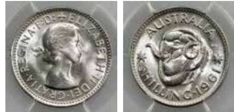
385 1961. PCGS graded MS 66. Satin mint bloom. GEM UNC