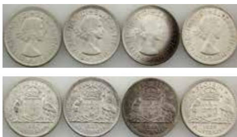
408 1956, 1957, 1958, 1959. Some tone. (4 coins total). gEF-UNC $120 - $140 Start Price $50