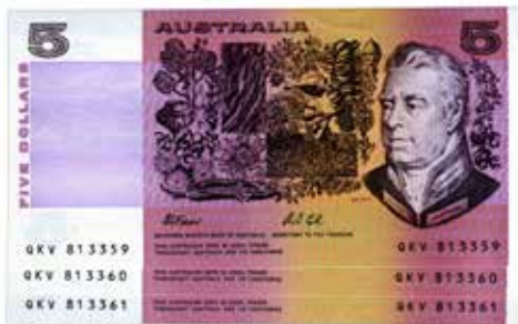
155 1991 Fraser-Cole (R 213). Consecutive trio. UNC