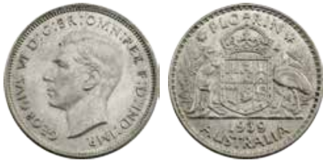
397 1939. Scarce date. Light tone with soft bloom. UNC/Ch.UNC