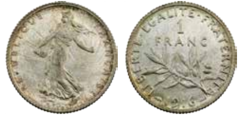
9 France 1 Franc 1916. Republic. UNC