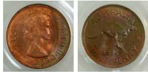
305 1962Y. PCGS graded MS 65 RB. Rainbow red/blue lustre. GEM UNC