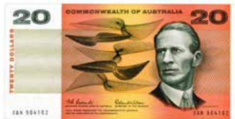
198 1966 Coombs-Wilson (R 401). Lightest hint of a flick. aU/UNC