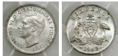
363 1943S. PCGS graded MS 64. Toned with mint bloom. Ch.UNC/GEM