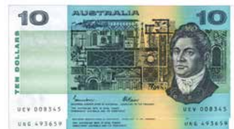
183 1985 Johnston-Fraser (R 309). One with low numbered serials 008345. Catalogues at $120 in Unc. (2 notes total). UNC