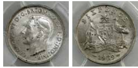
360 1939. PCGS graded MS 64. Soft tone with underlying bloom. Very scarce this grade. Ch.UNC/GEM