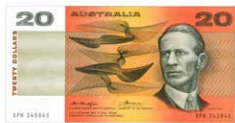
212 1976 Knight-Wheeler (R 406a). Gothic centre thread. Flick. Catalogues at $400 in Unc. aU/UNC