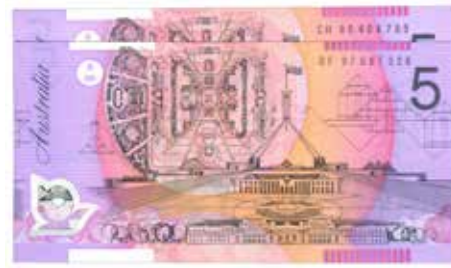
164 1996 polymer MacFarlane-Evans (R 218a), 1997 polymer MacFarlane-Evans (R 218b). Catalogues at $175. (2 notes total). UNC