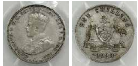
376 1933. PCGS graded VF 20. Toned, scarce date. gFINE/aVF