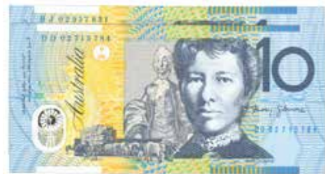
196 2002 polymer MacFarlane-Henry (R 320a). Catalogues at $100. (2 notes total). UNC