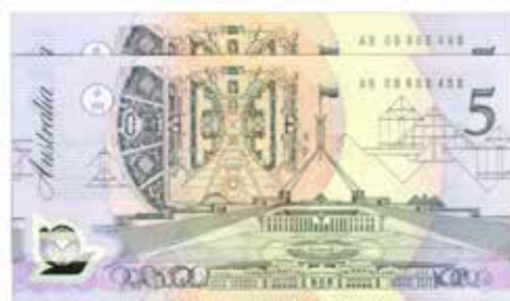
156 1992 polymer Fraser-Cole (R 214). Dark and medium green. Consecutive pair. UNC