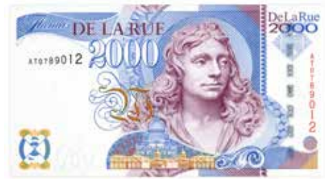
554 Thomas De La Rue promotional note 2000. World Paper Money Fair 1998. UNC