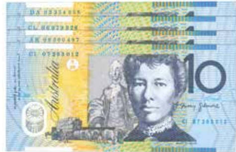
197 2003 polymer MacFarlane-Henry (R 320b), 2006 (R 320c) (2), 2008 Stevens-Henry (R 321b). Catalogues at $145. (4 notes total). UNC