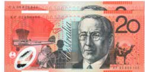
230 1998 polymer MacFarlane-Evans (R 418b), 2002 MacFarlane-Henry (R 420a). Catalogues at $160. (2 notes total). UNC