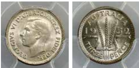
350 1952. PCGS graded MS 65. Light tone with mint bloom. GEM UNC