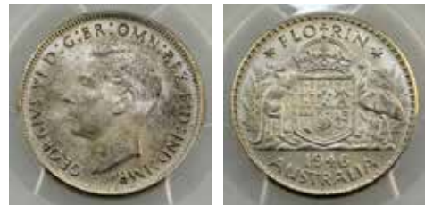
401 1946. PCGS graded MS 63. Light tone. Ch.UNC