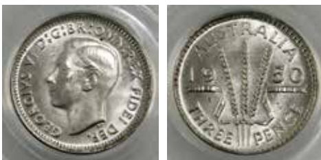
349 1950. PCGS graded MS 65. Some bloom. GEM UNC