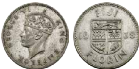
8 Fiji Florin 1938. George VI. EF