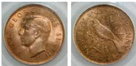
22 New Zealand Penny 1951. PCGS graded MS 64 RD. Mint red. Ch.UNC/GEM