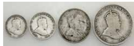
418 1910 silver set of 4, Threepence to Florin. (4 coins total). VG-aFINE