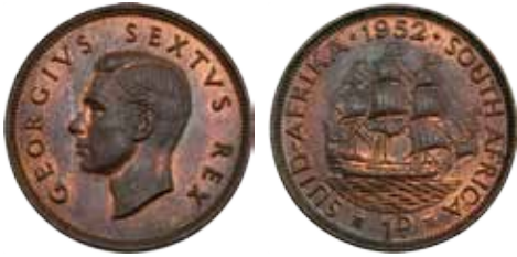
37 South Africa Penny 1952. George VI. Brown and red. UNC