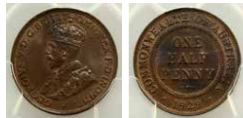
278 1929. PCGS graded MS 63 BN. Trace of lustre. Scarce. Ch.UNC