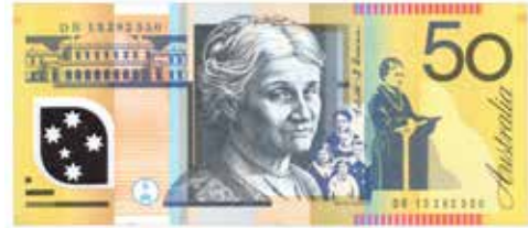
244 2013 polymer Stevens-Parkinson (R 522b). UNC