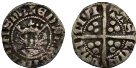
53 Penny Edward III N/D. Toned. FINE