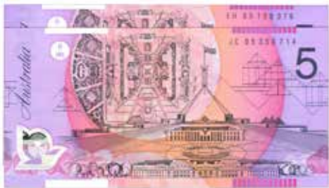
161 1995 polymer Fraser-Evans (R 217a/b). Wide band and narrow band issues. (2 notes total). UNC