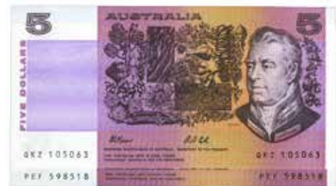
151 1983 Johnston-Stone (R 208), 1991 Fraser-Cole (R 213). (2 notes total). UNC