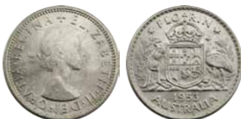
406 1953. Some bloom. UNC