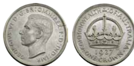
413 1937. Light tone with mint bloom. Ch.UNC/GEM