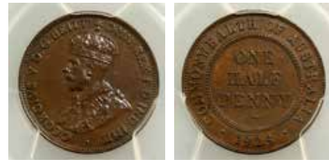
277 1923. PCGS graded AU 55. Mint brown lustre. Full clear strong band with all 8 pearls clearly visible. Rare this grade. EF/gEF