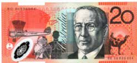
227 1996 polymer Fraser-Evans (R 416c). Catalogues at $300. UNC