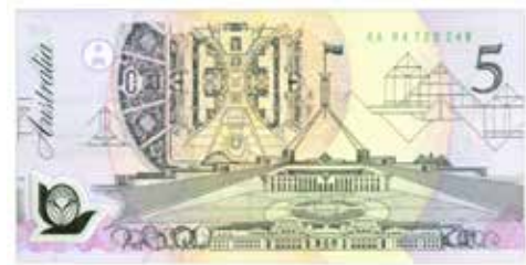
157 1992 polymer Fraser-Cole (R 214i). Bright pale green. UNC