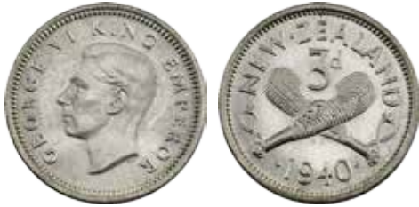
28 New Zealand Threepence 1940. UNC $90 - $100 Start Price $50