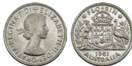
410 1961 GEM UNC