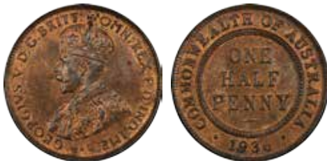
283 1936. PCGS graded MS 63 RB. Case scuffed. Mint red and brown. Ch.UNC