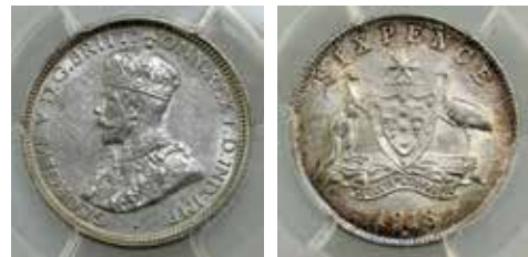
354 1918M. PCGS graded AU 55. Some light peripheral Reverse tone. Scarce. gEF/aUNC