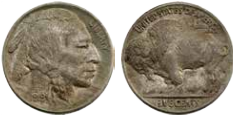
45 USA 5 Cents 1919. gVF