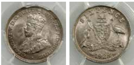
358 1928. PCGS graded MS 64+. Light subdued tone. Ch.UNC/GEM