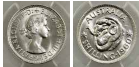
384 1960. PCGS graded MS 66. GEM UNC