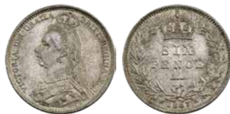
56 Sixpence Victoria 1887. Toned. UNC