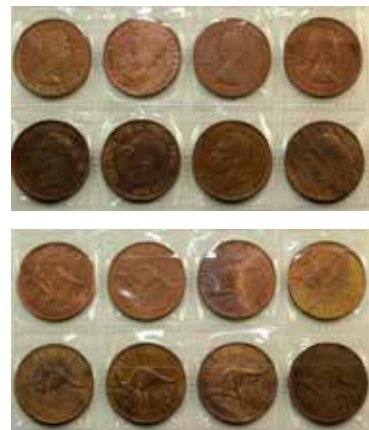
333 1948, 1949, 1950, 1951, 1962Y, 1963Y, 1964, 1964Y. Brown to red. (8 coins total). UNC-Ch.UNC