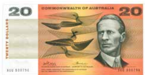
209 1972 Phillipps-Wheeler (R 404). Commonwealth. Catalogues at $450 in Unc. UNC