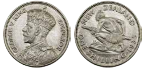
32 New Zealand Shilling 1935. George V. UNC $160 - $180 Start Price $100