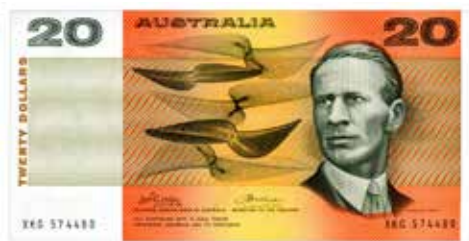
210 1974 Phillipps-Wheeler (R 405). Australia. Light bends/flicks. EF