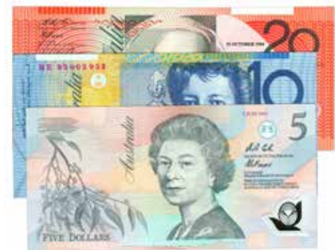
159 1992 polymer Fraser-Cole dated issue. Low serials AA 14 001353. Also $10 1993 Fraser-Evans BE 93 low purple serials 002953 and $20 1994 Fraser-Evans dated issue. Low serials AI 94 000828. From NPA collector folders (notes only). (3 notes total). UNC