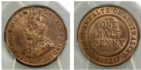
274 1921. PCGS graded MS 64 RB. Virtually full mint red. Ch.UNC/GEM