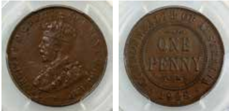
318 1928. PCGS graded AU 55. Brown. gEF/aUNC