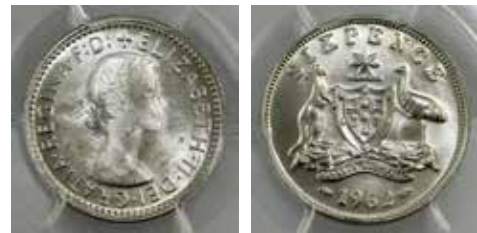
368 1962. PCGS graded MS 66. Mint bloom. GEM UNC