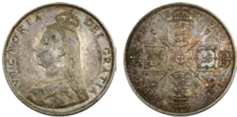
59 Florin Victoria 1887. Toned. gVF