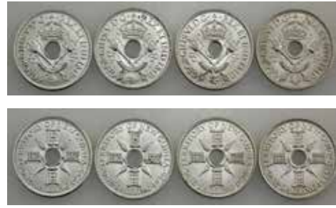
17 New Guinea Shillings 1935, 1936, 1938, 1945. (4 coins total). UNC