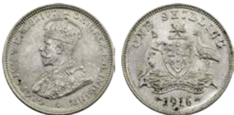
373 1916M. Light tone with some bloom. Ch.UNC