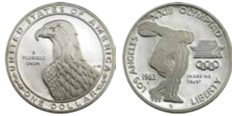
49 USA silver Proof Dollar 1983S. Los Angeles Olympics. FDC