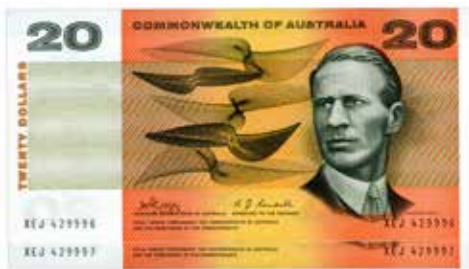
208 1968 Phillipps-Randall (R 403). Consecutive pair. Paper crease. aUNC