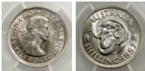
382 1957. PCGS graded MS 65. Some tone to Obverse. GEM UNC