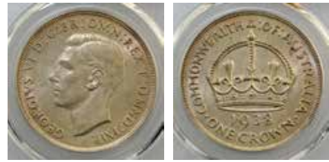
417 1938. PCGS graded AU 58. Toned with some lustre. aUNC