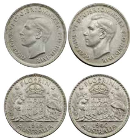
395 1938, 1940. (2 coins total). EF/gEF