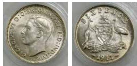
362 1941. PCGS graded MS 64. Light golden tone. Ch.UNC/GEM