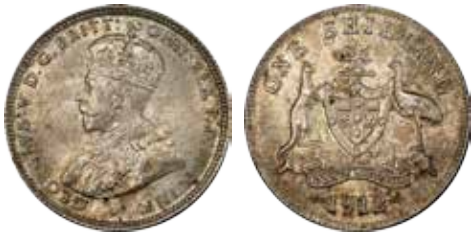
371 1912. PCGS graded MS 63. Toned with underlying bloom. Rare this grade. Ch.UNC