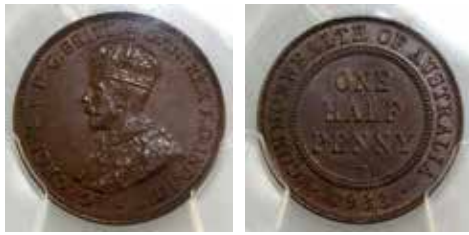
281 1933. PCGS graded MS 64 BN. Brown with lustre. Ch.UNC