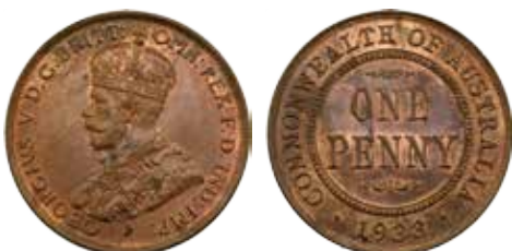
320 1933. Brown and red. gEF-aUNC