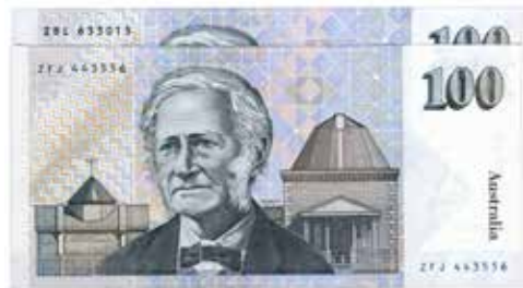
246 1985 Johnston-Fraser (R 609), 1990 Fraser-Higgins (R 612). Flicks. (2 notes total). aU/UNC