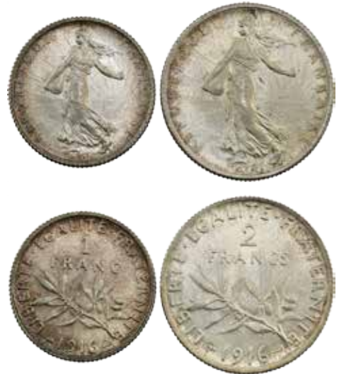
10 France 1 Franc and 2 Franc 1916. Republic. Lovely tone. (2 coins total). UNC