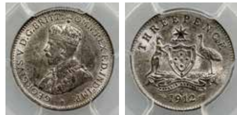
343 1912. PCGS graded AU 55. Light old tone with some bloom. gEF/aUNC