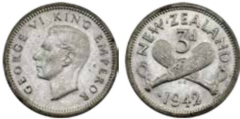
30 New Zealand Threepence 1942. 1 dot type. Scarce. UNC $280 - $300 Start Price $200