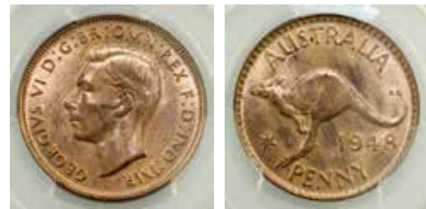
332 1948. PCGS graded MS 64 RD. Virtually full mint red. Ch.UNC/GEM