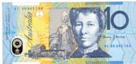
194 1996 polymer MacFarlane-Evans (R 318a). Catalogues at $500. UNC