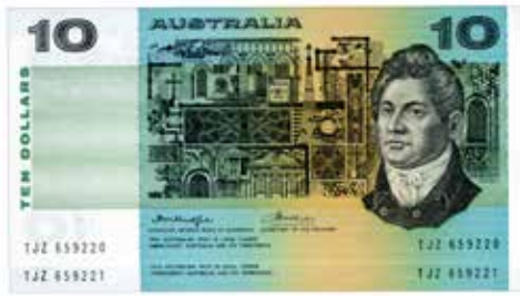
176 1976 Knight-Wheeler (R 306b). Side thread. Consecutive pair. Crease to edge of 1 note. UNC