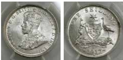
374 1917M. PCGS graded MS 63+. Bright bloom. Ch.UNC