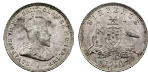
353 1910. Light tone with some bloom. Ch.UNC/GEM