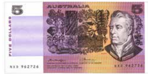
149 1976 Knight-Wheeler (R 206c). OCR-B side thread. UNC