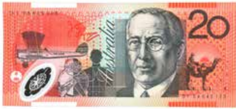
224 1994 polymer Fraser-Evans (R 416a). Catalogues at $100. UNC