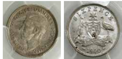
361 1940. PCGS graded MS 64. Soft Obverse tone. Ch.UNC/GEM