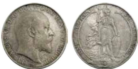
61 Florin Edward VII 1907. Some tone. aVF