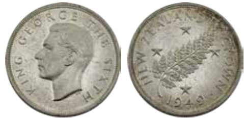
33 New Zealand Crown 1949. George VI. Some tone. In perspex case. UNC