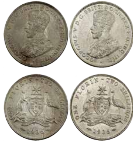
392 1936. (2 coins). aUNC