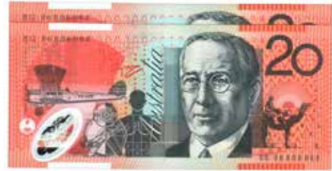
228 1996 polymer Fraser-Evans (R 416c). Consecutive pair. Catalogues at $600. UNC