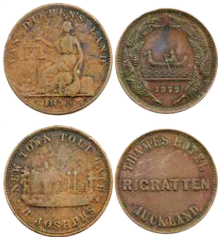
564 Josephs, R copper Penny token 1855, New Town Toll gate, Van Diemens Land, Gratten, R copper Halfpenny token 1872, Auckland NZ. (2 tokens total). aF-aVF