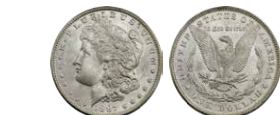
48 USA silver Dollar 1887. Liberty Head. Ch.UNC/GEM