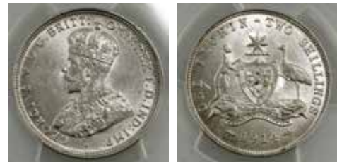
386 1914. PCGS graded AU 58. Bright bloom. gEF/aUNC