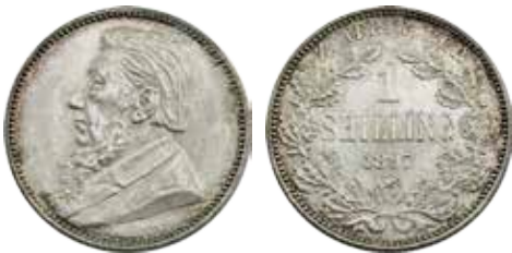
39 South Africa Shilling 1897. Light tone with bloom. Ch.UNC/GEM