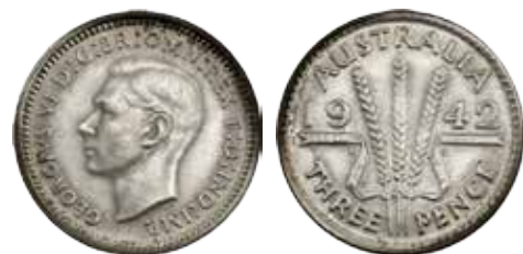
346 1942M. Slightly weak strike through centre. Light tone. UNC/Ch.UNC