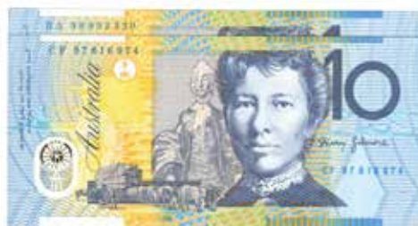
195 1997 polymer MacFarlane-Evans (R 318b), 1998 (R 318c). Catalogues at $140. (2 notes total). UNC