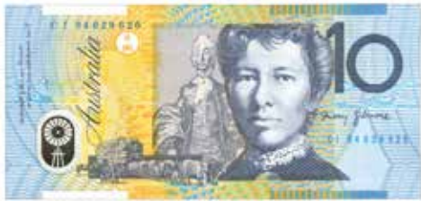
193 1994 polymer Fraser-Evans (R 316bi). Grey Dobell. Catalogues at $250. UNC