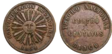
566 Argentina copper Quarter Centavos Token 1854, Tesoro National Bank. aVF