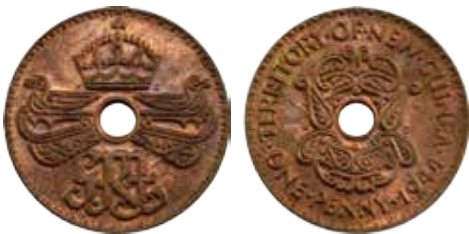
16 New Guinea Penny 1944. Brown and red. UNC