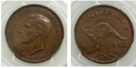
326 1942I. PCGS graded AU 55. Without I type. Brown lustre. Scarce this grade. gEF/aUNC