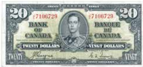
551 Canada 20 Dollars 1937. Coyne-Towers. Heavy folds, edge tear. gF/aVF