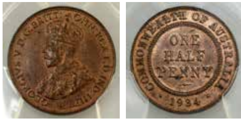
282 1934. PCGS graded MS 63 RB. Mostly mint red. Ch.UNC