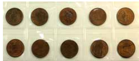
287 1940, 1941, 1942 (3), 1943, 1946, 1947, 1948, 1950. Mostly brown and red. (10 coins total). aUNC-UNC