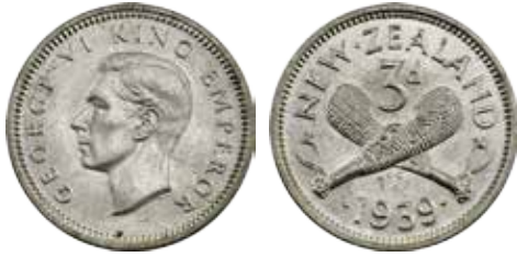
27 New Zealand Threepence 1939. UNC $80 - $100 Start Price $50