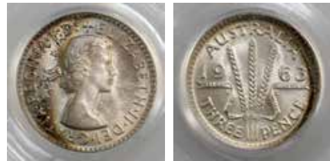
352 1963. PCGS graded MS 66. Some tone. GEM UNC