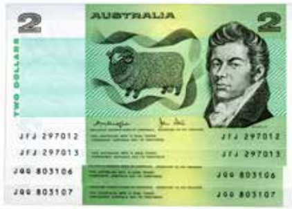
145 1979 Knight-Stone (R 87). Two consecutive pairs. Catalogues at $140. (4 notes total). UNC