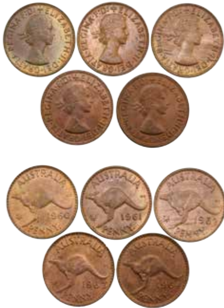
341 1960Y, 1961Y, 1962Y, 1963Y, 1964. Some red. (5 coins total). UNC