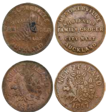
568 New Zealand Somerville, M copper Penny token 1857, Auckland. One with striking flaws. (2 tokens total). gF-aVF