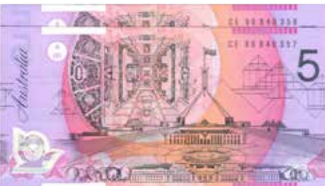
163 1996 polymer Fraser-Evans (R 217b). (2 notes total). UNC