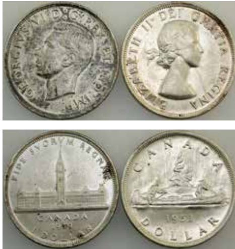
1 Canada silver Dollar 1939, 1953. (2 coins total). gVF-gEF