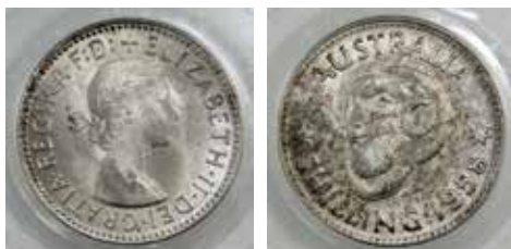
383 1958. PCGS graded MS 66. Old tone with underlying bloom. GEM UNC