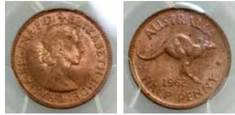
304 1962Y. PCGS graded MS 64 RD. Mostly mint red. Ch.UNC/GEM