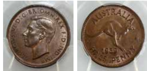
285 1939 Roo. PCGS graded MS 64 BN. Attractive brown with traces of red lustre. Ch.UNC/GEM