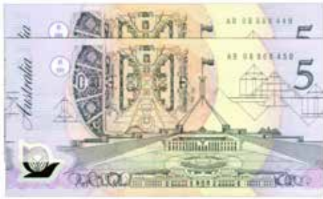
160 1993 polymer Fraser-Evans (R 216). Medium to dark green. (2 notes total). UNC