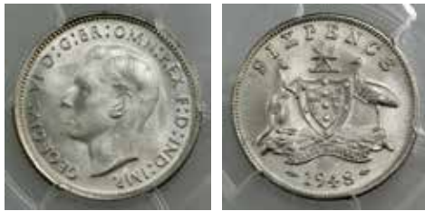
365 1948. PCGS graded MS 65. Full bloom. Scarce this grade. GEM UNC