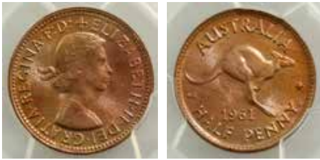
302 1961Y. PCGS graded MS 66 RB. Rainbow red lustre. GEM UNC