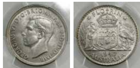
402 1947. PCGS graded MS 63. Soft tone. Ch.UNC