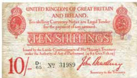
553 GB and Ireland 10 Shillings. Bradbury. Stamp on back WELLINGTON 80M. Multiple folds, stains. gF/aVF