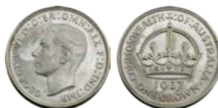
412 1937. Some bloom. Ch.UNC