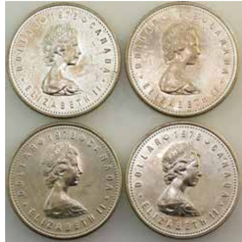
3 Canada silver Dollars 1978 Commonwealth Games. (4 coins total). GEM UNC