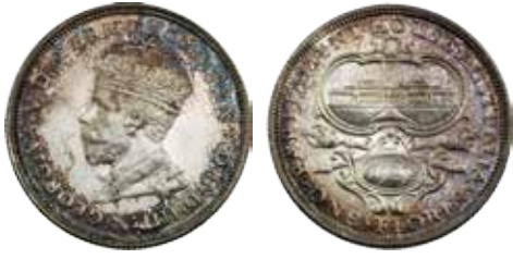
388 1927 Canberra. Toned with prooflike fields. Ch.UNC/GEM