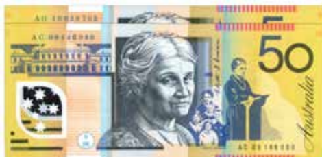
243 2009 polymer Stevens-Henry (R 521c), 2010 (R 521d). Catalogues at $195. (2 notes total). UNC