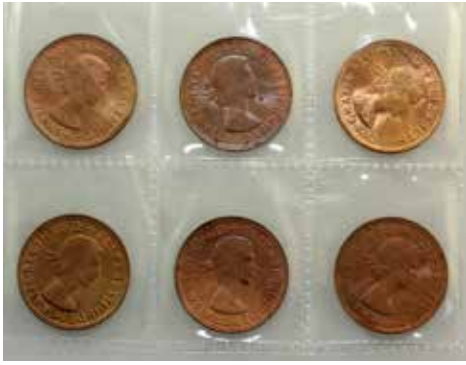
301 1959, 1960, 1961, 1962, 1963, 1964. Mostly red. (6 coins total). UNC-Ch.UNC/GEM