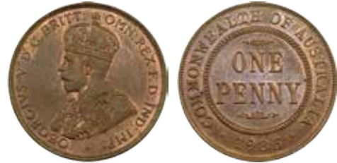
322 1935. Brown with hints of red, lustre. gEF/aUNC