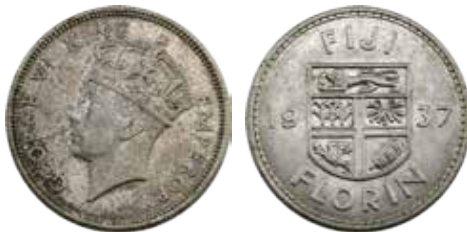
7 Fiji Florin 1937. George VI. Old toned. aUNC