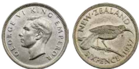
31 New Zealand Sixpence 1937. George VI. Scratches. UNC $100 - $120 Start Price $70