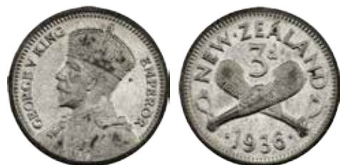
26 New Zealand Threepence 1936. UNC