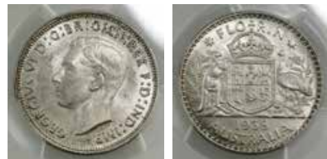
394 1938. PCGS graded MS 64. Hints of tone and field marks on Obverse. Ch.UNC/GEM