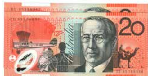
231 2003 polymer MacFarlane-Henry (R 420a), 2007 Stevens-Henry (R 421a). (2 notes total). UNC