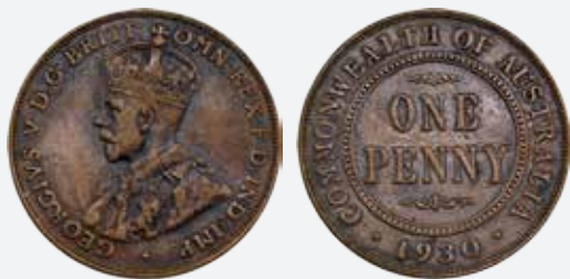
319 1930. Key date. 6 pearls with a small part of the centre diamond visible. A good, even coin, with just a trace of some slight pitting on the Reverse. Rare. F/gFINE