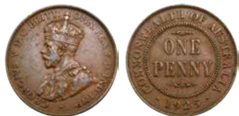
316 1925. Key date. Nice strong strike. gVF/aEF