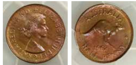
306 1962Y. PCGS graded MS 66 RB. Rainbow red lustre. GEM UNC