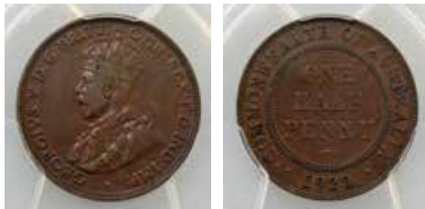
275 1923. Key date. PCGS graded VF 30. Brown. gF/aVF