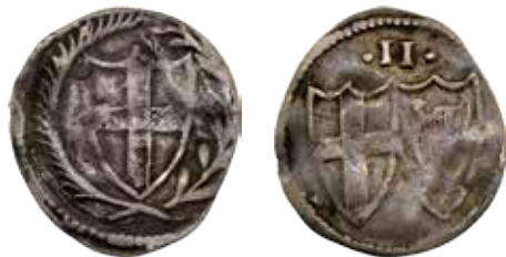
54 Twopence Commonwealth N/D (1649-60). Toned. F/gFINE