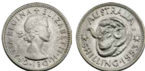
381 1953 Ch.UNC