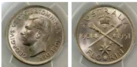
405 1951 Jubilee. PCGS graded MS 64+. Nice light tone with mint bloom. Ch.UNC/GEM $280 - $300 Start Price $150