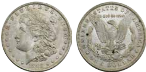
47 USA silver Dollar 1885O. Liberty Head. UNC