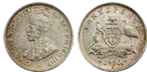
344 1920M. Light tone with some lustre. aUNC