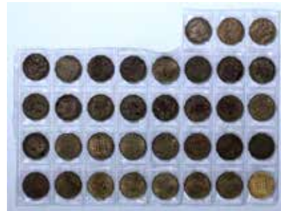
55 Threepence set 1937 to 1970. Incomplete, but a few extras. (35 coins total). gF-UNC