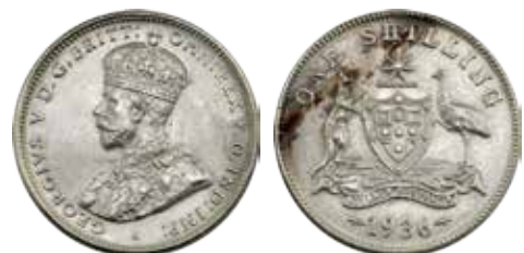
378 1936. Reverse tone. Tiny cud to Obverse in crown. UNC/Ch.UNC