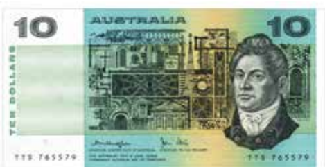
179 1979 Knight-Stone (R 307b). OCR-B. Catalogues at $140 in Unc. UNC