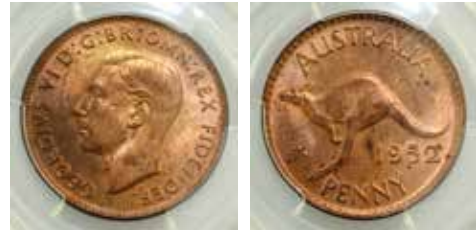
338 1952M. PCGS graded MS 64 RD. Nearly full mint red. Ch.UNC/GEM