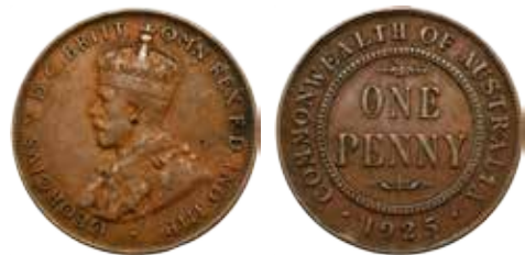
315 1925. Key date. VF