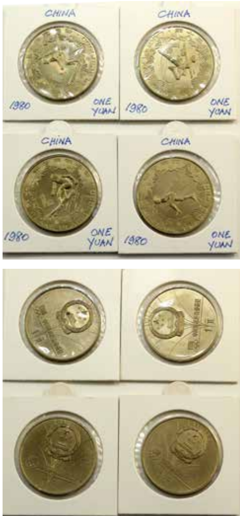
6 China 1 Yuan set of 4 coins 1980. Lake Placid Winter Olympics. (4 coins total). FDC