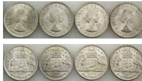
409 1960, 1961, 1962, 1963. Light tone with some bloom. (4 coins total). UNC