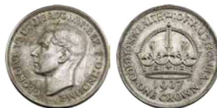
411 1937 aEF