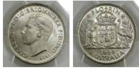
400 1945. PCGS graded MS 64. Light tone with soft bloom. Ch.UNC/GEM