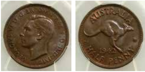
289 1942M. PCGS graded MS 63 BN. Traces of red lustre. Scarce. Ch.UNC