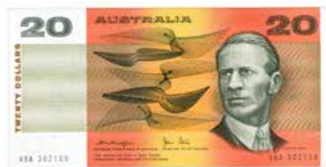
214 1979 Knight-Stone (R 407a). Gothic side thread. Catalogues at $220. UNC