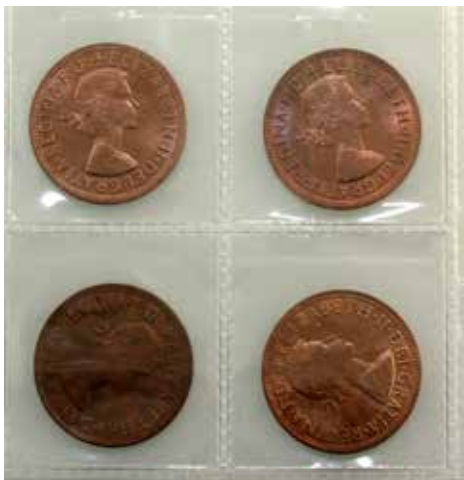
342 1964. Mostly mint red. (4 coins total). Ch.UNC/GEM