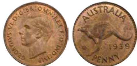
324 1939. Brown with some underlying red. UNC