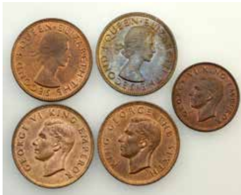
21 New Zealand Pennies 1947, 1952, 1956, 1957. Also Halfpenny 1944. Red and brown. (5 coins total). UNC-Ch.UNC