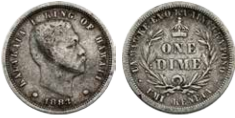
13 Hawaii Dime (10 Cents) 1883. Kalakaua I. Toned, edge knock. aVF