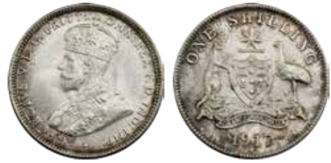
375 1917M. Peripheral tone. Ch.UNC/GEM