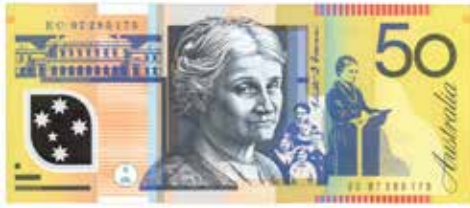
240 1997 polymer MacFarlane-Evans (R 518a). Catalogues at $300. UNC