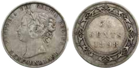
36 Newfoundland 50 Cents 1898. Victoria. Toned. Scarce. aVF