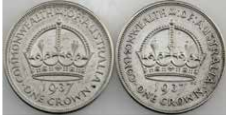
414 1937. (2 coins). VF-gVF