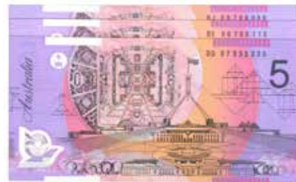
166 2006 polymer MacFarlane-Henry (R 220d), 2007 Stevens-Henry (R 221a), 2008 (R 221b). (3 notes total). UNC