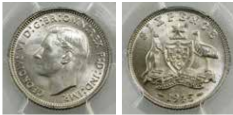
364 1945. PCGS graded MS 65. Light tone with mint bloom. GEM UNC