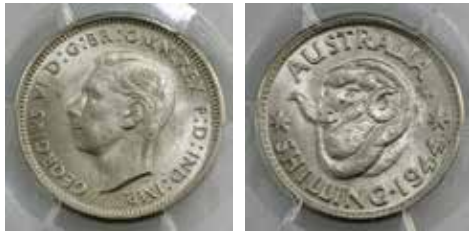
379 1944M. PCGS graded MS 64. Light tone. Ch.UNC/GEM