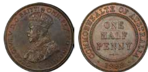
280 1933. PCGS graded MS 63 BN. Traces of red. UNC/Ch.UNC