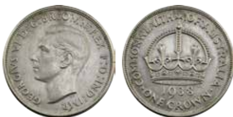
416 1938. Light tone. aEF