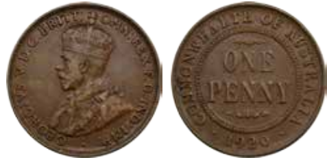
313 1920 plain. 6 pearls with most of centre diamond. Scarce. gVF