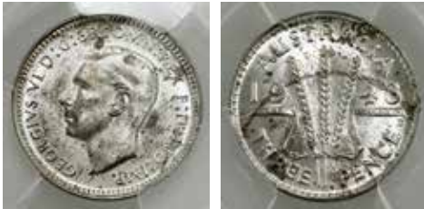
347 1943D. PCGS graded MS 66. Some tone with bloom. GEM UNC