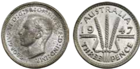
348 1947. Light Obverse tone. GEM UNC