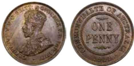
309 1911. Brown with hints of underlying red. aU/UNC