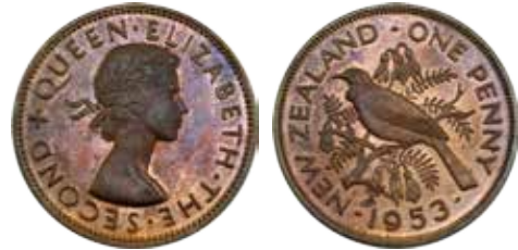
24 New Zealand Proof Penny 1953. Elizabeth II. Toned. FDC