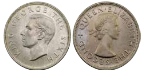
$140 - $160 Start Price $80