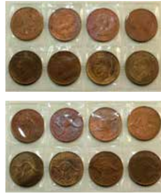
330 1943I, 1948, 1949, 1952, 1962Y, 1963Y, 1964, 1964Y. Brown to red. (8 coins total). aUNC-Ch.UNC