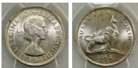
407 1954 Royal Visit. PCGS graded MS 64+. Light tone with mint bloom. Ch.UNC/GEM $280 - $300 Start Price $150