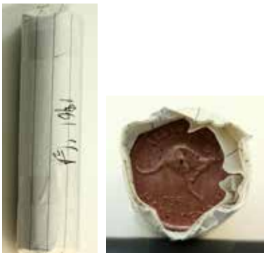
303 1961Y. Broken unofficial roll of 60 coins, some with red. UNC-Ch.UNC