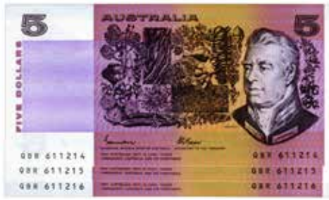
153 1985 Johnston-Fraser (R 209a). OCR-B. Consecutive trio. Catalogues at $150. UNC