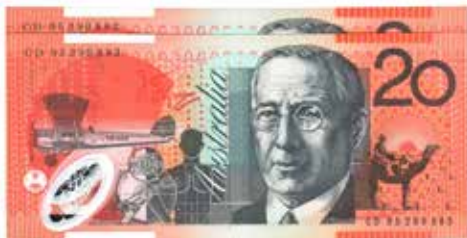
226 1995 polymer Fraser-Evans (R 416b). Consecutive pair. Catalogue at $600. UNC