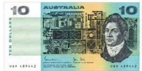
181 1983 Johnston-Stone (R 308). Mis-cut by approx 2mm. Catalogues at $110 in Unc. UNC