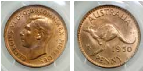
335 1950. PCGS graded MS 64 RD. Ex Borg Collection. Full bright mint red. Ch.UNC/GEM