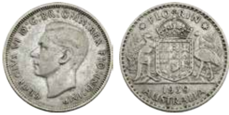
396 1939. Scarce date. aVF