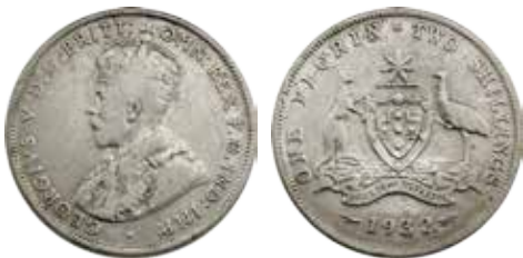
391 1932. Key date. VG/aFINE