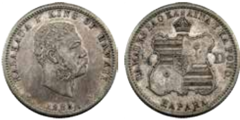
14 Hawaii Quarter (25 Cents) 1883. Kalakaua I. Toned, old Obverse scratch. aEF