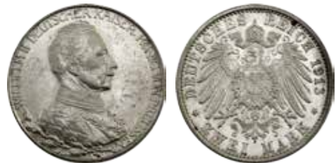
11 Germany (Prussia) 2 Marks 1913. aUNC