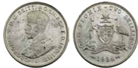
393 1936. Light tone with full mint bloom. GEM UNC