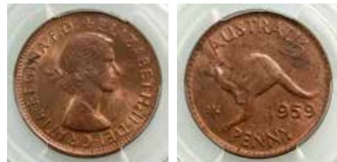
340 1959. PCGS graded MS 64 RB. Mostly mint red. Ch.UNC/GEM