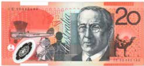
225 1995 polymer Fraser-Evans (R 416b). Catalogues at $300. UNC