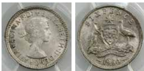
367 1960. PCGS graded MS 65. Soft tone. GEM UNC