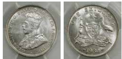
377 1934. PCGS graded MS 64. Weakly struck from worn dies with some bloom. Ch.UNC