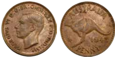
328 1943. Brown with some lustre, a few marks. UNC