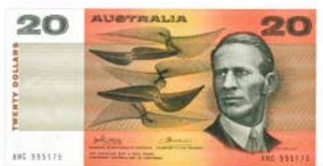
211 1974 Phillipps-Wheeler (R 405). Australia. Slight handling. aU/UNC