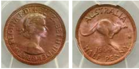
308 1964Y. PCGS graded MS 66 RB. Bright red and red/blue lustre. GEM UNC