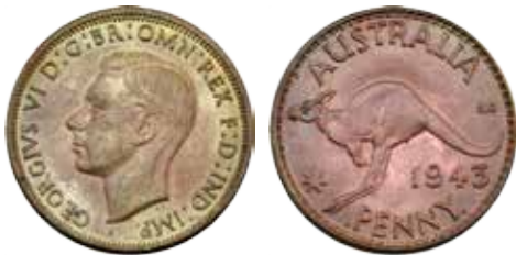
329 1943I. Dark brown lustre, a few Obverse marks. UNC/Ch.UNC