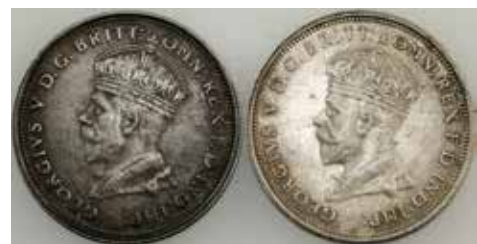
387 1927 Canberra. Toned. (2 coins). aUNC-Ch.UNC