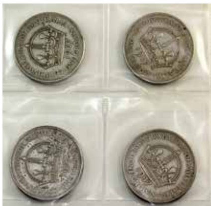
415 1937. Some tone. (4 coins total). gF-gVF