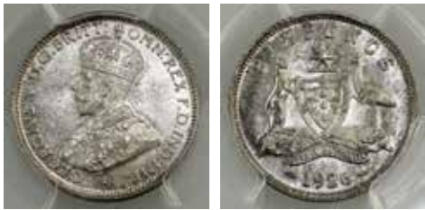
357 1926. PCGS graded MS 63. Light frosty tone with some bloom. Ch.UNC