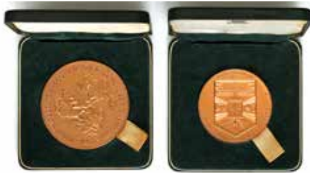
563 Large cased copper medallions. Third World Tobacco Scientific Congress, Rhodesia 1963 and Rhodesia Tobacco Science Institute 1963. Boxes a little damaged/toned. Interesting. (2 items total). UNC