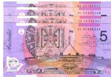
165 1998 polymer MacFarlane-Evans (R 218c), 2002 MacFarlane-Henry (R 220a), (R 220b), (R 220c). Catalogues at $135. (4 notes total). UNC