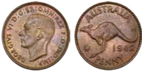
327 1942Y. Dark brown lustre. Ch.UNC