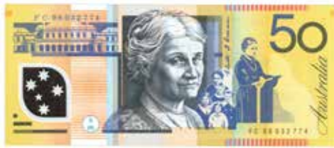
241 1998 polymer MacFarlane-Evans (R 518b). Catalogues at $300. UNC