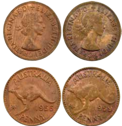
339 1955, 1959. Brown and red. (2 coins total). aUNC-UNC