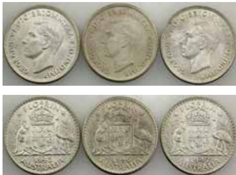
398 1943, 1946, 1947. Some tone. (3 coins total). gEF-aUNC