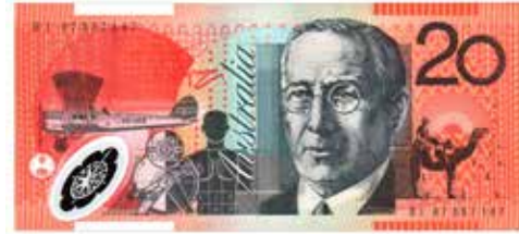
229 1997 polymer MacFarlane-Evans (R 418a). Catalogues at $150. UNC