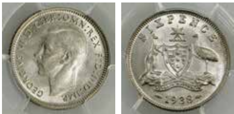
359 1938. PCGS graded MS 65. Light tone with soft mint bloom. GEM UNC