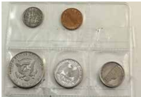
52 USA set of 5 Proof coins 1983S, 1 Cent to Half Dollar. Light tone to 1 Cent. (5 coins total). FDC