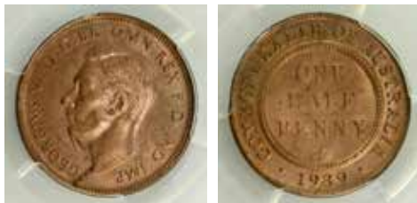
284 1939. PCGS graded MS 64 RB. Commonwealth Reverse. Nearly full mint red. Coin turned in slab. Ch.UNC/GEM