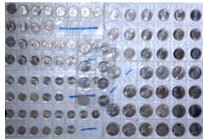
38 South Africa Shilling 1897. Toned. aUNC