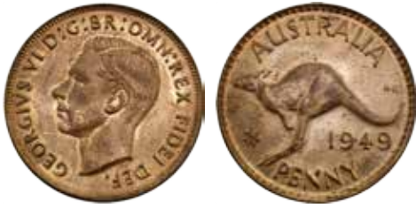
334 1949. Red and brown. UNC