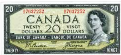
552 Canada 20 Dollars 1954. Beattie-Coyne. (P 70b) Devils Head issue. Folds. gVF