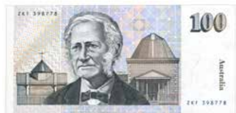
247 1991 Fraser-Cole (R 613). Catalogues at $360. UNC