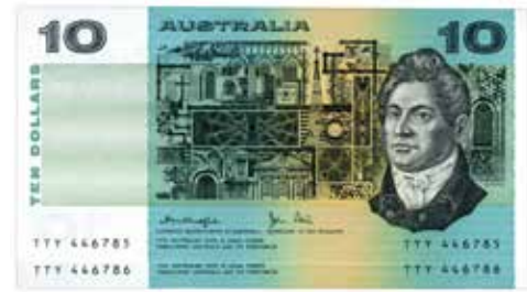
180 1979 Knight-Stone (R 307b). OCR-B. Consecutive pair. Catalogues at $280. UNC