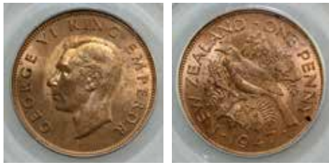
20 New Zealand Penny 1947. PCGS graded MS 64 RD. Mint red. Ch.UNC/GEM