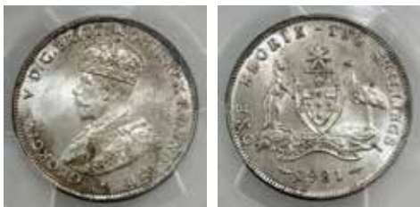
390 1931. PCGS graded MS 64. Nice old tone with mint bloom. Ch.UNC/GEM