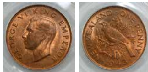
19 New Zealand Penny 1943. PCGS graded MS 64 RD. Mint red. Ch.UNC/GEM