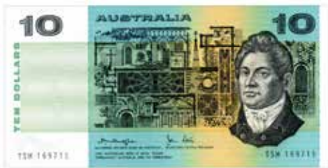
177 1979 Knight-Stone (R 307a). Gothic. Catalogues at $160 in Unc. UNC