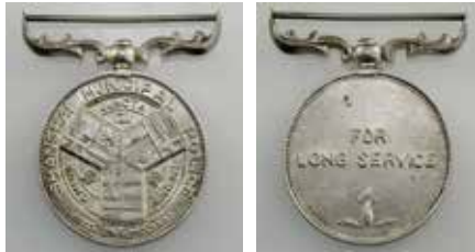
562 Shanghai Municipal Police Long Service medal. gEF