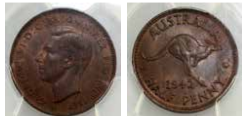
288 1942I. PCGS graded MS 63 BN. Long Reverse denticles type. Some underlying red lustre. Ch.UNC