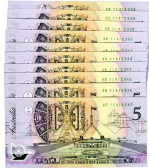
158 1992 polymer Fraser-Cole (R 214i). Medium to light green. Consecutive run of 10. UNC