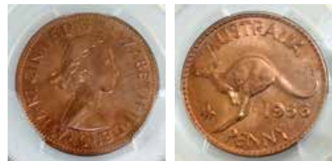
419 1956M. PCGS graded PR 64 RD. Mint red. FDC