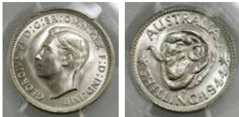
380 1944S. PCGS graded MS 65. Mint bloom. GEM UNC