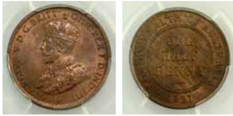
273 1921. PCGS graded MS 64 RB. Mint red and brown. Ch.UNC/GEM