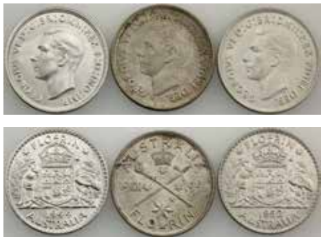
399 1944S, 1951 Federation, 1952. (3 coins total). gEF-aUNC