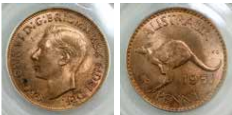
336 1951PL. PCGS graded MS 65 RD. Nearly full mint red. GEM UNC