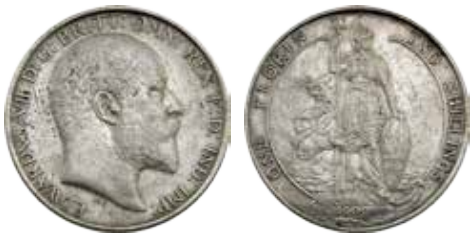
60 Florin Edward VII 1902. VF