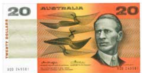
213 1976 Knight-Wheeler (R 406b). Gothic side thread. Flick. Catalogues at $480 in Unc. aU/UNC