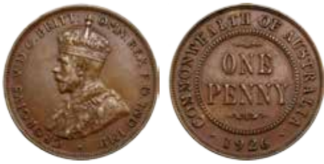
317 1926. Brown. aEF