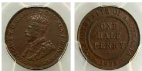
276 1923. PCGS graded AU 53. Brown. Full clear band with all 8 pearls visible and a good Reverse. Rare this grade. aEF/EF