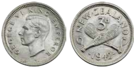
29 New Zealand Threepence 1942. UNC $60 - $70 Start Price $40