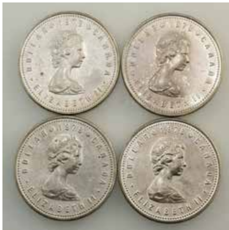
2 Canada silver Dollars 1978. Edmonton Olympics. (4 coins total). UNC