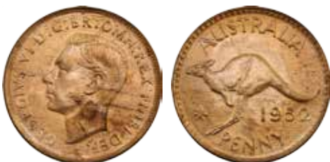
337 1952. Red, minor surface marks. Ex Hagley Collection. GEM UNC