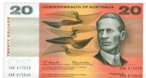
199 1966 Coombs-Wilson (R 401). Consecutive pair. Flattened of centre fold. aUNC