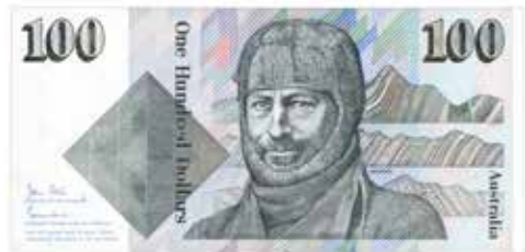
245 1984 Johnston-Stone (R 608). Small spot. Catalogues at $360. UNC