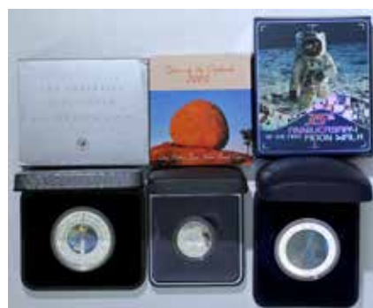
570 2001 Millennium silver 1oz Proof $1, Cleopatras Needle, 2004 First Moon Walk silver 1oz Proof $1. Also included RAM 2002 Year of the Outback $1 silver Proof. In boxes of issue. (3 items total). FDC