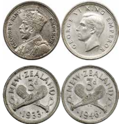
25 New Zealand Threepence 1933, 1946. (2 coins total). UNC