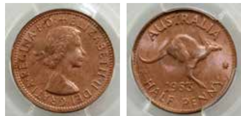
307 1963Y. PCGS graded MS 65 RB. Mostly red lustre. GEM UNC