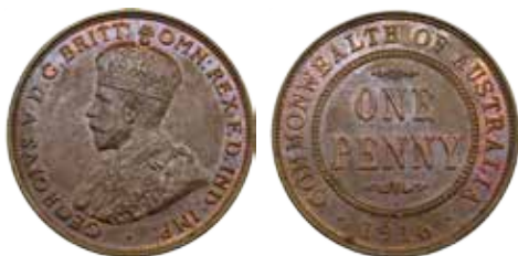
311 1916. Brown with hints of red. Tiny surface mark. EF