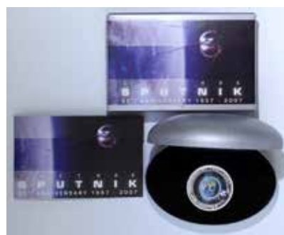
571 2007 Sputnik 1oz silver Proof coin (on Cook Islands $1). In box of issue. FDC