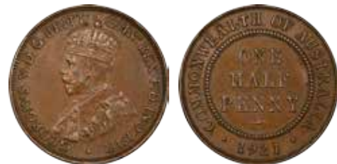
279 1931. PCGS graded AU 58. Some brown lustre. gEF/aUNC