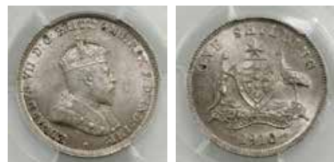
370 1910. PCGS graded MS 63. Light tone. Ch.UNC