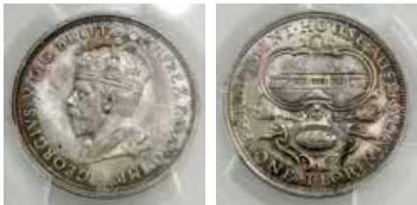
389 1927 Canberra. PCGS graded MS 65. Old toned. GEM UNC