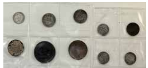
64 Assorted coins in sheets. Includes Groat (Fourpence) 1836, 1840, 1854, Half Farthing 1844, Threepence 1941 (a silver and copper), Sixpence 1891, 1903, Halfpenny 1806, 1902. (10 coins total). VG-UNC