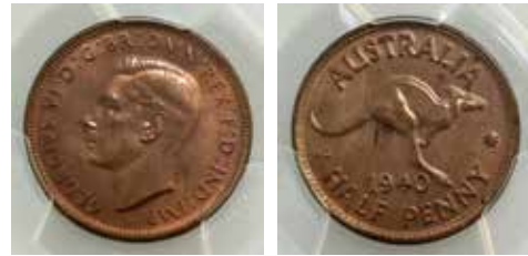
286 1940. PCGS graded MS 64 RB. Ex The Benchmark Collection IAG. Nice mint red and brown lustre. Scarce this nice. Ch.UNC/GEM