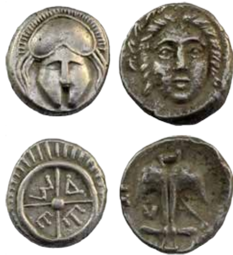
555 Greek 4th Century silver Obols, unidentified. One with Lions head (Bruttium?), one with Female head (Arethusa?). (2 coins total). gF-VF