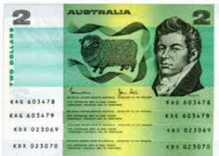
146 1983 Johnston-Stone (R 88). Two consecutive pairs. (4 notes total). aU/UNC