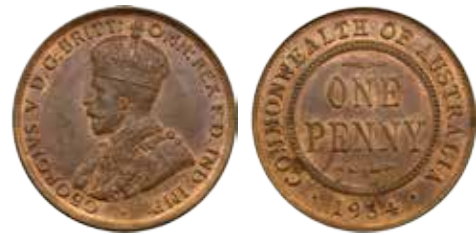
321 1934. Brown and red. gEF-UNC