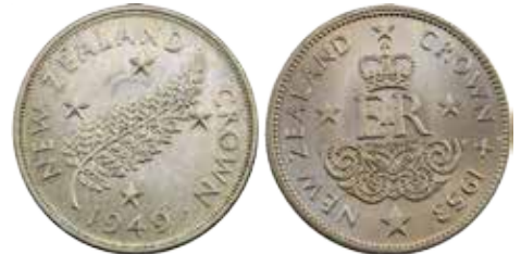
35 New Zealand Crowns 1949 George VI, 1953 Elizabeth II. (2 coins total). Ch.UNC/GEM