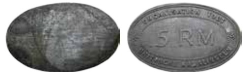
12 Germany 5 RM (Reichsmark) Nazi Germany WW II. Struck (spuriously in the 1970s?) commemorating the German occupation of the Channel Islands, thus issued for the German Todt Organisation. Appears to be struck in zinc. Scarce and interesting. aEF