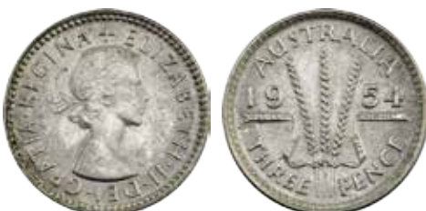
351 1954 GEM UNC