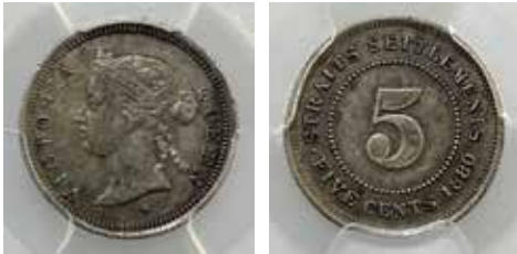
44 Straits Settlements 5 Cent 1880H. PCGS graded XF 45. Toned. Scarce. gVF/aEF