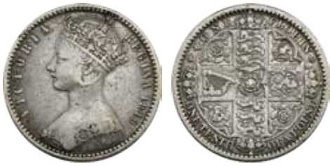
58 Florin Victoria 1849. Godless. Toned. gF/aVF