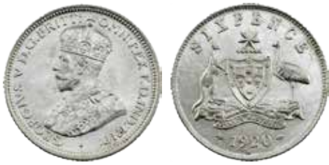
356 1920. Light tone with some bloom, a few minor surface marks. aUNC