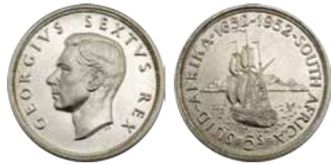
41 South Africa Proof 5 Shillings 1952. Light tone. FDC