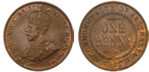
312 1917. Brown with hints of red. EF