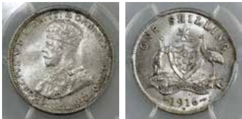
372 1916M. PCGS graded MS 63. Some light tone. Ch.UNC