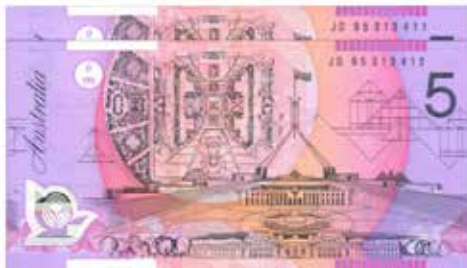
162 1995 polymer Fraser-Evans (R 217ai). Narrow bands. Consecutive pair. Very light depression. Catalogues at $160 in Unc. UNC