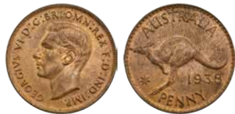
323 1938. Brown with some red. UNC