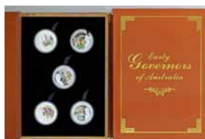
572 Early Governors of Australia set of 5 1oz silver Proof Tuvalu Dollars. In wooden box of issue with slip case, poster and certificate (some environmental damage to box interior). Struck by the Perth Mint and issued by Downies. FDC