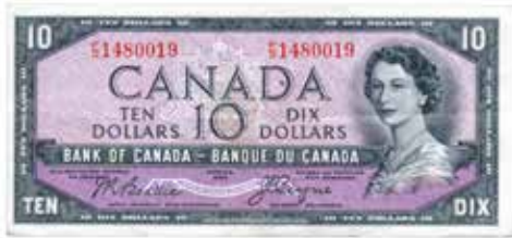
550 Canada 10 Dollars 1954. Beattie-Coyne (P 69b Devils Head issue). gVF