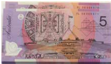
167 2006 polymer MacFarlane-Henry (R 220d). Consecutive bundle of 100 (no wrapper). UNC