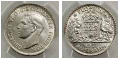
404 1951. PCGS graded MS 63. Ch.UNC $220 - $240 Start Price $80