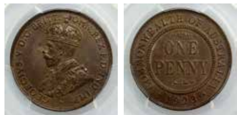
314 1923. PCGS graded MS 62 BN. Trace of some red lustre. UNC/Ch.UNC