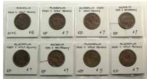
293 1949Y. Mostly brown with hints of red, in flips priced at $63. (8 coins total). aEF-aUNC