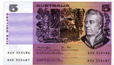
150 1979 Knight-Stone (R 207). Flick. Consecutive pair. aU/UNC