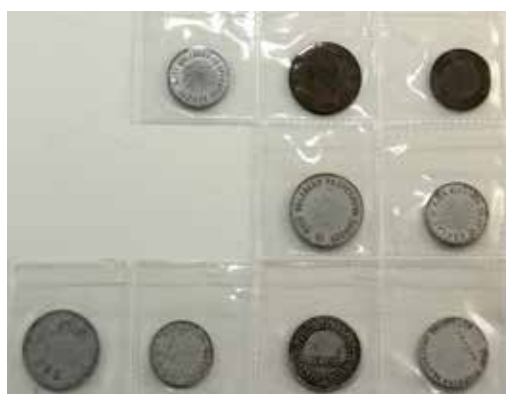
569 West Wallsend Cooperative Society Bakery Bread tokens. Half Loaf (2), One Loaf (2), Halfpenny, Penny, Sixpence, Shilling. Also NSW Masonic Society Sixpence. Appear to be struck in bronze and aluminium. (9 items total). F-VF