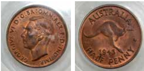
290 1943. PCGS graded MS 64 RD. Mostly mint red. Ch.UNC/GEM