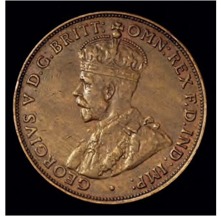
1930 Penny graded XF 45 Sold for $47,770

The Florins included possibly the finest run of George V coins assembled in the one collection, with the MS 64 1932 Florin realising $35,775, whilst a fully struck up "Specimen" 1934/5 Melbourne Centenary Florin with a clearly visible nipple of the rider was knocked down for $20,868. Other Florins of note include a beautifully toned MS 65 1919 Florin which sold for $19,318, whilst the tough