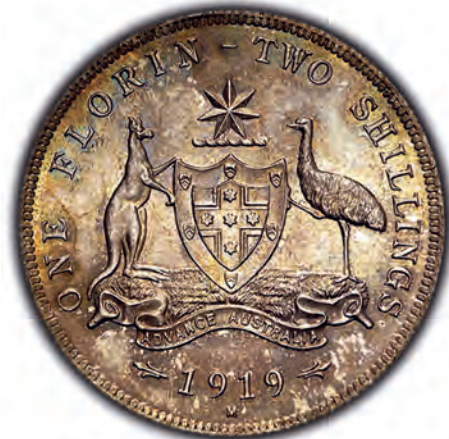
Gem Florin sold for $19,318