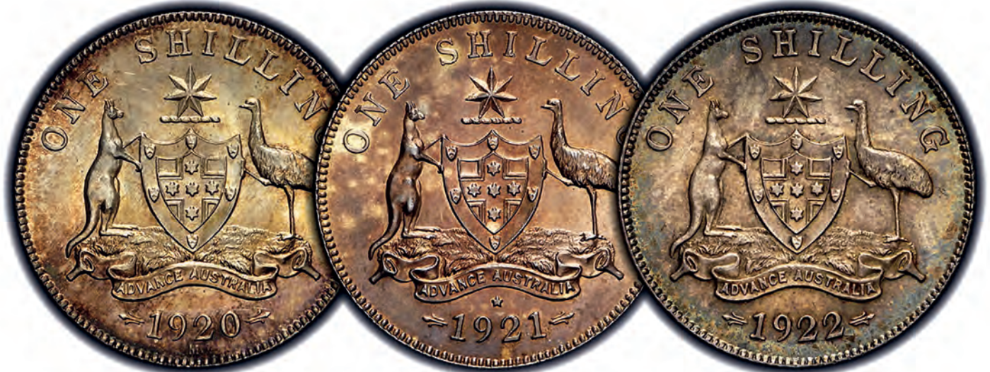
Three Key Shillings sold for $11,925 $14,906 and $11,925