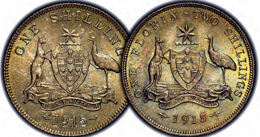
Superb 1915 Shilling and Florin Pair sold for $29,812 and $53,662