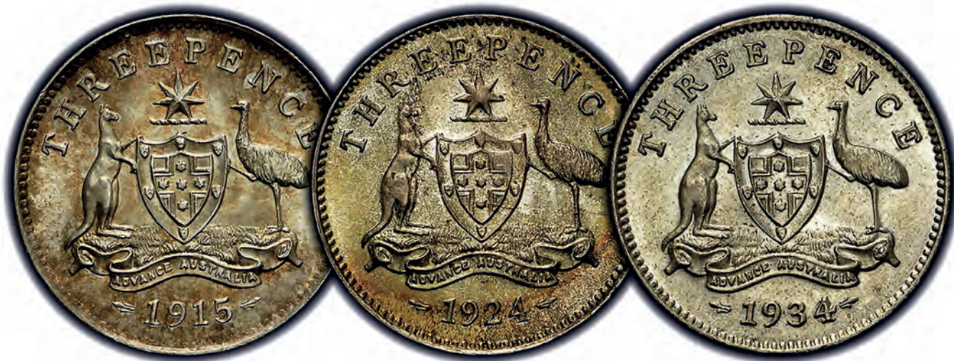
Three Threepences sold for $14,906 $10,732 and $20,868