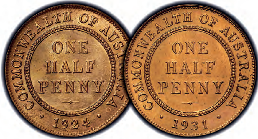
1924 and 1931 Halfpennies sold for $12,879 and $9,778