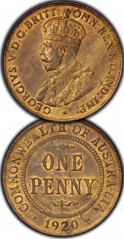
1920 Double Dot Penny sold for $23,850

The superb selection of Shillings were strong, with some lovely deep toned, well struck coins well sought after, with an