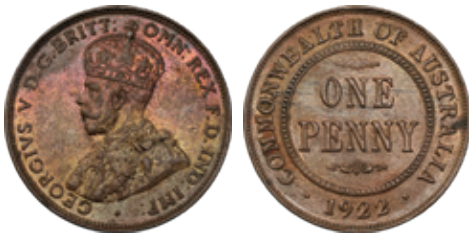
1289 1922. Brown lustre, Obverse with some mint red. UNC