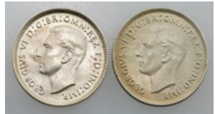
1385 1944S, 1945. Former with bright bloom, latter toned. (2 coins total). UNC