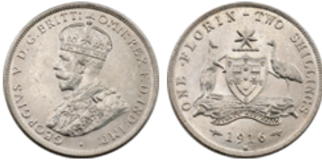
1438 1916M. Soft mint bloom, some surface hairlines. UNC