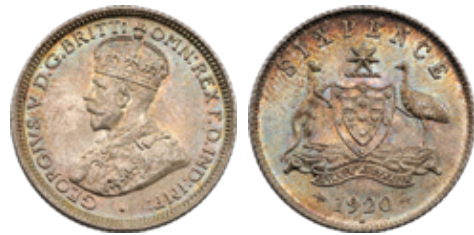
1367 1920M. Attractive old red/blue tone with mint bloom, some Obverse marks. Ch.UNC