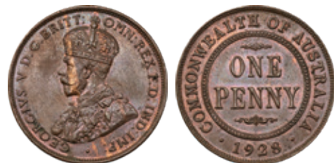
1295 1928. Slightly patchy brown with some red lustre. UNC/Ch.UNC