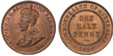
1241 1919. Mostly mint red. Ch.UNC