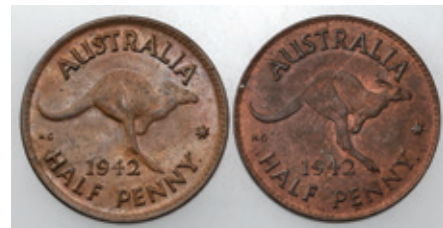
1265 1942Y, 1942I. Mostly lustrous brown. (2 coins total). UNC/Ch.UNC $50 - $60