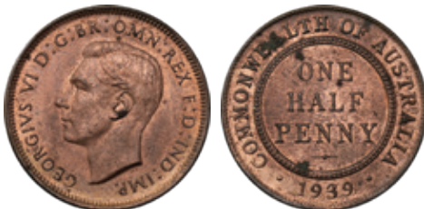
1260 1939. Mint red and brown with some carbon spots. UNC/Ch.UNC $50 - $60