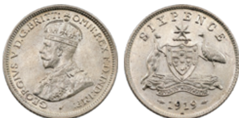
1366 1919M. Light tone with bloom, well struck with a few Obverse marks. UNC/Ch.UNC