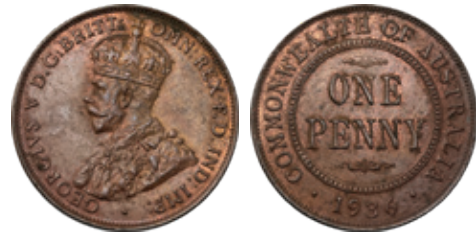
1303 1936. Brown with some red lustre, weak at top scroll. UNC/Ch.UNC