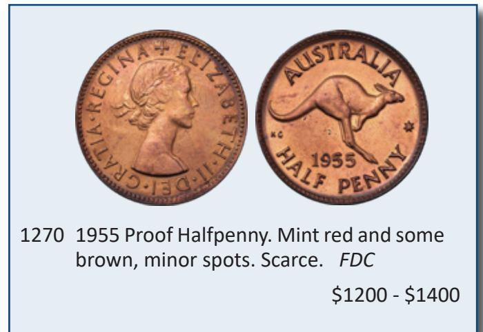
1270 1955 Proof Halfpenny. Mint red and some brown, minor spots. Scarce. FDC