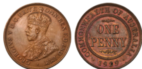
1296 1929. Brown Obverse with a mint red and brown Reverse (probably from storage in a press in album). UNC/Ch.UNC