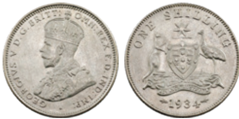
1412 1934. Light gunmetal tone with underlying bloom, light Reverse die crack. A lovely example. Ch.UNC/GEM