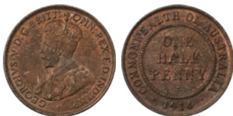
1236 1914H. Brown with hints of mint red. UNC