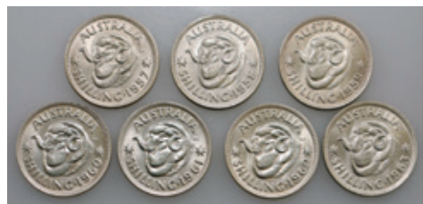
1426 1957, 1958, 1959, 1960, 1961, 1962, 1963. Mint bloom, some light tone. (7 coins total). Ch.UNC-GEM