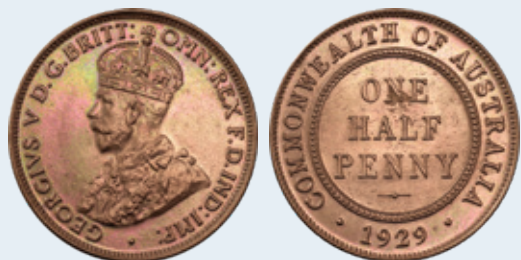
1251 1929. Virtually full bright mint red with traces of attractive greenish lustre. A beautiful, near as struck example and one of the finest known of this tougher date, with none graded MS RD by PCGS. Rare. GEM UNC