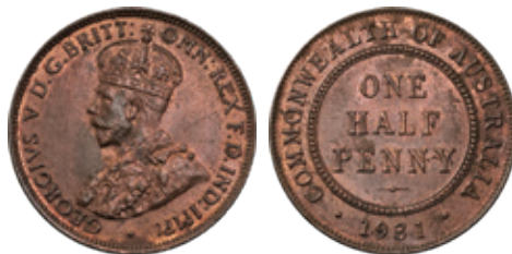
1253 1931. Slightly uneven mint red and brown. Scarce. UNC/Ch.UNC