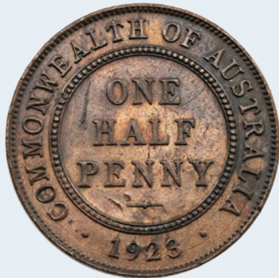
1245 1923. Key date. Light slightly uneven tone with underlying brown mint lustre, eight clear pearls, full centre diamond and complete band. Minor planchet flaws on Reverse with extensive die cracks around legend and a few light marks/hairlines in fields. Very rare in this grade and amongst the finest known. aU/UNC