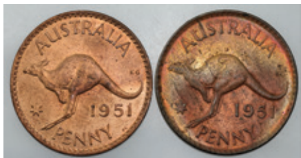
1316 1951PL, 1951Y. Brown with red lustre to mostly red. (2 coins total). Ch.UNC