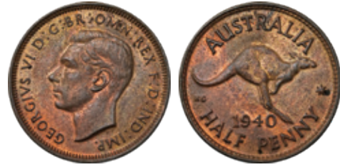
1262 1940. Brown with some red lustre. UNC/Ch.UNC $40 - $50