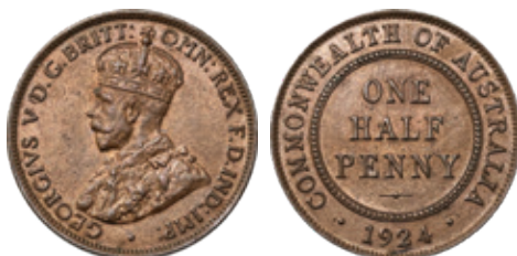
1246 1924. Lustrous mint brown. Scarce. UNC