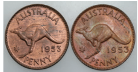
1318 1953, 1953A. Mint red and brown. (2 coins total). Ch.UNC