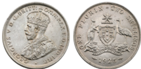
1445 1925. Some slight Obverse flashing and a few minor marks. UNC