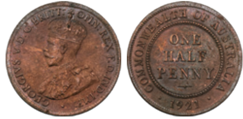
1243 1921. Brown with traces of uneven red. UNC