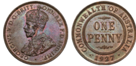
1294 1927. Brown with some reddish rainbow lustre. Ch.UNC