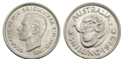
1419 1942. Frosty satin mint bloom, virtually as struck and scarce as such. GEM UNC