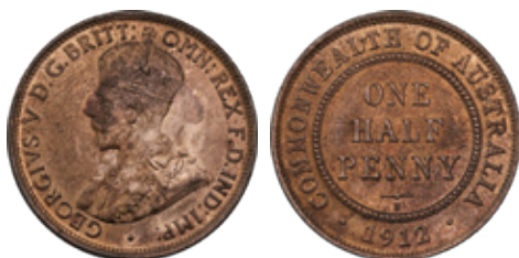
1233 1912H. Mint red and brown. UNC