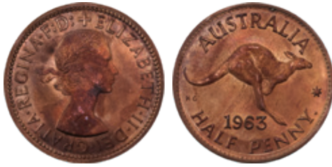
1273 1963Y Proof Halfpenny. Subdued matte dark red/brown tone. aFDC