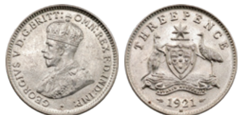
1336 1921M. Frosty mint bloom, a few marks. Ch.UNC $180 - $200