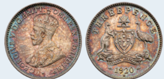
1335 1920M. Beautiful old red/blue toned with underlying mint bloom. Very scarce in this grade, and amongst the finest known. Ch.UNC/GEM $1400 - $1600