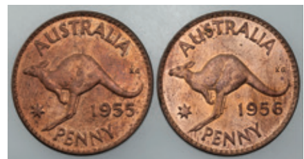
1319 1955, 1956. Mostly red and brown lustre. (2 coins total). Ch.UNC