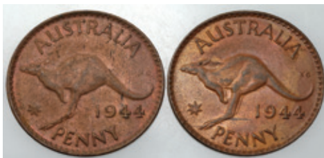
1309 1944, 1944Y. Lustrous brown. (2 coins total). aUNC