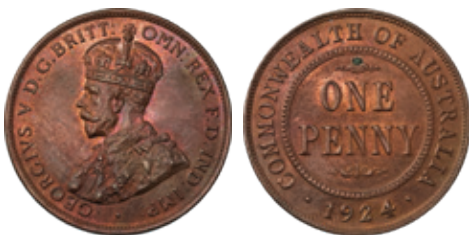
1291 1924. Mint brown and some red lustre, Reverse verdigris spot that appears to have damaged surface. aU/UNC