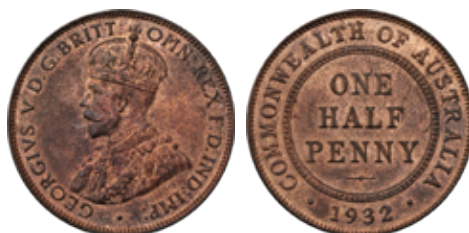
1254 1932. Red and brown. UNC