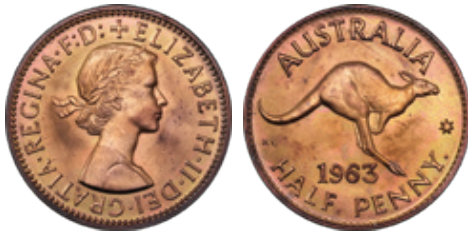
1274 1963Y Proof Halfpenny. Subdued matte red with some tone. FDC