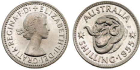
1427 1955 Proof Shilling. Light tone. FDC $100 - $120