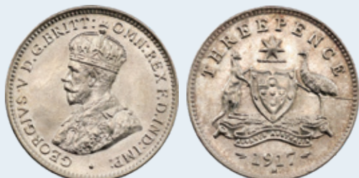
1332 1917M. Light tone with bright bloom. Reverse die crack - Three legged Emu variety. Ch.UNC/GEM $300 - $320