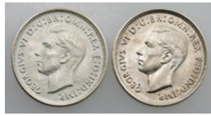
1384 1943D, 1943S. Light hint of tone. (2 coins total). UNC/Ch.UNC