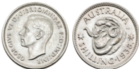
1415 1938. Mint bloom, a few Obverse marks. UNC/Ch.UNC