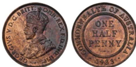
1255 1933. Uneven partial brown and some red lustre. UNC/Ch.UNC