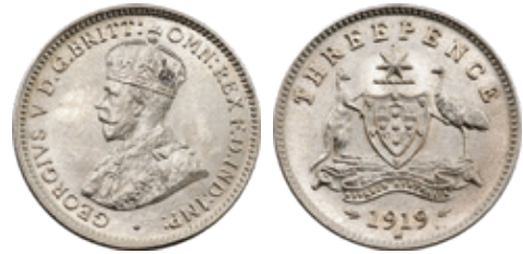
1334 1919M. Frosty mint bloom, a few marks. Ch.UNC $280 - $300