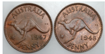
1312 1947Y, 1948Y. Brown lustre with hints of red. Scarce dates. (2 coins total). UNC