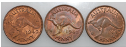
1308 1942I, 1943Y, 1943I. Brown with subdued red lustre. (3 coins total). UNC