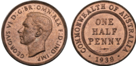
1259 1938. Mostly mint red. Ch.UNC $80 - $100