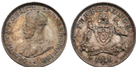
1331 1916M. Dark old attractive reddish/blue toned with underlying mint bloom, a few minor marks. Very scarce. Ch.UNC/GEM $900 - $1000