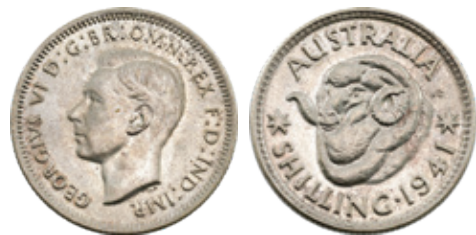
1418 1941. Light steel tone with bright mint bloom. Ch.UNC