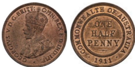
1232 1911. Mint red and brown. UNC