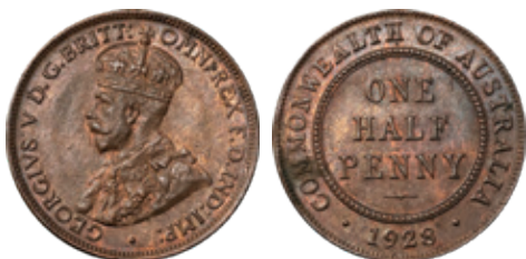
1250 1928. Brown with some uneven red lustre, a few spots. UNC/Ch.UNC