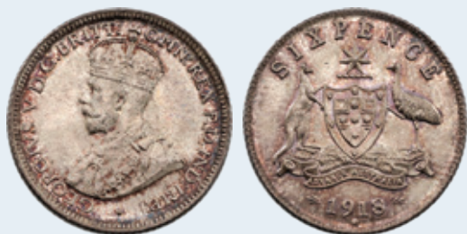
1365 1918M. Old steel-toned with hints of red with mint bloom. Sharply struck with lovely eye appeal. With old pack stating - One of the finest known, superb uncirculated MS 64. One of the finest known and rare in this condition. Ch.UNC/GEM