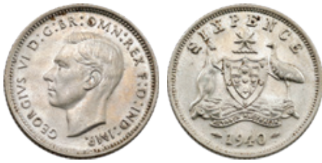
1380 1940. Slight tone with bloom. Ch.UNC