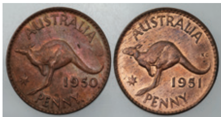
1315 1950Y, 1951. Brown with red lustre. (2 coins total). UNC-Ch.UNC