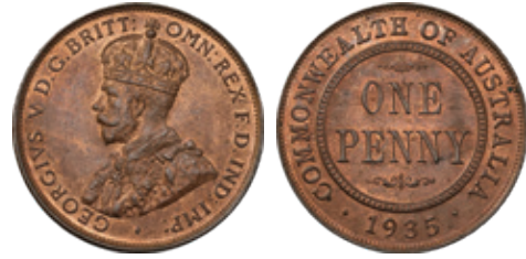
1302 1935. Brown and mint red lustre. Ch.UNC