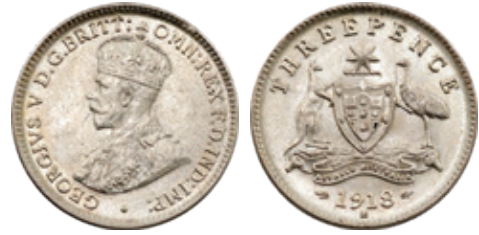
1333 1918M. Frosty mint bloom, a few marks, edge knock. Ch.UNC $280 - $300