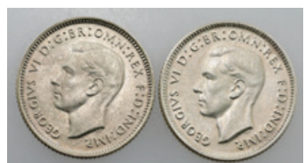
1386 1946, 1948, Light tone. (2 coins total). UNC/Ch.UNC