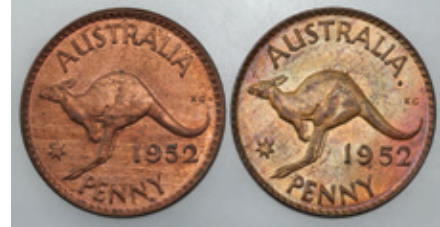
1317 1952, 1952A. Mostly mint red to mint red. (2 coins total). Ch.UNC-Ch.UNC/GEM