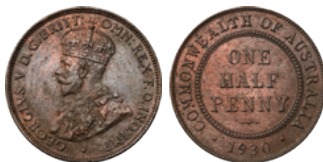
1252 1930. Brown with some underlying mint red lustre. UNC