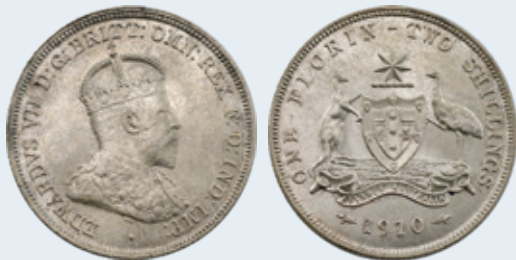
1430 1910. Light old tone with frosty mint bloom, well struck with sharp feathers, some hairlines/scratching in fields behind Kangaroo and a few Obverse marks. Ch.UNC $2300 - $2400