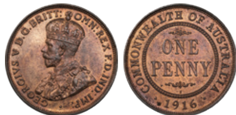
1280 1916I. Mint red and brown. Ch.UNC