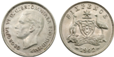
1382 1942. Frosty mint bloom. Ch.UNC/GEM