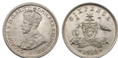
1370 1923. Light tone with some bloom. UNC