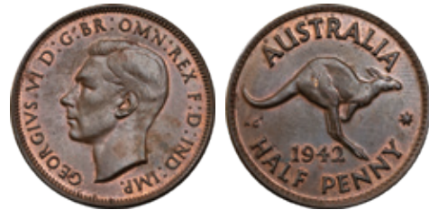
1264 1942. Mint brown with some red lustre. UNC/Ch.UNC $70 - $80