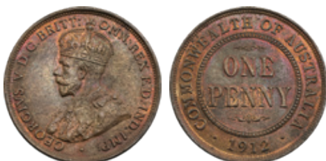
1276 1912. Mint brown with some red lustre. UNC/Ch.UNC