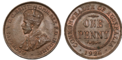
1293 1926. Brown lustre with traces of red, some edge knocks. UNC