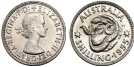
1428 1955 Proof Shilling. FDC $100 - $120