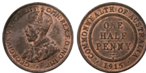
1237 1915H. Key date. Mint brown and red, tone a little uneven on Obverse, hairline behind kings head. Scarce. UNC