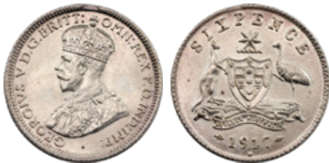
1364 1917M. Light tone with mint bloom, tiny edge clip on top rim. Ch.UNC