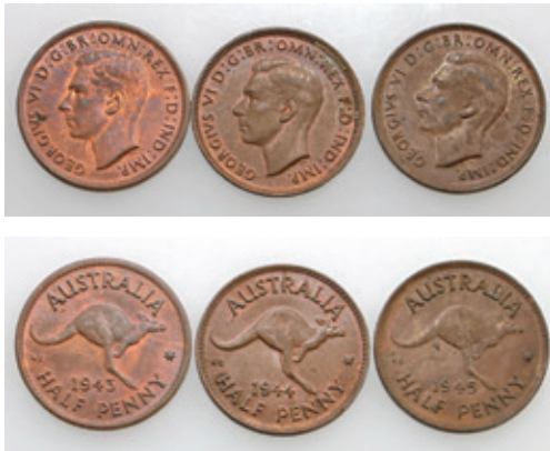
1266 1943, 1944, 1945. Brown. (3 coins total). EF-UNC