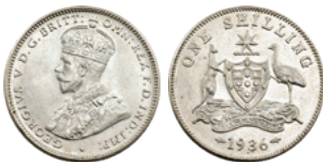
1414 1936. Light tone with frosty mint bloom. Ch.UNC/GEM