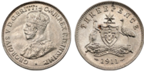
1328 1911. Light tone with mint bloom. Ch.UNC $340 - $360