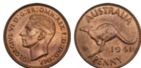
1306 1941. Lustrous mostly mint red. Ch.UNC