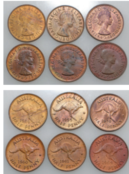
1269 1954, 1955, 1959, 1960Y, 1961Y, 1964Y. Mostly red/brown. (6 coins total). UNC-Ch.UNC