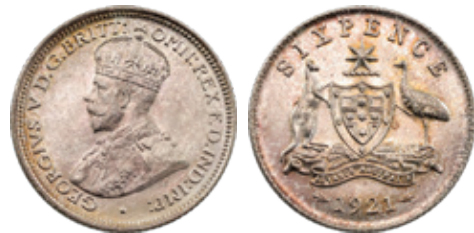
1368 1921. Light reddish toned with mint bloom, a few minor marks. Ch.UNC