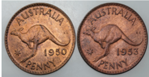
1314 1950, 1953. Mint red, mint red and brown. (2 coins total). UNC-Ch.UNC