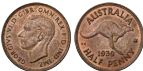
1261 1939 Roo. Light brown with some trace of underlying lustre. UNC $240 - $260