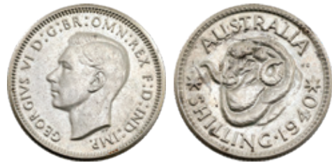
1417 1940. Light tone with bright mint bloom. Scarce. Ch.UNC