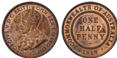
1240 1919. Mint red and brown. UNC/Ch.UNC