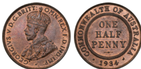
1256 1934. Brown with some red lustre. UNC/ Ch.UNC