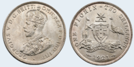
1442 1921. Light old tone with satin mint bloom, some Obverse hairlines with a large flash in front of Kings face. Scarce. Ch.UNC