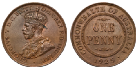
1292 1925. Key date. Brown lustre with trace red, Small Obverse planchet flaw at edge of Kings Crown and at left to edge, but otherwise seven pearls visible. very scarce. aUNC