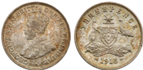
1330 1915. Light old reddish toned. gVF/aEF $130 - $140