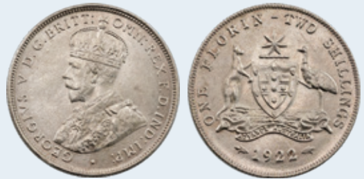
1443 1922. Light tone with some bloom, orange peel surfaces. Scarce. UNC/Ch.UNC