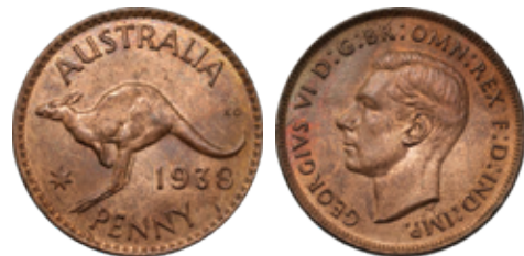
1304 1938. Mint red and brown lustre. Ch.UNC