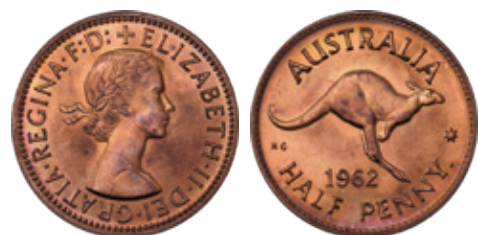
1272 1962Y Proof Halfpenny. Matte red with some tone. FDC