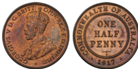
1238 1917I. Mint red and brown with some bright lustre. UNC/Ch.UNC