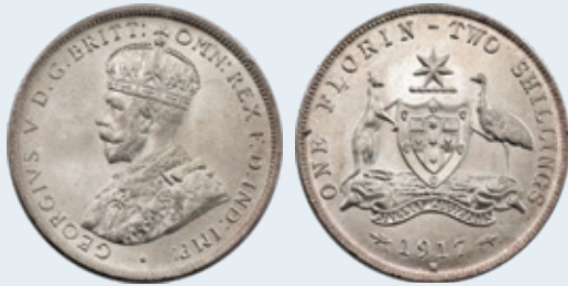
1439 1917M. Superb strike with bright mint bloom and a touch of soft tone. Ch.UNC/GEM