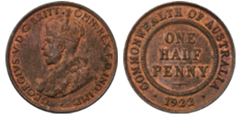
1244 1922. Brown with some mint red, Obverse spot. UNC