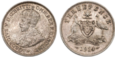
1329 1914. Old stipple toned with underlying bloom. aUNC $260 - $280