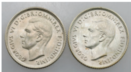
1383 1942D, 1942S. Light tone with frosty bloom. (2 coins total). Ch.UNC/GEM