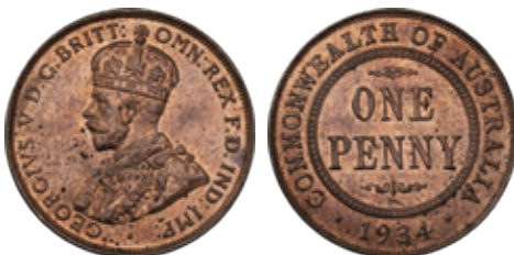
1301 1934. Mint red and brown lustre, some slight Obverse spotting. Ch.UNC