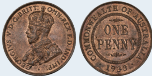
1299 1933/2 Overdate. Mint red and brown lustre, and well struck. Rare in this grade and one of the finest known. UNC/Ch.UNC