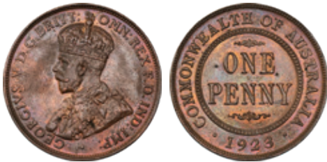
1290 1923. Mint brown and red lustre. Well struck. Scarce. Ch.UNC