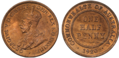
1242 1920. Subdued mostly mint red, minor Obverse spots. Ch.UNC