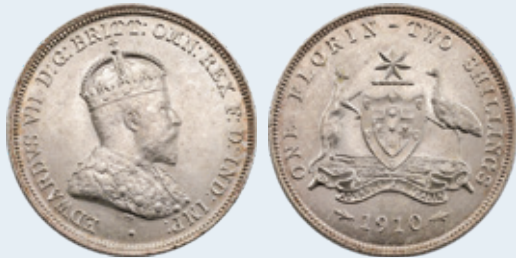
1429 1910. Light old tone with mint bloom, a sharp reverse with some Obverse contact marks. UNC/Ch.UNC $1800 - $2000