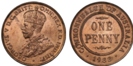
1300 1933. Mostly mint red with a few tone spots. Ch.UNC/GEM