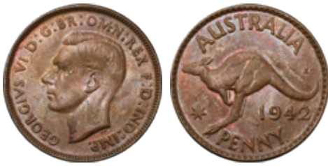
1307 1942Y. Mint brown. UNC