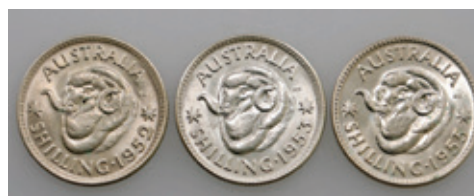
1425 1952, 1953, 1955. Light tone with some bloom. (3 coins total). UNC-Ch.UNC/GEM