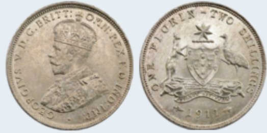
1431 1911. Light golden tone with mint bloom, a few surface marks and minor edge knocks, otherwise a sharp example of this tough date. Rare in this condition. Ch.UNC $6000 - $7000