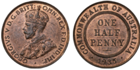
1257 1935. Mint red and brown. UNC/Ch.UNC $150 - $160