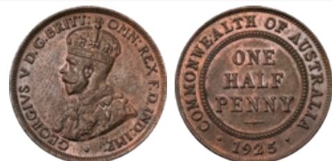
1247 1925. Brown with some red lustre. Scarce. UNC/Ch.UNC