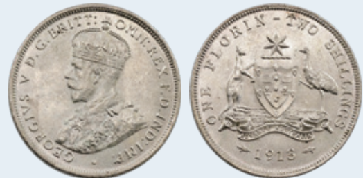
1433 1913. Light tone with some frosty mint bloom, some Obverse surface marks/hairlines on Kings face with a small edge knock, but well struck up for this date with a nice Reverse. Rare this condition, and amongst the finest known. UNC/Ch.UNC $6000 - $7000