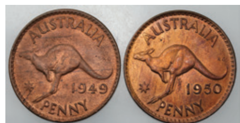
1313 1949, 1950. Mostly mint red. (2 coins total). Ch.UNC