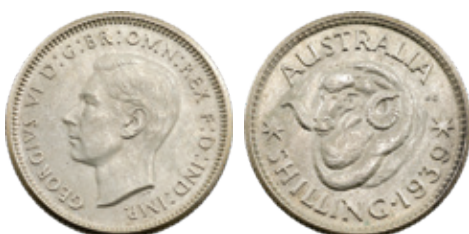
1416 1939. Light soft tone with underlying bloom. Ch.UNC/GEM