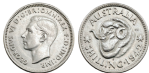
1420 1942S. Bright bloom. Ch.UNC