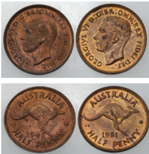
1267 1946, 1951. Mint brown and red. Former rotated slightly. (2 coins total). UNC