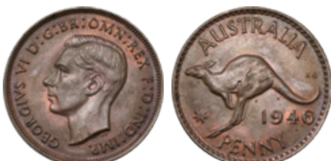
1310 1946. Key date. Lustrous dark brown with some mint red. Scarce. UNC