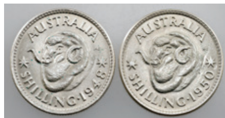
1424 1948, 1950. Frosty mint bloom. (2 coins total). UNC/Ch.UNC