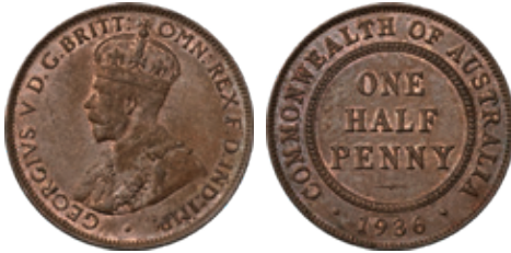
1258 1936. Brown with hints of mint red. UNC $80 - $100