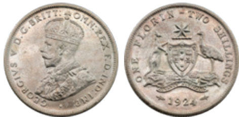
1444 1924. Sharp strike with bright mirror bloom, but some Reverse scratches/hairlines. UNC