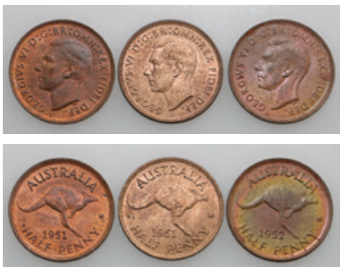
1268 1951Y, 1951PL, 1952. Red/brown, last with rainbow lustre. (3 coins total). UNC/Ch.UNC