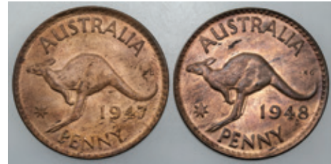
1311 1947, 1948. Mostly mint red. (2 coins total). Ch.UNC