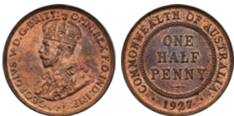
1249 1927. Mint red and brown, a few spots. Ch.UNC