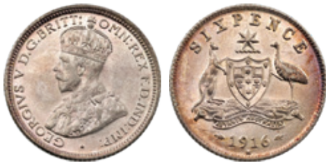
1363 1916M. Light reddish toned with mint bloom, a few Obverse marks. UNC/Ch.UNC