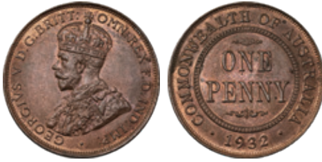
1298 1932. Mint brown and some red lustre. Ch.UNC