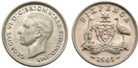
1381 1941. Slight tone with bright bloom, Obverse reeding marks. Ch.UNC