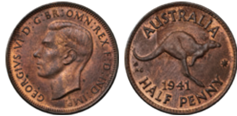
1263 1941. Brown with some uneven red lustre. UNC/Ch.UNC $40 - $50