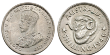
1423 1946 Double dot. Light tone with slight verdigris. UNC