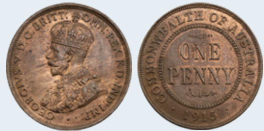
1278 1915. English Obverse. Brown with some slightly uneven red lustre. Scarce. UNC/Ch.UNC