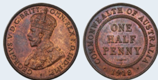
1239 1918I. Key date. Lustrous brown and mint red/blue. Wells truck and very scarce in this grade. Ch.UNC