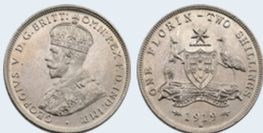
1441 1919M. Light tone with frosty mint bloom, well struck with some hairlines. Very scarce. Ch.UNC