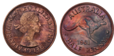
1271 1961Y Proof Halfpenny. Matte, uneven brown toned. aFDC