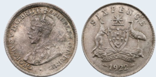
1369 1922. Dark gunmetal toned, well struck for this issue, some minor Reverse die cracks and planchet flaw. Very scarce. Ch.UNC