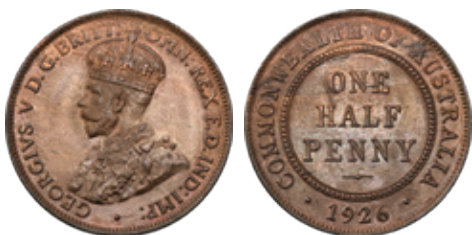
1248 1926. Mint brown with some red lustre. UNC/Ch.UNC