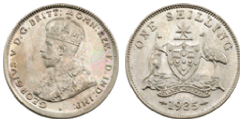
1413 1935. Light tone with slight rainbow colour to Obverse with some bloom. Ch.UNC