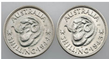
1422 1943S, 1944S. Bright mint bloom. (2 coins total). Ch.UNC/GEM