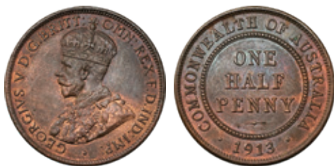
1234 1913. Brown with some red/blue lustre UNC/Ch.UNC