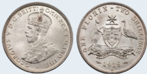
1440 1918M. Superb strike with frosty mint bloom and a tone spot on Obverse, some surface marks/flashing behind Emus head. Ch.UNC