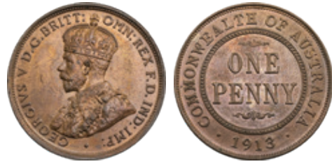
1277 1913. Even brown with subdued red lustre. A well struck example. Ch.UNC