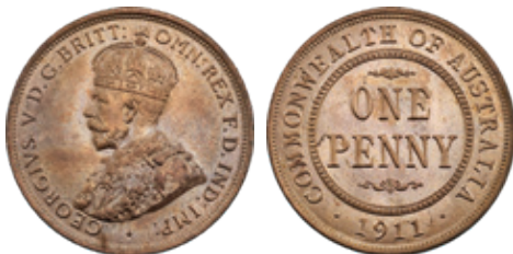
1275 1911. Almost full mint reddish lustre, probably a Baldwins example, with minimal wear and only a few minor marks. Ch.UNC/GEM