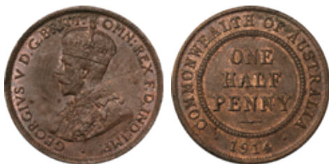
1235 1914. Brown and some red lustre. UNC