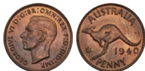
1305 1940. Lustrous mint red and brown. Ch.UNC