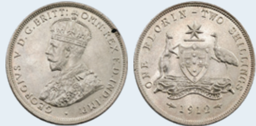
1432 1912. Light tone with bloom, tone spot on Obverse edge with some slight reverse flashing with a few minor marks and some edge knocks with a sharp band and star. Well struck for this tough date. Rare this condition. UNC/Ch.UNC $4500 - $5000