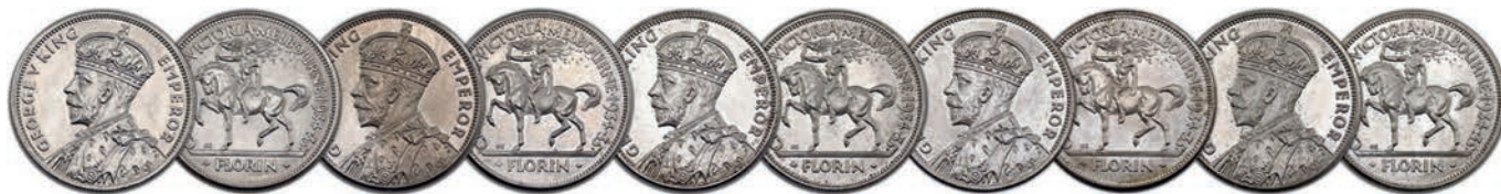
Proof and Specimen Melbourne Centenary Florins ex Klaus Fords Estate