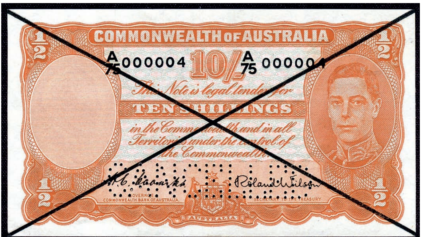
A Rare 10 Shillings issue from 1952 estimated at $25,000.