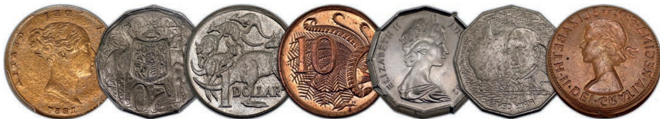
A Selection of some of the Major Misstrikes in Sale 93