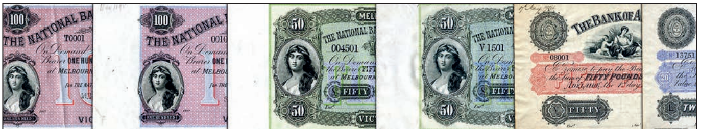
Part of a Large selection of in demand Pre Federation issues