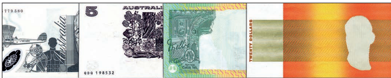
A few key lots from the huge selection of Misprinted Banknotes

Mis-Struck coins including some of the most significant errors we have ever seen! The sheer quantity of the error collection and some Pre Federation will see it split over the next two major sales.