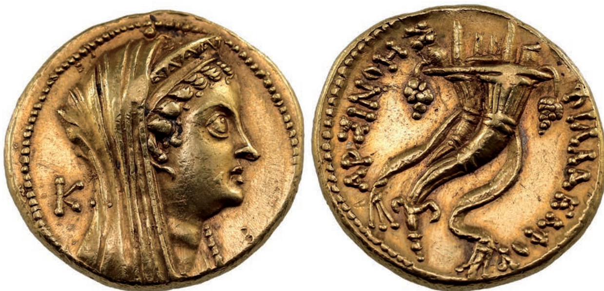
A Supern Egypt Ptolemy II Octadrachm Estimated at $17,000