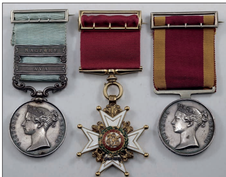
A Rare British India Medal group Sold for $10,004

One of the key collections featured in this sale was an old British collection of Crowns, featuring several rare coins such as the Cromwell and Commonwealth issues in superior high grade. The top price from these went to a beautiful Gothic Crown which realised more than 5 times estimate at $26,840, finally selling after an epic battle of 72 bids, with the 10 bidders from all over the world! Choice examples of a 1652 Commonwealth Crown and a 1658 Cromwell Crown were also strongly sought after, selling well above estimate at $12,810