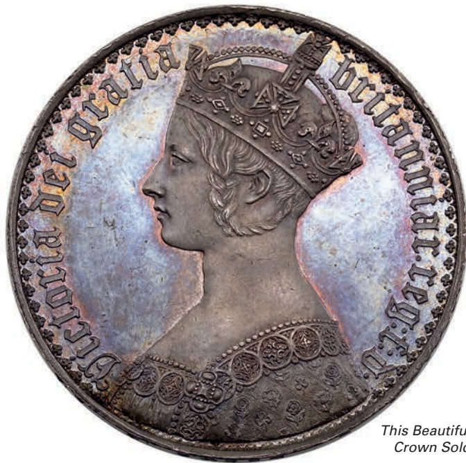
This Beautiful British Gothic Crown Sold for $26,840.