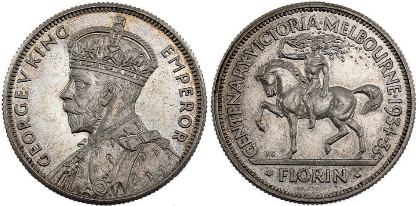
A Specimen Melbourne Centenary Florin from the Estate of the late Klaus Ford Sold for $26,840

and $20,740 respectively. Also from this same collection was a selection of rare early military medals, with the top price going to a British-India trio selling for $10,004.