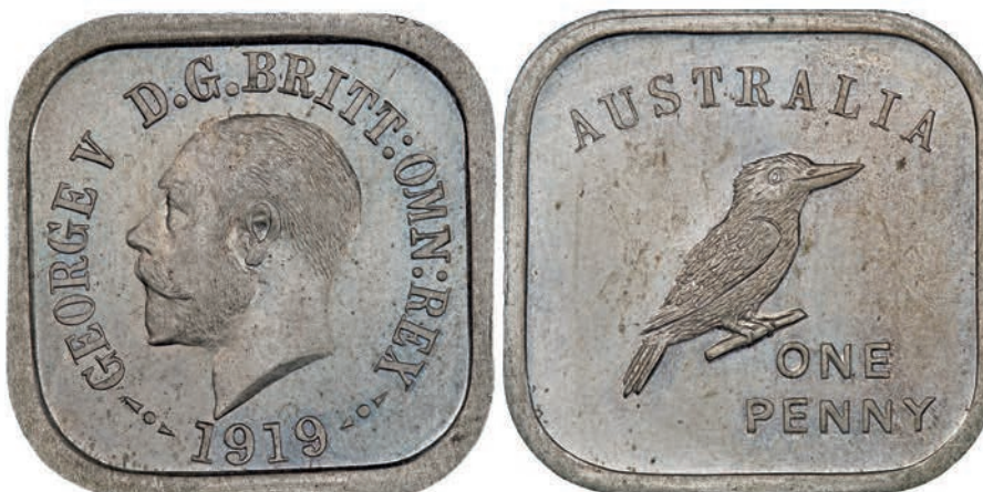
A Type 3 Kookaburra Penny graded SP 65 Sold for $39,650