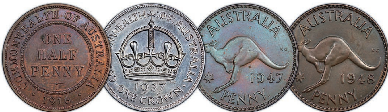
These Four Proofs Sold for $10,248, $20,740, $11,712 and $17,690 respectively