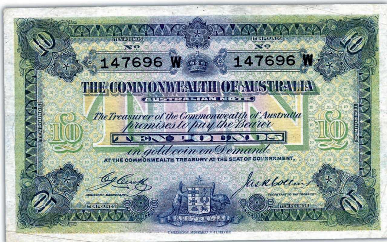
A rare 10 Pound 1918 Sold for $33,550