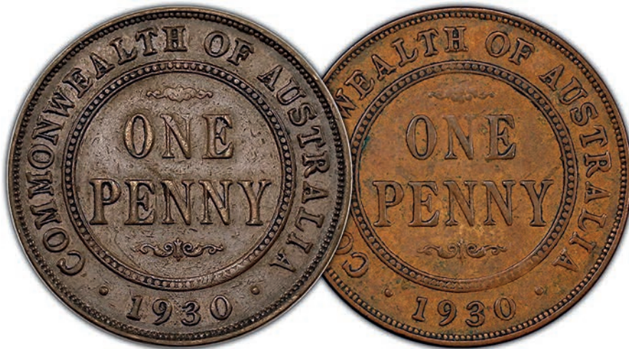
Both of these 1930 Pennies were knocked down for a strong $24,400