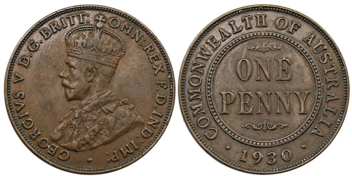
One of four 1930 Pennys in higher grade.

a Type 3, Type 6 and Type 12. The Type 3 and Type 6 examples of this attractive and rare issue have been missing from auction for a period of time, so the pentup demand is sure to be high for these two choice grade examples, especially at the estimated prices of only $35,000 each. Four 1930 Pennies, Three Adelaide Pounds, a Taylor Pattern Sixpence in silver, two 1921/22 Overdate Threepences and a large selection of rare Pre Decimal proofs including a 1938 Crown showcase the depth of rare material on offer in Sale 96.