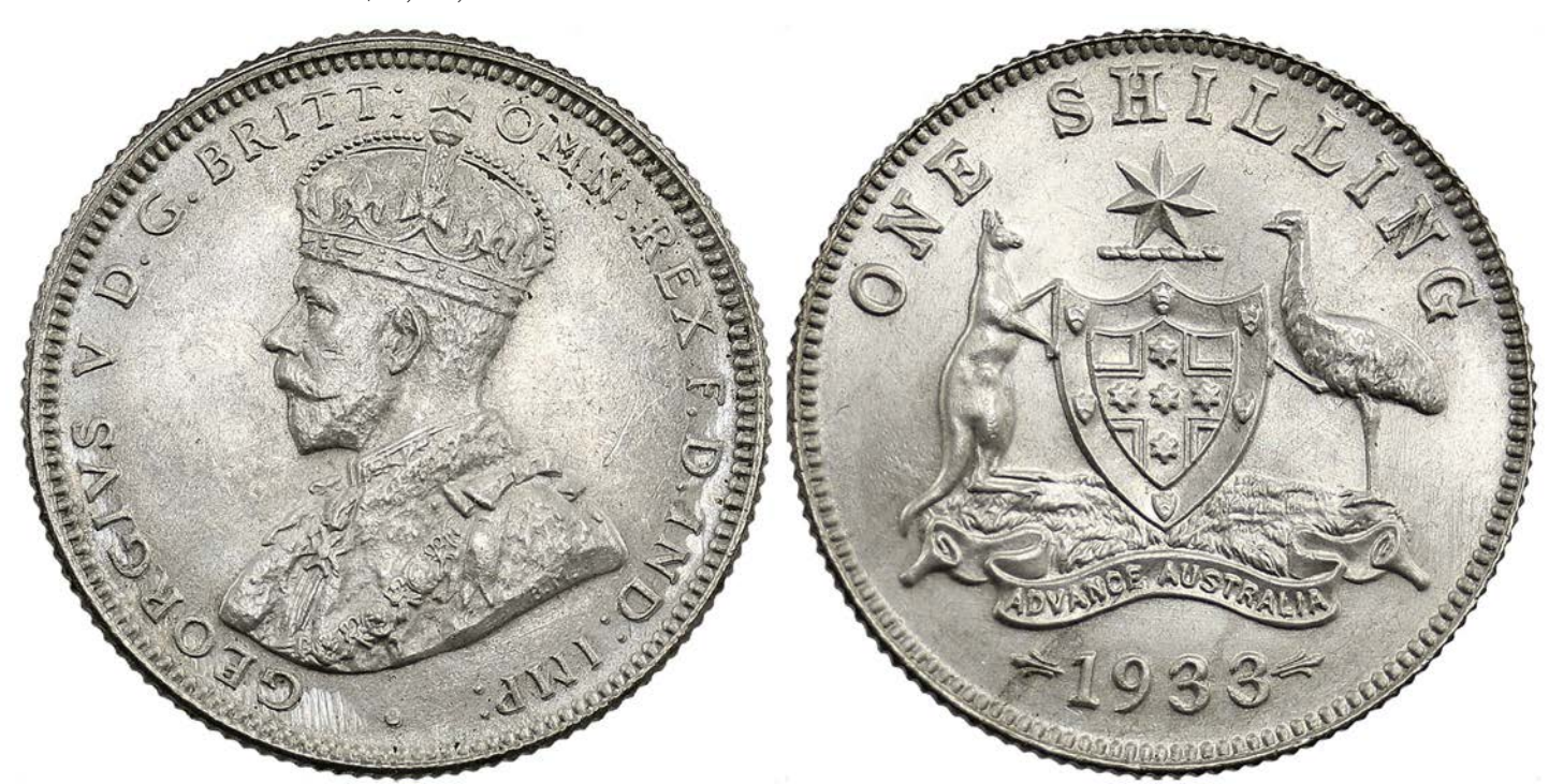
A near gem 1933 Shilling from the old 1950s Predecimal Collection.