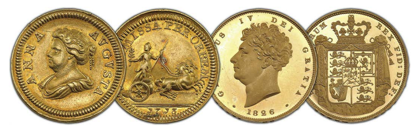
Two very rare rare British coins, the superb Queen Anne Pattern struck in gold and the gold proof 1826George IV two pounds in FDC.