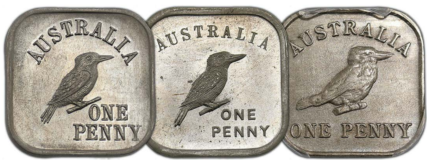
3 Rare Kookaburra Pennies on offer in Sale 96. Types 3, 6 and 12

The rarities keep on coming, with three different Kookaburra Pennies on offer,