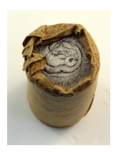
375 1962. Mint roll. Plain paper, some damage. Assumed all UNC