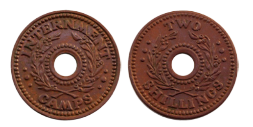
258 Two Shillings Internment Camp token WW II. Dark even brown. aU/UNC