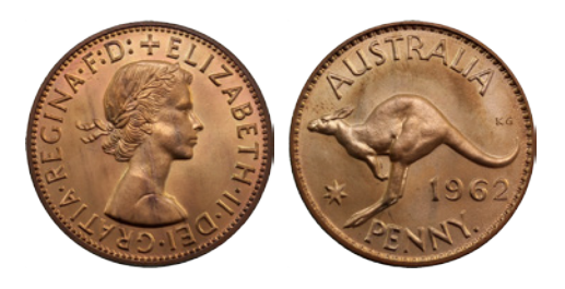
256 Proof Penny 1962Y. Light tone. FDC