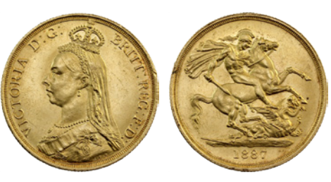
142 Gold Two Pound Victoria 1887. Jubilee Head. Some bloom with light surface marks. aEF