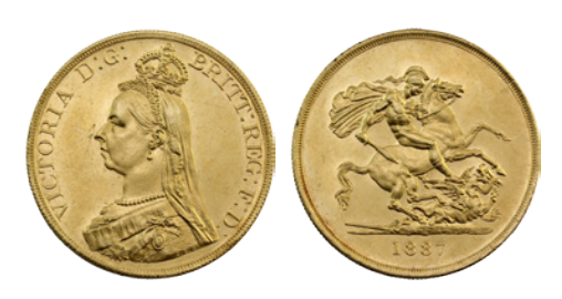
143 Gold Five Pound Victoria 1887. Jubilee Head. Edges scuffed, a few minor marks. aEF/EF