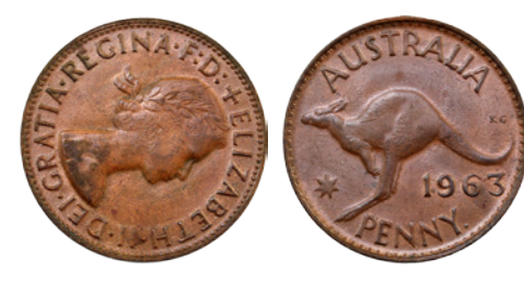
294 1963. Die rotated 90 degrees. Brown lustre. aUNC