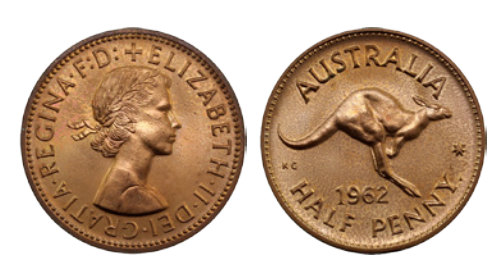
255 Proof Halfpenny 1962Y. Light tone. FDC