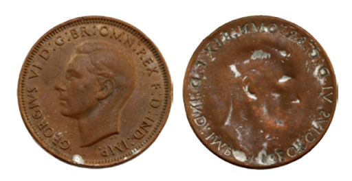
N/D (1942-43). Full brockage on Reverse. Has been partially silvered to highlight details (assumed with silver marker?). Rare error. VF